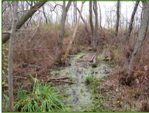
Isolated wooded wetland targeted for restoration of connectivity to larger marsh complex.

Currently, Blasdell Creek meanders through a degraded marsh within the park before reaching Lake Erie, and this 9-acre wetland complex would be the target of one of the enhancement efforts. Natural hydrology has been disrupted, but by restoring contact between the creek and wetland, beneficial wetland functions such as improved hydrologic retention, nutrient and sediment trapping, and microbial processing would significantly improve the quality of this coastal stream, while