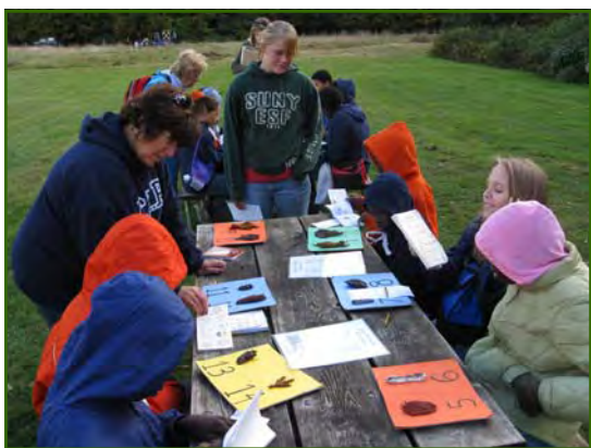
Student volunteers from SUNY College of Environmental Science and Forestry provide instruction for the always popular animal tracks activity.