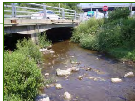
Sampling station along Rush Creek.

identify additional sources of bacterial contamination. DEC's Biomonitoring Unit would also work in the streams by kick sampling for benthic macroinvertebrates and characterizing the in-stream and riparian habitat.