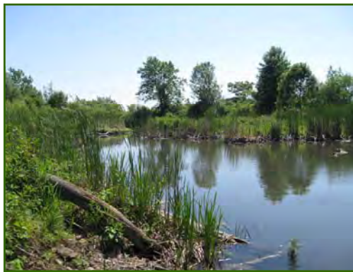
Blasdell Creek wetland –2009

also enhancing wildlife habitat. Work would be conducted in conjunction with Buffalo State College to monitor the water quality and hydrology of the wetland. In addition to water contamination, the streams has been infested by sizeable populations of invasive plant species, which limit habitat diversity and quality. Invasive control programs would be implemented, along with the introduction of a diverse suite of native wetland plants appropriate to the region.