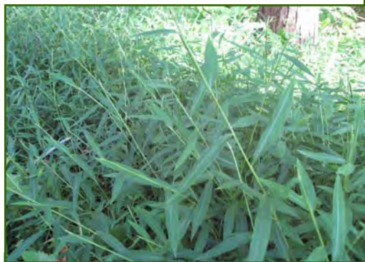
Japanese stilt grass if left unchecked can spread rapidly and out-compete native vegetation. The distinct white, shiny mid-vein on the leaf of this annual grass often aids in identification.

Shores carefully removing hundreds of individual swallow-wort plants. All involved are excited to see results of these manual removal projects by finding no swallow-wort during the growing season of 2010.