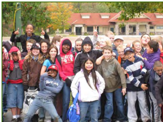
Sixth grade students from Nate Perry Elementary School celebrate Environmental Field Days at Green Lakes SP. The new bathhouse that appears in the background is a facility that was awarded the 2009 Structures Project of the Year by the Central New York Branch of the American Public Works Association.