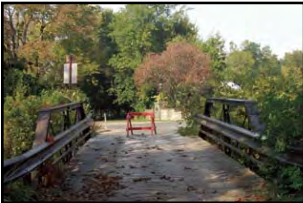
Spur Trail South: The trail will cross Buttermilk Creek on an existing bridge. The bridge is currently used by pedestrians and occasionally by park maintenance vehicles.