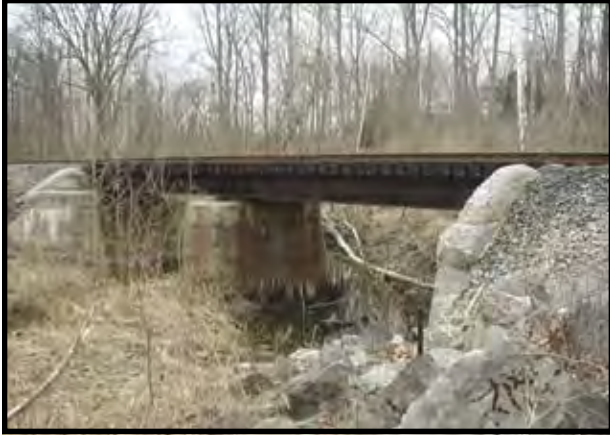
SP 9+000: The trail is proposed to cross the active railroad line under the east (right) bay of this bridge structure. The trail will have to be protected from above with metal or concrete box culvert.