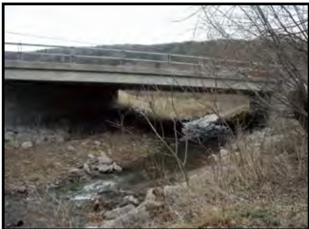
SP 1+500: The trail will cross the intermittent creek on a new trail bridge, then pass under N. Y. S. Route 13 on north side of creek. Trail surface will be concrete under the bridge.