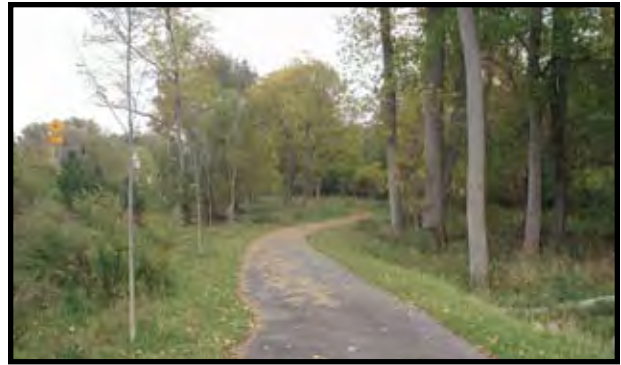
Spur Trail South: View northeast on existing asphalt trail constructed by NYSDOT as part of the N. Y. S. Route 13 project. This trail links the future bridge over the Cayuga Inlet to the Larch Meadow Trail.