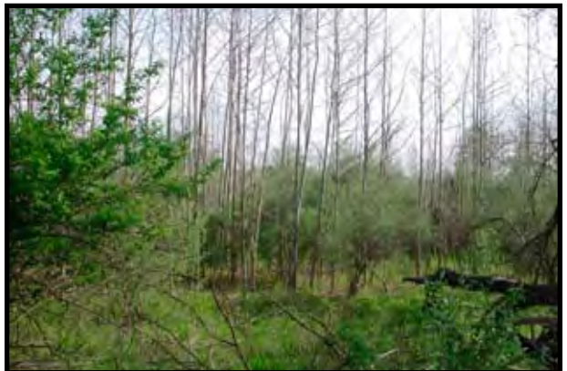
SP 11+800: North of Buttermilk Creek the proposed trail passes through a successional meadow/old field. Numerous invasive Russian olives should be removed in this area as the trail is developed.