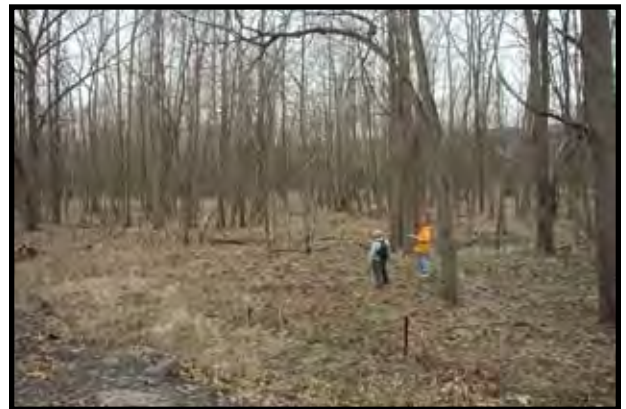
SP 8+800: View south of forest from Norfolk Southern Railroad. Proposed trail route that minimizes tree removal and avoids wetland areas has been marked with orange tape.