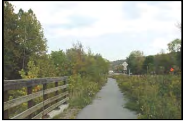
SP 10+000: View northeast of existing trail constructed by NYSDOT to provide linkage from fishing access parking area to the Cayuga Inlet and future Black Diamond Trail.