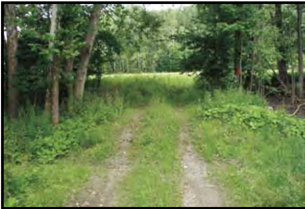
SP 3+600: Proposed trail to be located on gravel/dirt farm road that links small meadow (south) and long meadow (north.) This existing road provides a stable and cost effective base for stonedust trail surfacing.