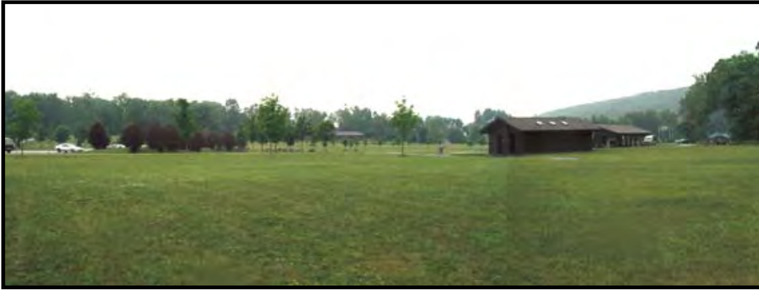
SP 0+000: View northeast of day-use area. The southern-most trailhead for the Black Diamond Trail is located in Robert H. Treman State Park. In 1999, an enclosed pavilion, restrooms and large parking area were constructed at the east end of the park. A trail orientation/information kiosk, bicycle parking and seating will be constructed near the building complex.