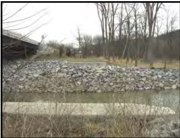
SP 9+700: Concrete bridge abutments were constructed for the Black Diamond Trail by NYSDOT when N. Y. S. Route 13, to the west (left) was reconstructed.

the underpass structure to Norfolk-Southern's standards.