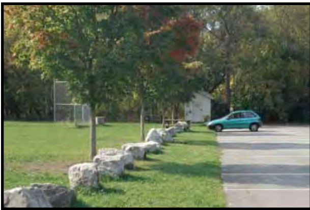
Spur Trail South: The westerly leg of the Larch Meadow Trail will be extended to the ballfield parking lot area, providing an additional access point for the Black Diamond Trail. Trail to be located south of the boulders.