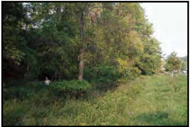
SP 10+800: Northeast of the fishing access parking area the trail will follow the shoulder of N. Y. S. Route 13 for a few hundred feet, then turn to the north through the woodland.