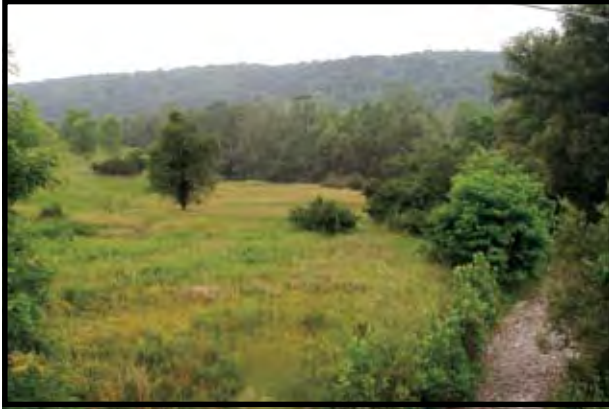
SP 1+600: View east from N. Y. S. Route 13 bridge of meadow between intermittent creek and terrace at adjacent property. Stonedust trail to be along the north edge of the parcel.