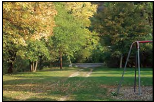
Spur Trail South: Proposed trail through the picnic area, following an existing service lane.