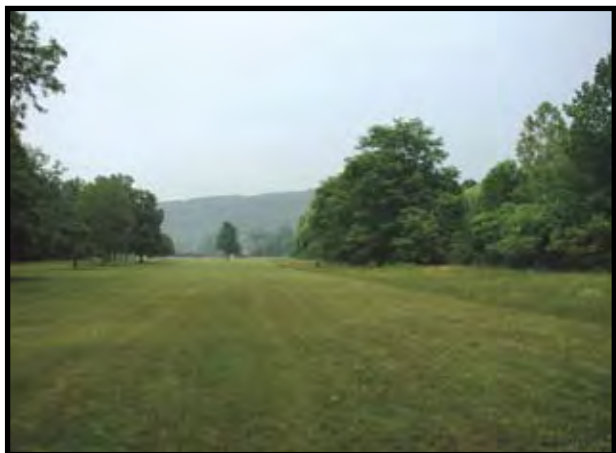
Spur Trail: Trail spur will follow south (right) edge of meadow and end at the swimming-area parking lot. Cyclists can use internal park road system to access camping areas south of Enfield Creek.