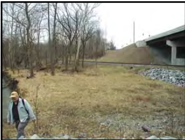
SP 9+500: View south of area between active railroad line and Cayuga Inlet. An earthen trail ramp will be constructed to the top of the rip-rap mound adjacent to concrete bridge abutments.