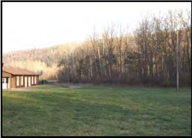
SP 0+000: View east where trail will pass south of the pavilion through the existing electric line utility corridor.