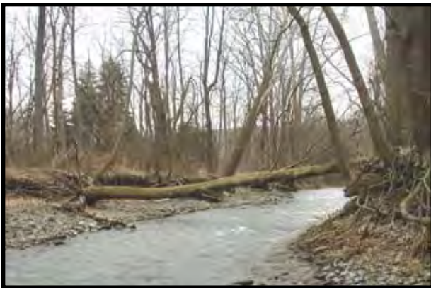
SP 11+400: The trail will cross Buttermilk Creek approximately 500 feet northwest of N. Y. S. Route 13. The bridge will be approximately 80 feet in length.