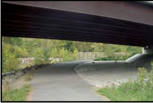
SP 9+800: View northeast of existing asphalt trail under N. Y. S. Route 13 between the Cayuga Inlet and the bridge abutment. Section of trail built by NYSDOT as part of highway reconstruction.