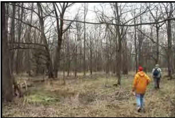
SP 6+500: The proposed trail passes through a triangular shaped forest bounded by the railroad on the east and N. Y. S. Route 13 on the west. One intermittent creek crossing is required.