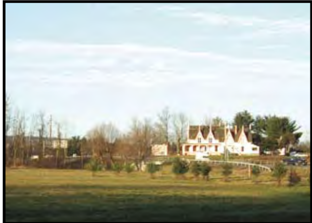
SP 1+000: View north to Victorian-style building. Trail to be constructed between playing field and young evergreen screen plantings.