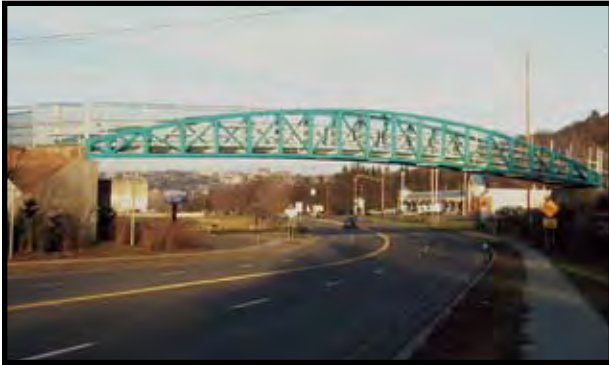
Spur Trail North: City of Ithaca installed the Gateway Bridge on abutments reconstructed by NYSDOT during the widening and reconstruction of N. Y. S. Route 13. The bridge will provide the linkage between the state park, the City's Southwest area and the Town of Ithaca's south and east trail systems.