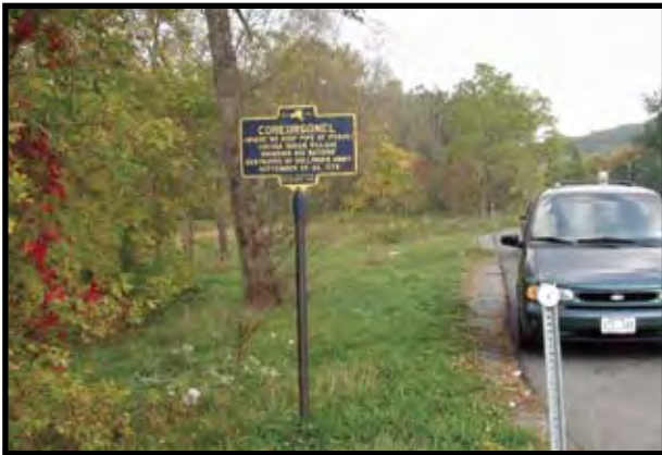
SP 10+200: View northeast along parking area. A state historic marker is located here commemorating the Coreogonal Indian village destroyed by the Sullivan Campaign in 1778.