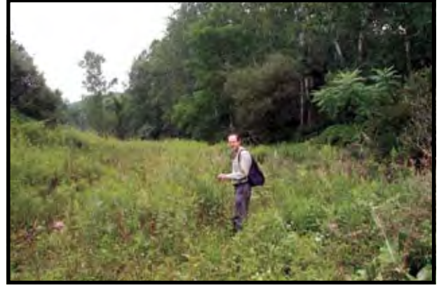
SP 3+000: View north of meadow between terrace bank to west (left) and woodland on east. Proposed trail is to be located in the middle of the space.