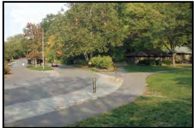
Spur Trails: Trail users will have access to bathroom, swimming, picnicking and gorge-trail hiking upon entering the park. Adequate bicycle parking facilities will need to be added.