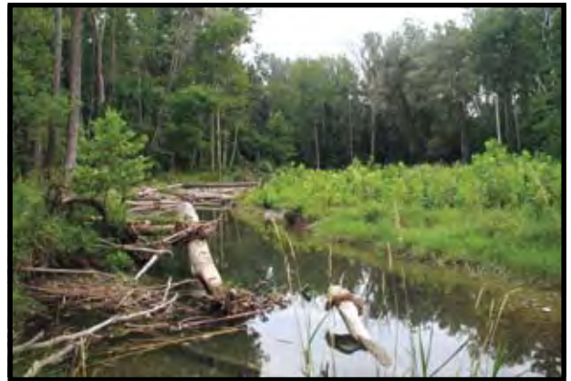
SP 5+200: The meander in the Cayuga Inlet is an area of heavy beaver activity causing the log jams. Log jams have caused the Inlet to overflow into adjacent fields.