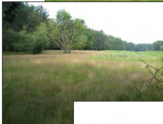
Reduced mowing areas in Saratoga Spa State Park providing habitat for flora and fauna, wetland buffers from stormwater impacts, and potential for endangered butterfly habitat restoration.

As Natural Resource Stewards, it's important to consider a broad range of natural resource issues including not only wildlife and habitat, but also clean air and water resources, sustainability and visitor enjoyment and education. To this effect, the reduced mowing program begun in the Saratoga-Capital District Region is a natural resource project that has had benefits across the board including improved wildlife habitat, decreased habitat fragmentation, decreased stormwater runoff and erosion, a more cohesive trails network, increased environmental educational opportunities, decreased use of gasoline and diesel fuel, reduced carbon emissions, reduced noise pollution, decreased cost of equipment upkeep and maintenance, and increased availability of mowing staff for other park facility needs. Although original comments about the program were mixed, all comments received after the program was initiated were positive with the public appreciating our effort to reduce