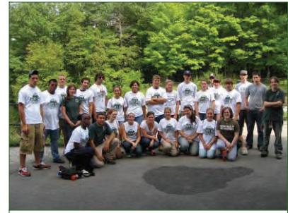
Over 25 students from SUNY-ESF and several staff from OPRHP removed swallow-wort at Chittenango Falls on August 23, 2008