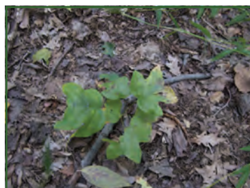
Tulip tree sapling in exclosure

At parks in the Finger Lakes, Thousand Islands and Genesee regions we will fence off areas approximately 15 by 15 meters in size to prevent deer from entering inside. These deer exclosures are