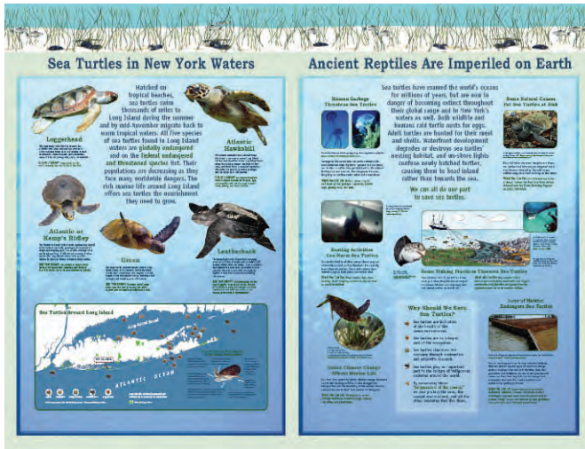
EBM Literacy Panel 1

Look for Great Lakes-focused kiosks in the future. These will also educate peo-