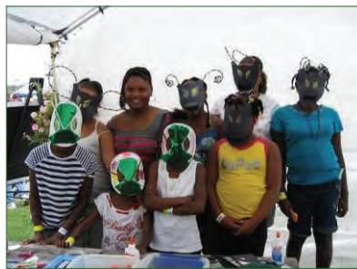
Youth from Syracuse City Parks & Recreation proudly display their Asian longhorned and emerald ash-borer beetle masks created as part of an invasive insect outreach program from the NYSDEC & OPRHP