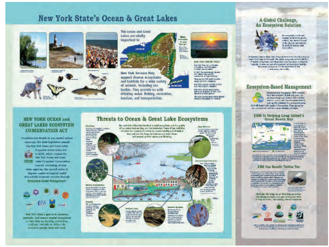
EBM Literacy Panel 2

funded by NY's Environmental Protection Fund under the state's Ocean and Great Lakes Ecosystem Conservation Council. These kiosks provide educational mate-