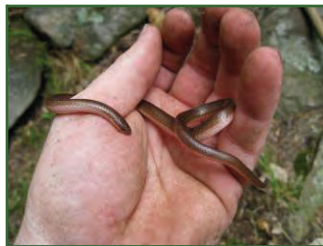
Worm snake at Hudson Highlands SP

During the summer of 2008, three surveys were conducted for worm snakes in Clarence Fahnestock State Park and separate sections of Hudson Highlands State Park. A single adult worm snake was found on one of these surveys in Hudson Highlands. This is a new location for this species and adds to our knowledge of the distribution of this rare and elusive snake in the park system, as well as within NY State.