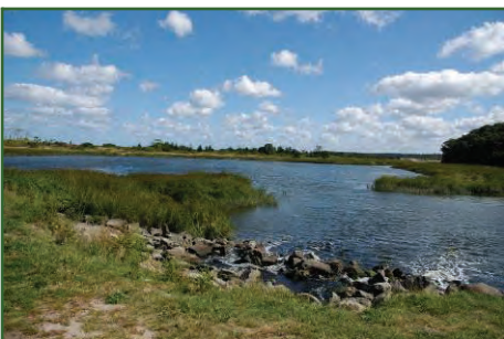
Sunken Meadow State Park study

OPRHP is working with the Open Space Stewardship Program (OSSP) on Long Island to enable students to become stewards of public land. Parks