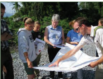
NRS staff come together for the 1st NRS Biologist meeting at Peebles Island, July 2008

Welcome to the first issue of Our Paper . This newsletter celebrates the accomplishments of staff within the Environmental Management Bureau (EMB) that are working primarily through the Natural Resource Stewardship (NRS) and Environmental Education (EE) Initiative.