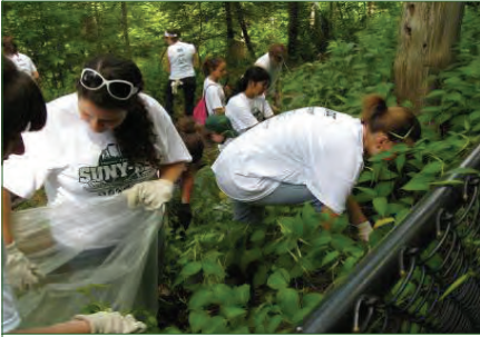
SUNY-ESF freshmen remove invasive swallow-wort seed pods as part of their "Saturday of Service"

On August 23, 2008, incoming freshmen from SUNY-ESF participated in