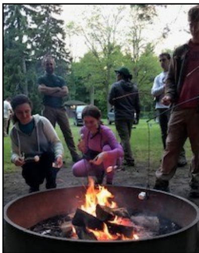
FORCES Stewards enjoying a campfire at Trainapalooza at Letchworth State Park.