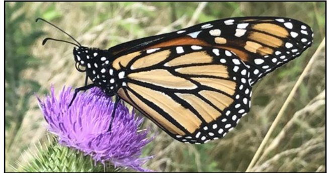
Monarch butterfly ( Danaus plexippus ).

Over the months of working outside in the Niagara Region parks, I have noticed that having a keen eye to spot these target species was great. This quality enabled me to see and think more critically when searching for insects closer to the ground than just looking at the top of flowers. A majority of the time spent was by time searching separate sections of different parks. This past summer, I've focused more than 42 hours just at Reservoir State Park surveying for these target species. It was very interesting when looking back at my results from the survey to find out that a larger diverse amount of pollinators/insects were found along the western edge of the park, and an increased amount of various flower species. (Right of I-90 road) When compared to the southern area of the park (by Witmer Rd), it showed a less diverse quantity of pollinator species and decreased flower species available.