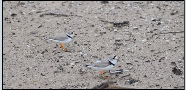
Arwen and Aragorn, at Sandy Island Beach State Park.

They returned! The Great Lakes Piping Plover (GL PIPL), a Federally and New York State listed endangered species, made their way back to Sandy Island Beach State Park! Arwen and Aragorn, our female and male that nested last year, returned early this spring. Arwen showed up April 23 rd , with Aragorn following not far behind on May 7 th . They quickly made their scrape in the sand and laid four eggs that hatched on June 15 th . Sadly, one of the eggs didn't hatch but three is certainly better than none. Our chicks were named Chewie, Yoda, and Leia. This was, once again, the only nest of GL PIPL's in all of New York.