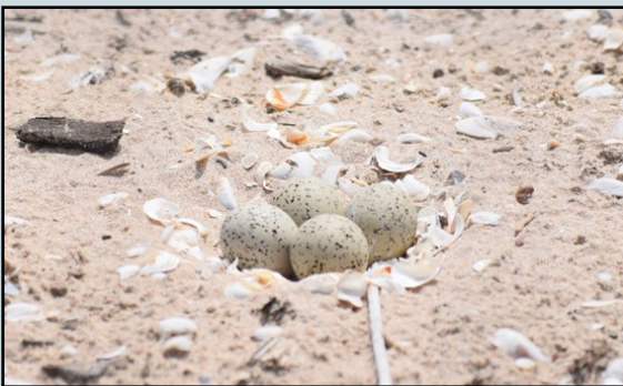
Piping plover eggs in the nest.

With the help of our Piping Plover Conservation team and FORCES stewards protecting and monitoring them – two out of three chicks survived (Chewie and Yoda) and hit the sky at the end of July. One other adult PIPL showed up, but didn't stick around long (dad is pretty protective). Our chicks from last year (Frodo, Gimli, Merry, and Pippin) have not shown back up yet, thus is the life of a critically endangered species. One of our chicks, Chewie (yellow dot), was documented in Clearwater, FL (thanks to citizen science!) on August 6 th ! Our project is slowing down for the season. We are still educating park patrons about this amazing species, and keeping our fingers crossed that we will see them all again come spring!