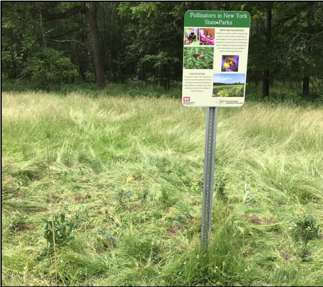
A successful native flora planting near the northern entrance of Letchworth State Park.

Conservation Stewards Christina Morrow and Alec Ritter, stayed busy this season with multiple projects at Letchworth State Park. At the start of their internship, they shared with me the desire to incorporate this environmental conservation experience into their future career plans. The main responsibilities for these two Geneseo students included assisting in slender false brome management, monitoring and mapping invasive species, constructing a wildlife fence, and preparing pollinator gardens at the north end of the park.