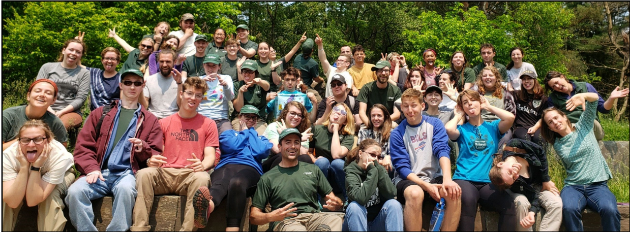
5th Annual FORCES Trainapalooza held at Letchworth State Park, May 30-31, 2019.

Keep an eye out on the FORCES website for the Who's Who publication that will highlight all of our 2019 FORCES Stewards. Searching for a spring internship? Be sure to contact your regional FORCES staff to inquire about spring opportunities.