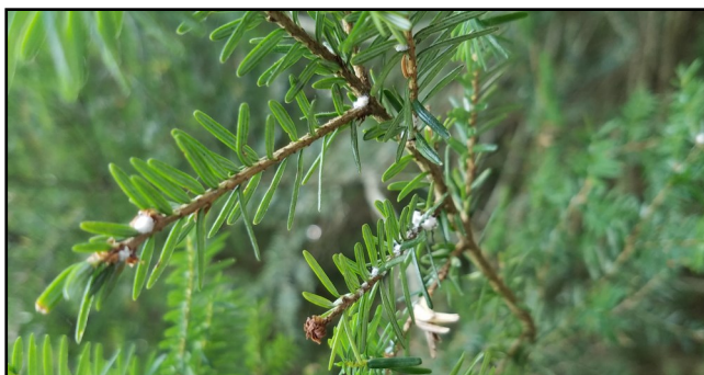
Hemlock woolly adelgid on eastern hemlocks.

Since hemlocks grow along stream banks, they provide a number of “services” to the channel and surrounding habitat. The tree canopy provides riparian cover and shade to the stream which keeps water temperatures low and provides protective fish habitat. Their root systems prevent erosion of stream banks and they soak up excess nutrients that could otherwise enter the water directly. They are also beautiful and provide natural habitat for wildlife along the stream corridor. These are among many of the reasons we need to protect the eastern hemlock. Hopefully, the pesticide application will kill the HWA and prevent the loss of hemlocks in these parks. Because if the hemlocks go, the stream habitat, water quality and therefore the stream