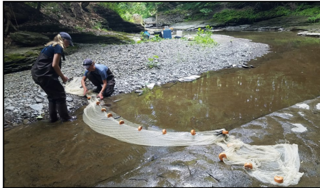
Hobart and William Smith Colleges students at Buttermilk Falls State Park setting up block nets prior to electrofishing.