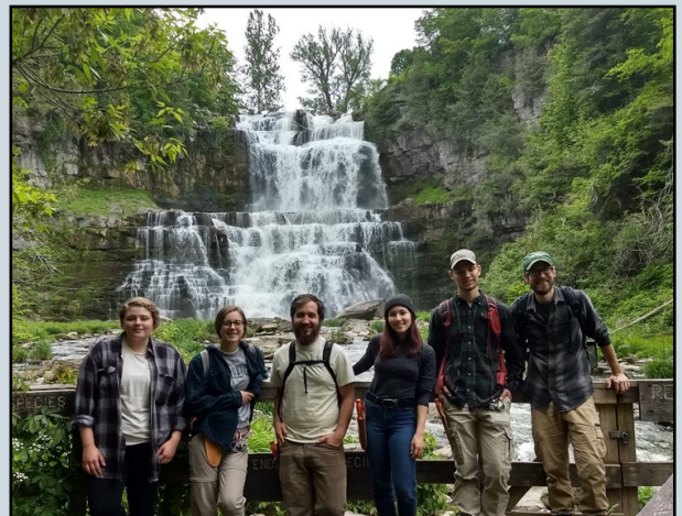
American hart's-tongue fern crew at Chittenango Falls State Park.