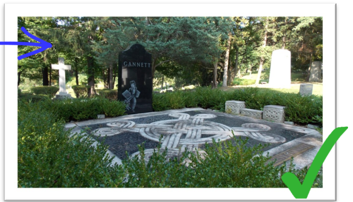
Clearer, closer, sharper image shows more detail of monument