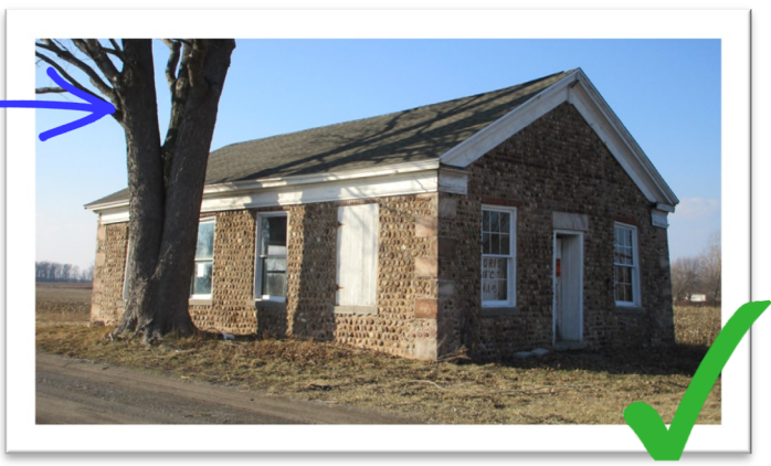
Showing two elevations of this building better describes its form and features