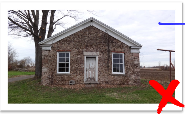
Front image doesn't reveal much about the massing or size of this building

Remember, sometimes a simple adjustment can yield better results!