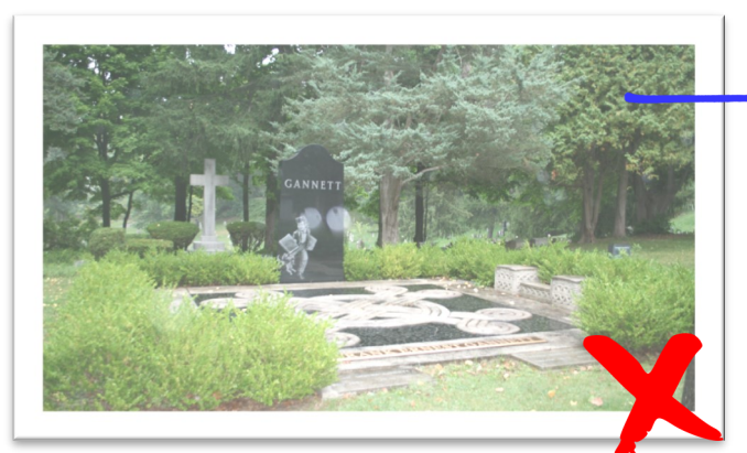
Blurry, out of focus, with lens flare