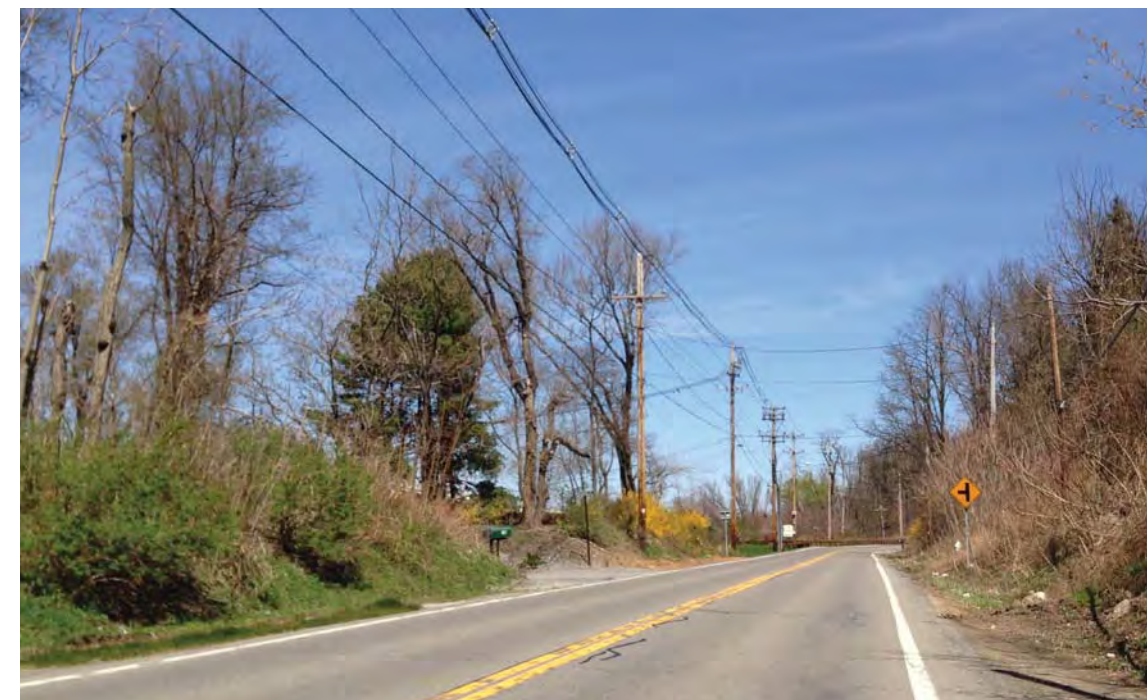
Route 9D at intersection of Slocum Road facing north