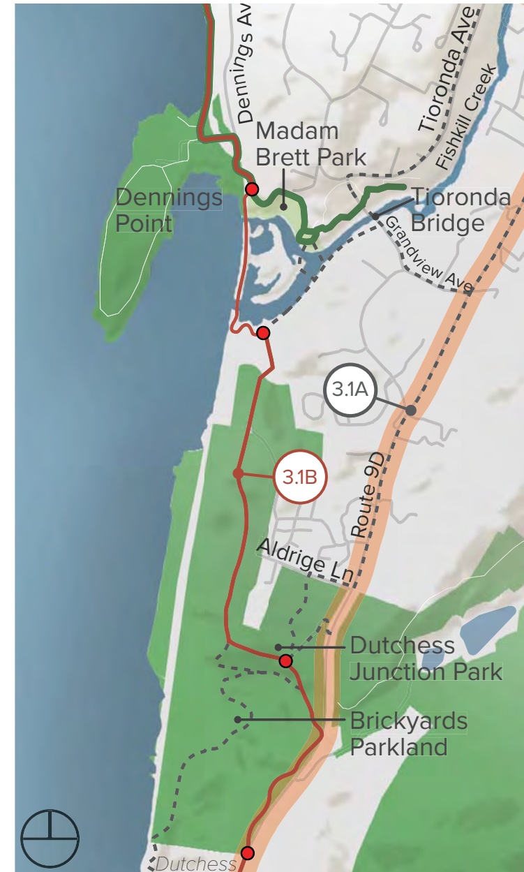
Map 3.1 - Dutchess Junction Park to Fishkill Creek