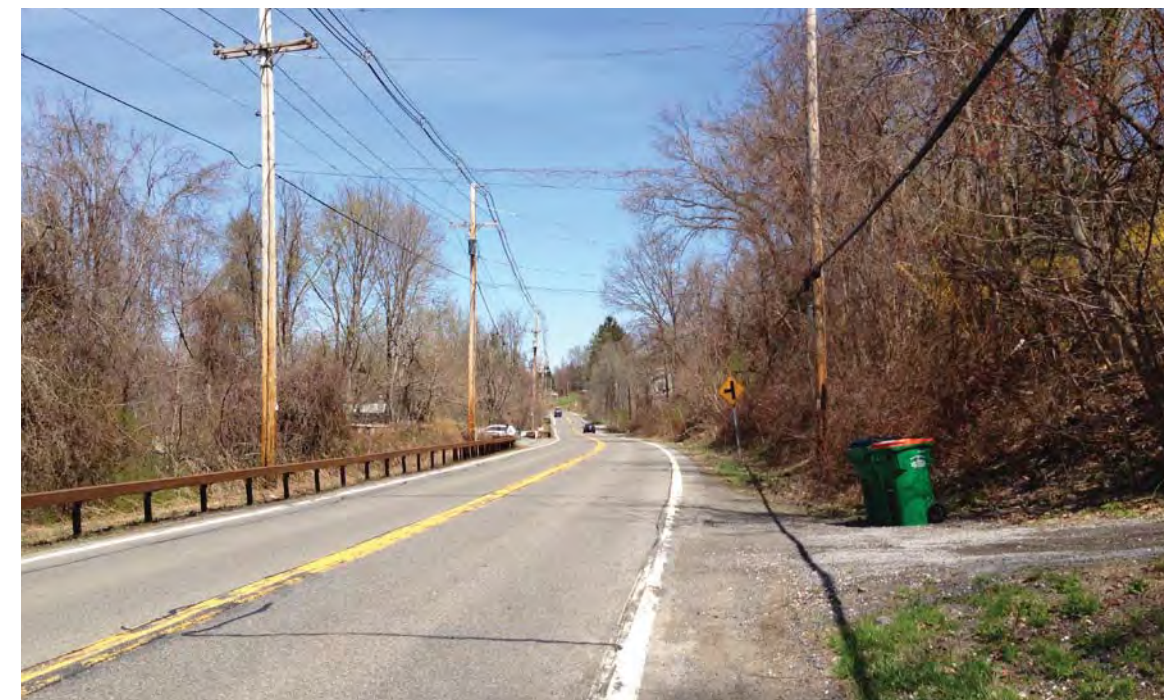
Route 9D at intersection of Aldrige Lane facing north

From Dutchess Junction Park, this alignment would begin off-road for a short segment, along a trail that runs parallel to Route 9D, turning back towards Route 9D via Aldrige Lane. At this point, private residential properties line both sides of Route 9D. The DOT right-of-way is still generally wider than the roadway itself but irregular—at times almost as narrow as the roadway. The grade along the sides of the roadway varies, with many steep sections, as well as utility lines and drainage to consider (see sections below). More significantly, however, the upward slope along Route 9D from Dutchess Junction Park to the Mount Beacon parking area is steep enough that it would be an enormously challenging climb, only to bring users back down to the other side of the steep hill to the Wolcott Ave Bridge over the Fishkill Creek.