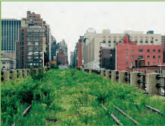
High Line - a railbanked corridor in New York City

agency or private organization to purchase the land outright. In fact, to date only one corridor in NYS has been railbanked — the High Line, an elevated rail line in New York City. It is possible that railbanking will become more frequent in the future if the state seeks to keep abandoned corridors available for future rail use.