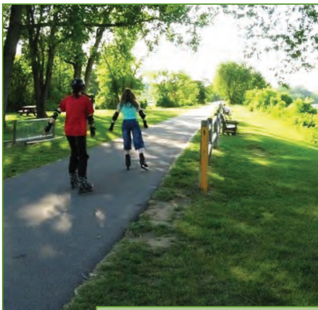
Mohawk Hudson Bike-Hike Trail, Niskayuna