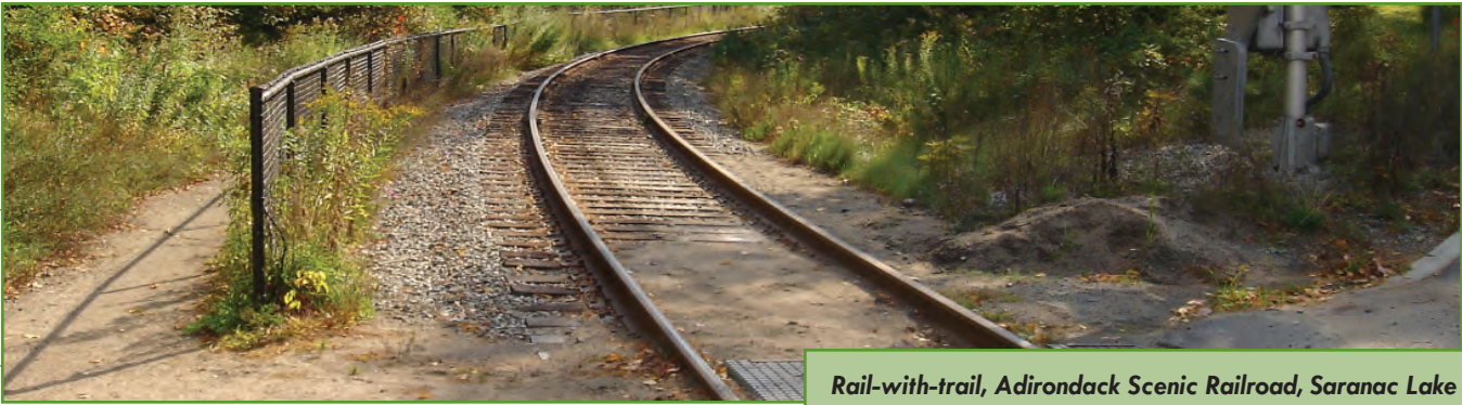
Rail-with-trail, Adirondack Scenic Railroad, Saranac Lake