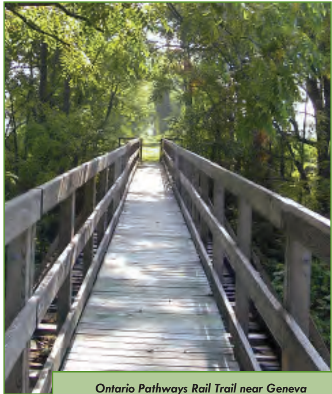
Ontario Pathways Rail Trail near Geneva