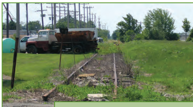
Abandoned rail corridor in Tonawanda

Finally, keep in mind that if another company is interested in acquiring a corridor for use as a railroad, that proposal will prevail in both the STB and NYS Section 18 proceedings.