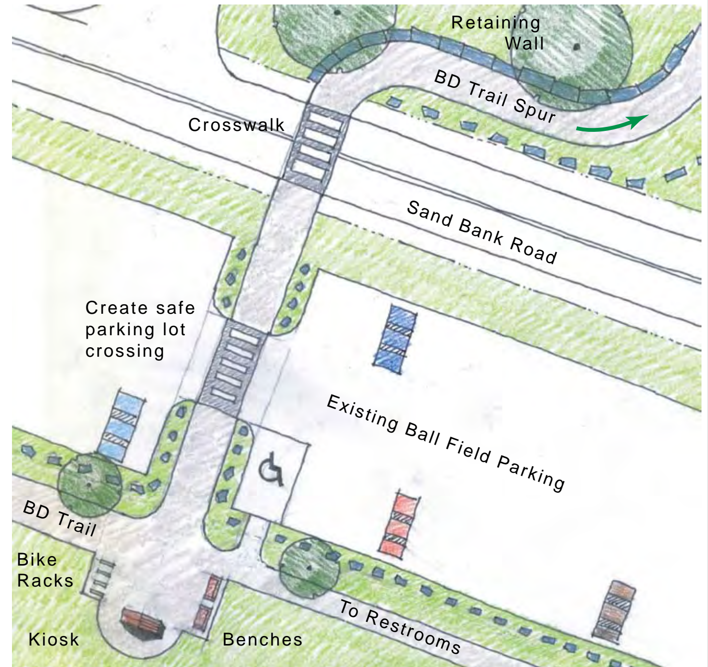
Trailhead at Playing Fields Scale: 1" = 20' (+/-)