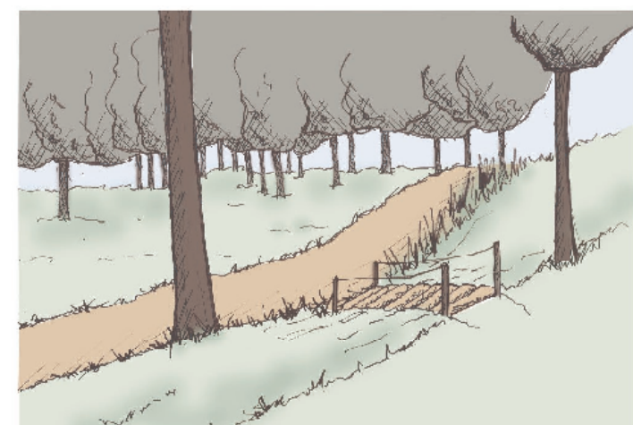
VEGETATED SWALES AT STEEPLY SLOPING AREAS CAN NATURALLY CONTROL STORM RUNOFF