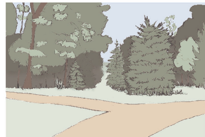
VISUAL LINKAGE TO FORMER TROLLEY RIGHT OF WAY WILL BE REINFORCED