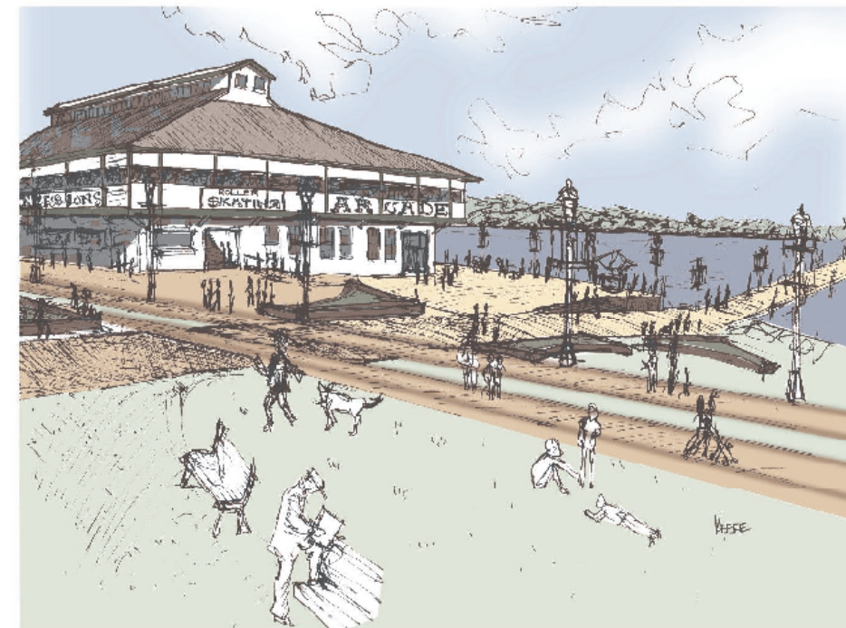
"NOSTALGIA ON THE WATER" - AXES REPRESENTING SEPARATE PARK ERAS WILL INTERSECT AT THE DENSE WATERFRONT MULTIUSE ZONE