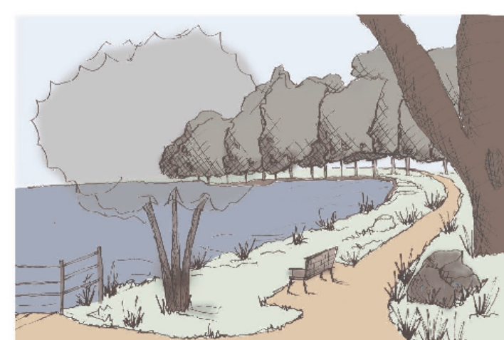
NORTHERN SHORELINE AREAS WOULD BE REGENERATED WITH SUSTAINABLE PLANTINGS