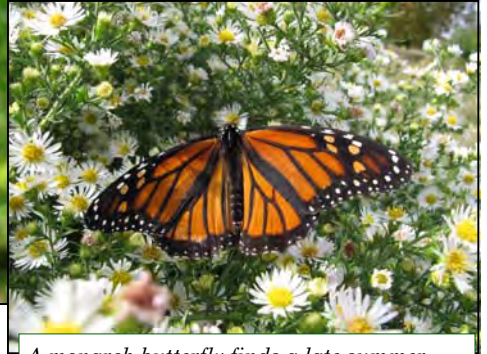
A monarch butterfly finds a late summer resting place at Seneca Lake State Park.