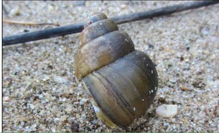
Chinese Mystery Snail— an invasive snail commonly kept in fish tanks.