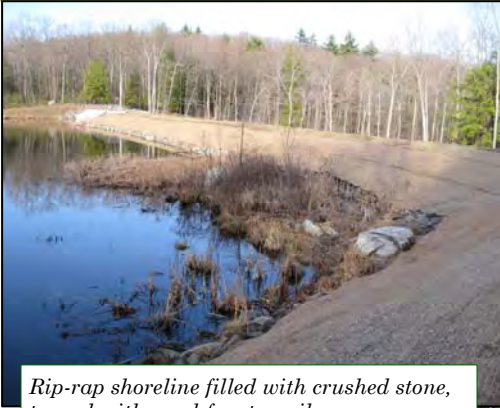
Rip-rap shoreline filled with crushed stone, topped with weed-free topsoil, and planted with native grasses (covered in erosion control blankets).