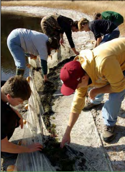
Students seining fish at Brookhaven State Park.