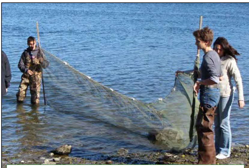
Students from Cold Spring Harbor High School seine fish and measure Asian shore crabs at Nissequogue River State Park.