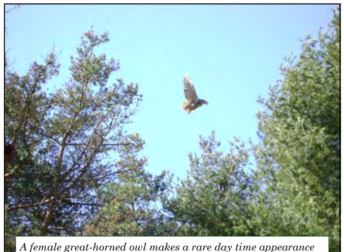
A female great-horned owl makes a rare day time appearance near the Mark Twain golf course.