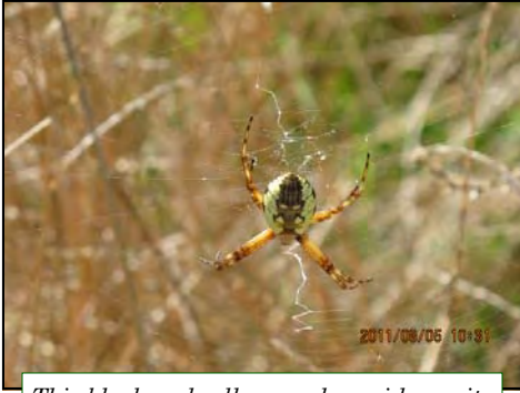
This black and yellow garden spider waits eagerly for food to arrive at Evangola State Park.