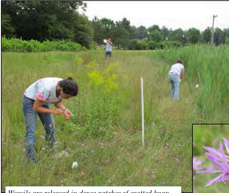
Weevils are released in dense patches of spotted knapweed (pictured at right) to control the plant.

Two projects this summer and fall highlight the role that biocontrol and strong partnerships can play in invasive species management. Biocontrol agents are living organisms that are used to target and control invasive species causing harm to our environment. These biocontrol agents are thoroughly screened so as to avoid introducing anything that could, itself, become an invasive species. Generally speaking, they study and choose species that will target the invasive species and only the invasive species. As one US Fish and Wildlife Service officer told me, “we want something that would rather die than eat anything else.”