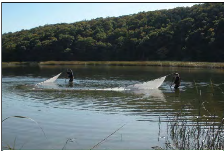
Hauppauge students conduct fish surveys Sunken Meadow SP.

In September, OPRHP began its 4 th year working with Hauppauge High School's A.P. Environmental Science classes, NYS DEC, and NY Sea Grant on a long-term habitat monitoring program along a tidal creek at Sunken Meadow State Park. A project is under development to increase tidal flow to the creek in order to restore a degraded salt marsh and re-establish diadromous fish runs. Students monitor water quality, macro-invertebrates, plants, fish and other wildlife six times throughout the school year to gather pre-restoration data. This information has been used to provide some of the baseline data for developing the restoration project.