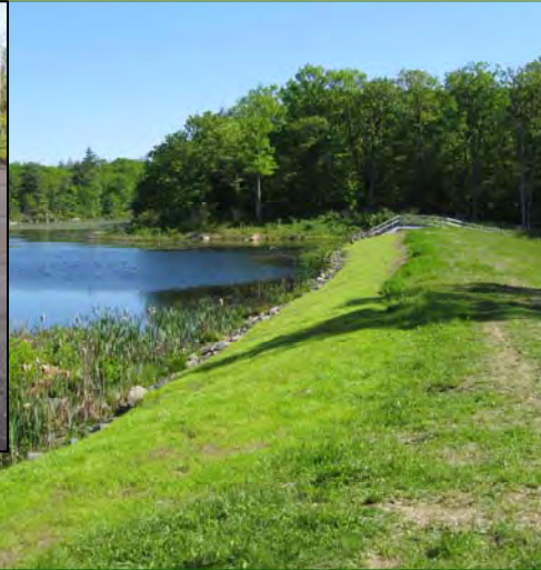
Former rip-rap shoreline after grasses became established.