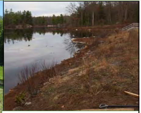
Aquatic habitat restoration begins in November with the addition of a peat/soil mix along the shoreline.