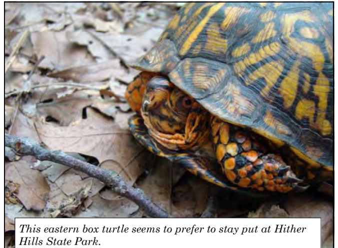
This eastern box turtle seems to prefer to stay put at Hither Hills State Park.