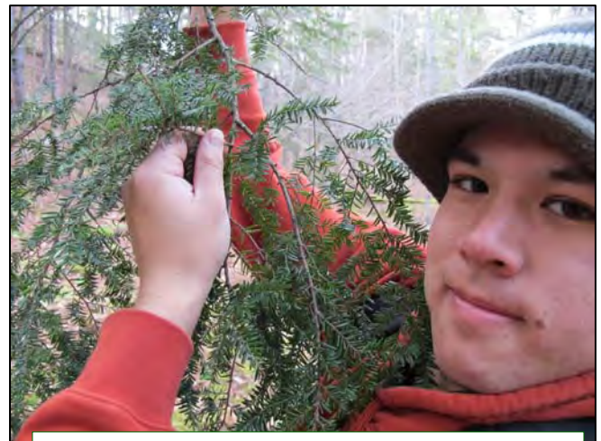
SUNY Cobleskill volunteers survey the branches of hemlock trees for hemlock woolly adelgid at Mine Kill State Park.

Meanwhile, at Mine Kill State Park, a recent discovery made the park the most northerly occurrence of Hemlock Woolly Adelgid (HWA) in New York State. HWA is a tiny, aphid-like insect native to Japan that feeds on healthy hemlock trees, eventually killing them. Through a partnership with Cornell University and APHIS, the park intends to release a beetle as a biocontrol for HWA. However, before the beetle can be released, we need to know a lot more about the HWA population at the park. Thankfully, students from SUNY Cobleskill volunteered to come to the park and perform surveys. The students did some great work and will be back again for additional surveys in cooperation with the Catskill Regional Invasive Species Partnership.