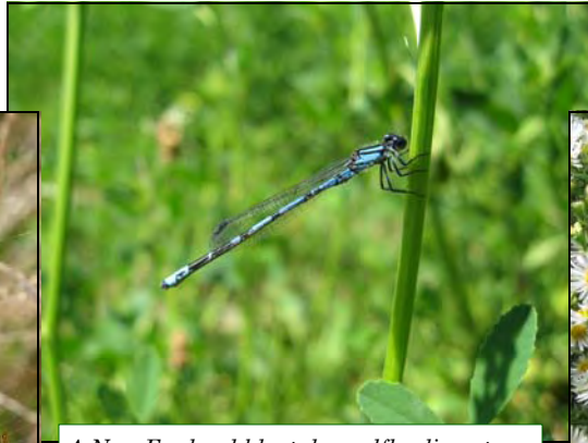
A New England bluet damselfly clings to a plant at Sterling Forest State Park.