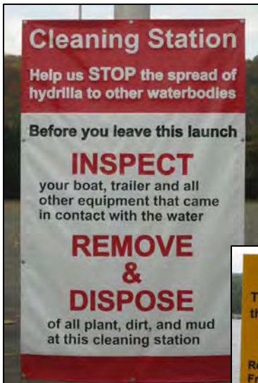
Signs like these have been placed at Allan H Treman State Marine Park and along the Cayuga Inlet.