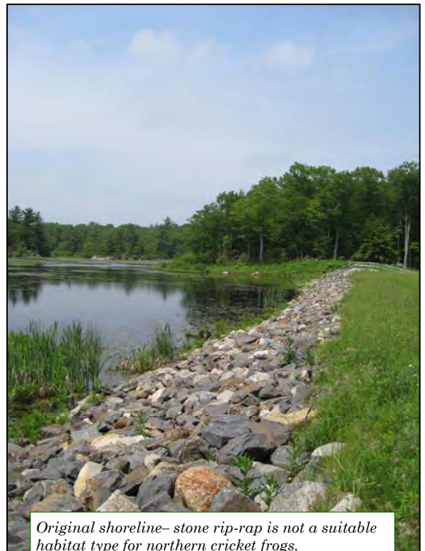
Original shoreline- stone rip-rap is not a suitable habitat type for northern cricket frogs.

- Jesse Jaycox, NRS Biologist Palisades and Taconic Regions