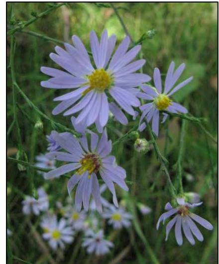
Sky blue aster ( Symphotrichum oolentangiense )

- Meg Janis, NRS Biologist Western District Regions