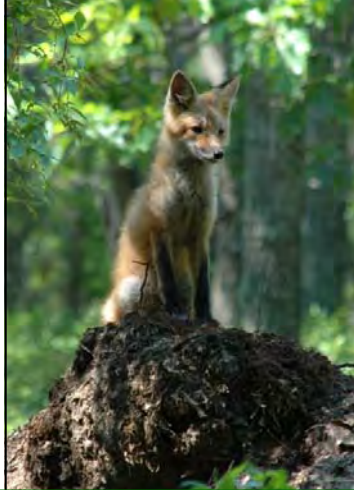
A red fox keeps a look out at Connetquot River State Park.

Every year, biologists and scientists from NYS Parks and NY Natural Heritage Program are witnessing firsthand the natural beauty of our NYS Parks.