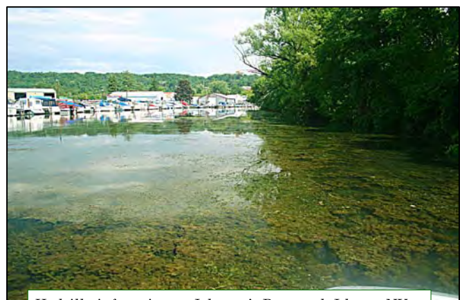
Hydrilla infestation at Johnson's Boatyard, Ithaca, NY.