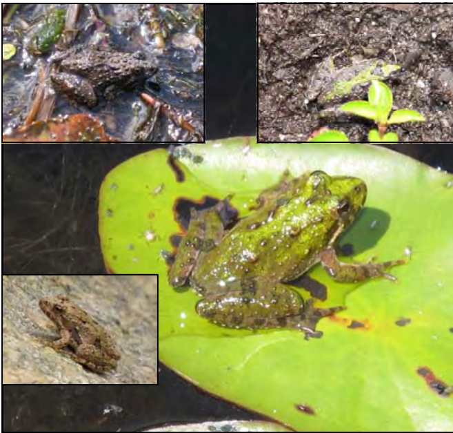
Color variation in the Northern Cricket Frog (Acris crepitans) - a NYS Endangered Species found in Sterling Forest State Park.

The restoration project is currently at this stage of implementation. The final stage of the project, anticipated to be completed during the summer of 2012, involves transplanting native vegetation to the peat mats and filling the remaining narrow strip of rip-rap along the shoreline with a peat/soil mix, followed by seeding with a native grass mix. The project is progressing as planned and cricket frog use of the newly created habitat will be monitored once the project is complete. Stay tuned for further information detailing this exciting project.