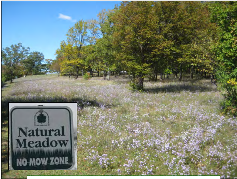
Whirlpool State Park meadow full of sky blue asters in bloom.

At Whirlpool State Park along the Niagara River, a state-endangered wildflower, sky blue aster ( Symphotrichum oolentangiense ) is making a comeback due to new management practices. This success story is the result of a collaborative effort between Natural Heritage Program botanists, the stewardship biologist, and OPRHP staff, both from EMB and the Niagara region. After discussions with park management on the best management practices and rare plant protection, a new area of the park has been removed from the regular mowing routine. The past two summers have allowed the natural meadow to recover, filled with this rare flower and other native species, including another uncommon wildflower, upland goldenrod ( Oligoneuron album ). The wooded areas of the park were also taken off of the mowing schedule, and asters were blooming in the mottled sunlight under the canopy. Protection of this population is particularly important since there are only two known locations with sky blue aster in New York, and the population at Whirlpool is the largest and best quality population in the state. Thanks to good communication, environmental education, and flexibility of park staff, this rare plant population is on the rise.