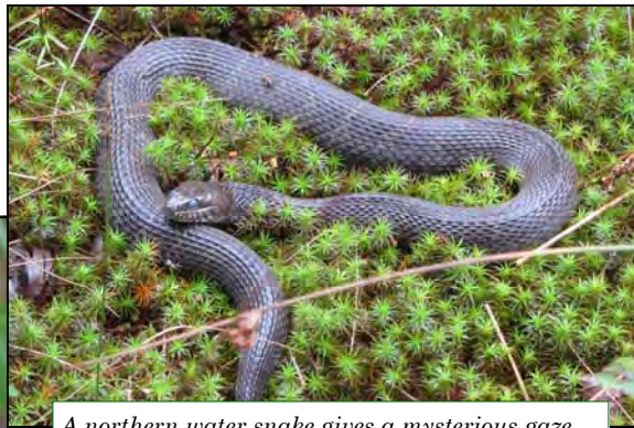
A northern water snake gives a mysterious gaze at Connetquot River State Park.