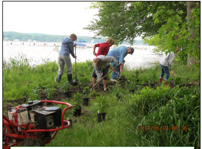
Shoreline property owners learned the art of digging and planting between tree roots.

The area of shoreline restored formerly housed a few cottages, and following the recent master plan, this section was to be left as a natural regeneration area. So through the efforts of the volunteers and coordinators, a variety of native plants were transplanted along the shoreline, including cardinal flower, bee balm, and elderberry. This new vegetated buffer along the lake shore has many functions: it stabilizes the shoreline from erosion, slows water runoff into the lake, provides food and habitat for various wildlife species, supplies overwintering habitat for the milfoil weevil (which feeds on the invasive Eurasian water milfoil in the lake), and even acts as a public demonstration area for the public to learn about the value and beauty of native, natural shorelines. Thanks to the many hands that made this project possible!