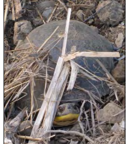
A nesting Blandings turtle seeks cover at James Baird State Park.

This edition focuses on the diverse wildlife found in our NYS Parks. Amazing insects, reptiles, birds, and mammals can be seen every day!