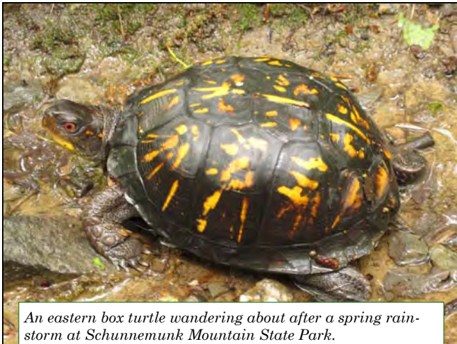
An eastern box turtle wandering about after a spring rain-storm at Schunnemunk Mountain State Park.