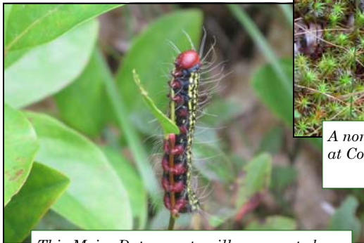
This Major Datana caterpillar seems to be having a nice meal at Connetquot River SP.