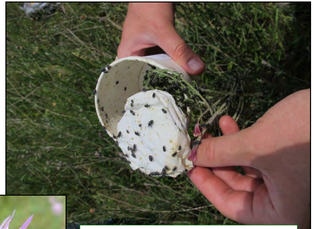
A typical release size is about 500 weevils which are distributed relatively close to one another so they can find each other to mate.

In the first case, three different weevils were introduced at Saratoga Spa State Park in order to control spotted knapweed. Spotted knapweed is a fairly common invasive plant with pretty pink flowers on tiny “pineapples”. Unfortunately, it also puts out chemicals through its roots that kill other plants and is abundant in some of the habitat managed for Karner blue butterflies. Larinus minutus , Larinus obtusus , and Cyphocleonus achates , two seed head feeding weevils and one root feeding weevil respectively, were released in cooperation with the US Department of Agriculture – Animal and Plant Health Inspection Service (APHIS). While these weevils will never eradicate the knapweed at the site, our permanent photo-monitoring plots will be able to show that they should be able to keep the knapweed at bay.