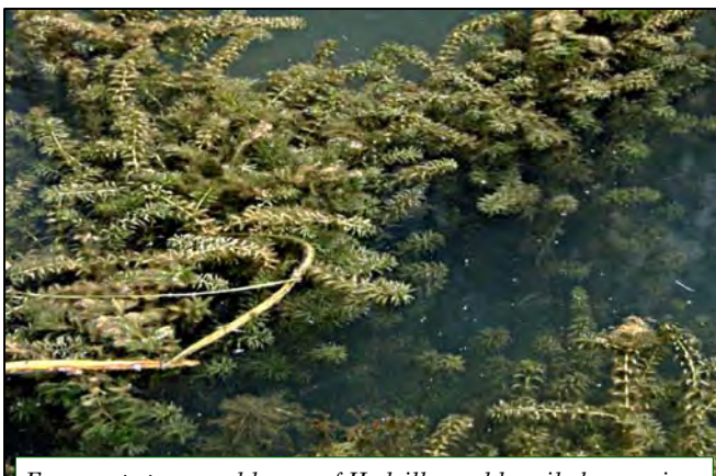
Emergent stems and leaves of Hydrilla could easily be seen in Cayuga Inlet at Cass Park, Ithaca, NY.