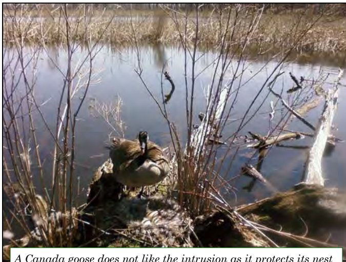
A Canada goose does not like the intrusion as it protects its nest at Fair Haven Beach State Park.