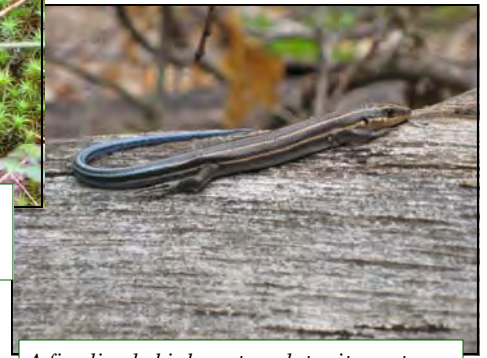
A five lined skink contemplates its next move at Hudson Highlands State Park Preserve.