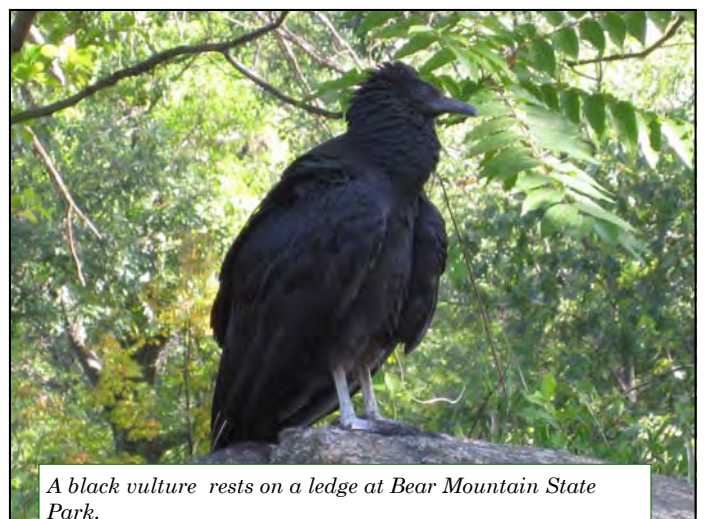
A black vulture rests on a ledge at Bear Mountain State Park.