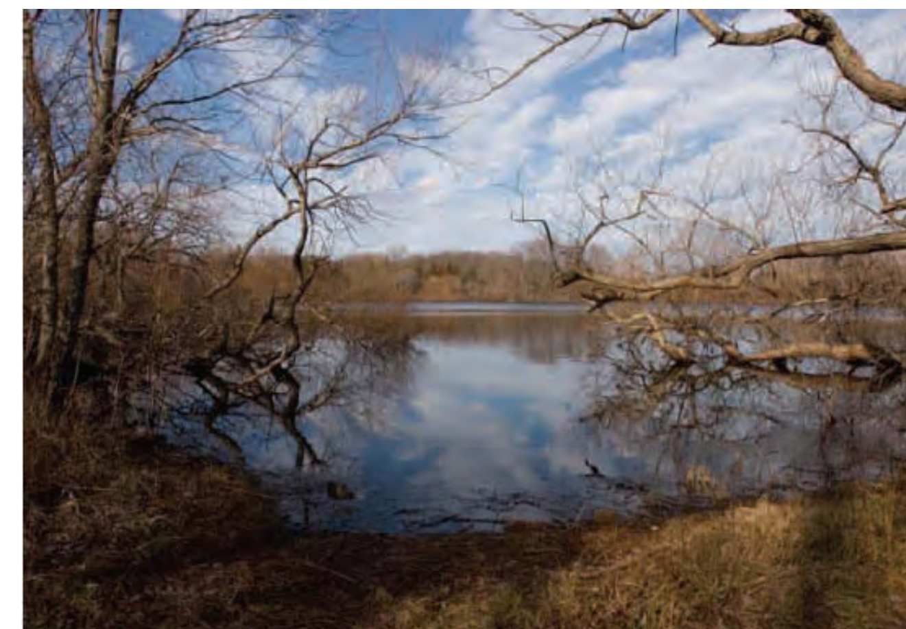
Hallock Pond, a kettle hole pond. This significant community, now a designated a Natural Heritage Area, will be protected from human impacts.

The location of nature center and maintenance facilities, which minimize impacts to significant natural areas while still allowing access to the pond for education and viewing.