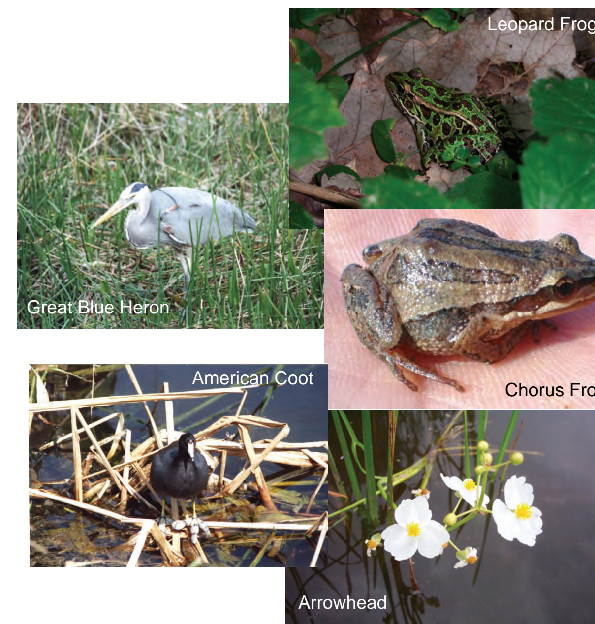
Some targeted species for population enhancement.

To preserve and enhance eroding wetland habitat and promote plants and wildlife, as well as improve aesthetics, boat and fishing access, nature trails, environmental education, and recreation in this formerly degraded marina, state and federal agencies and local stakeholders implemented a wetland restoration project. Annual bird, amphibian, and vegetation monitoring occurs. Many target plant and animal species now inhabit the wetland and people enjoy fishing, kayaking, and bird watching.