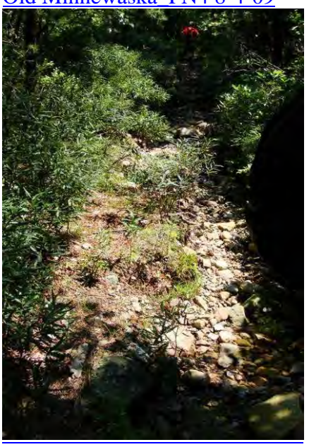
Old Minnewaska_PN1 8-4-09