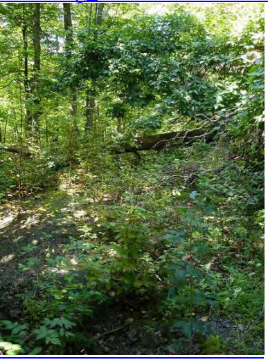
Awosting_PN9 9-2-09 Stream crossing and erosion

<u>Conditions Assessments – Figures 2-5</u> <u>Awosting PN10 9-2-09 Turnaround point of assessment</u>