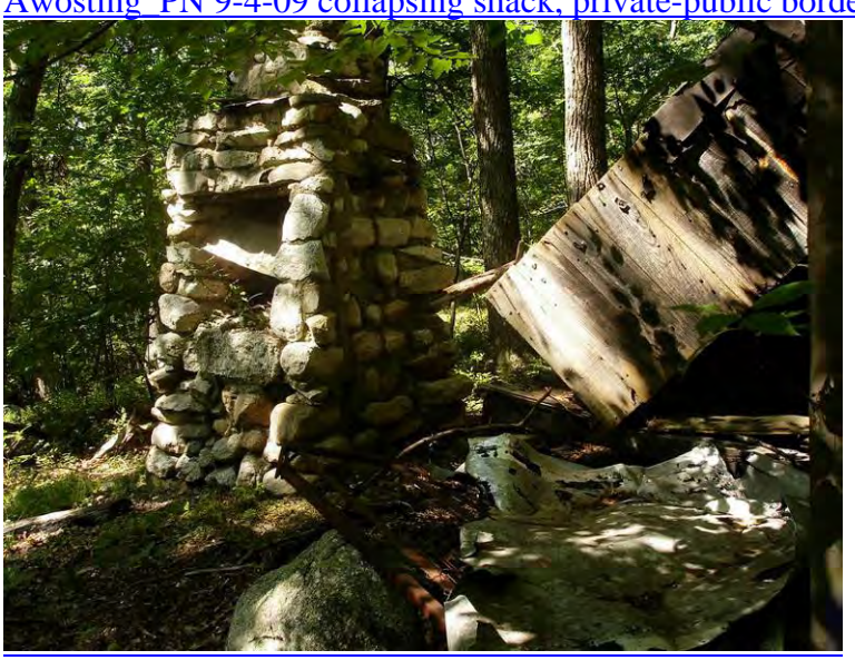
Awosting PN 9-4-09 collapsing shack-private-public border