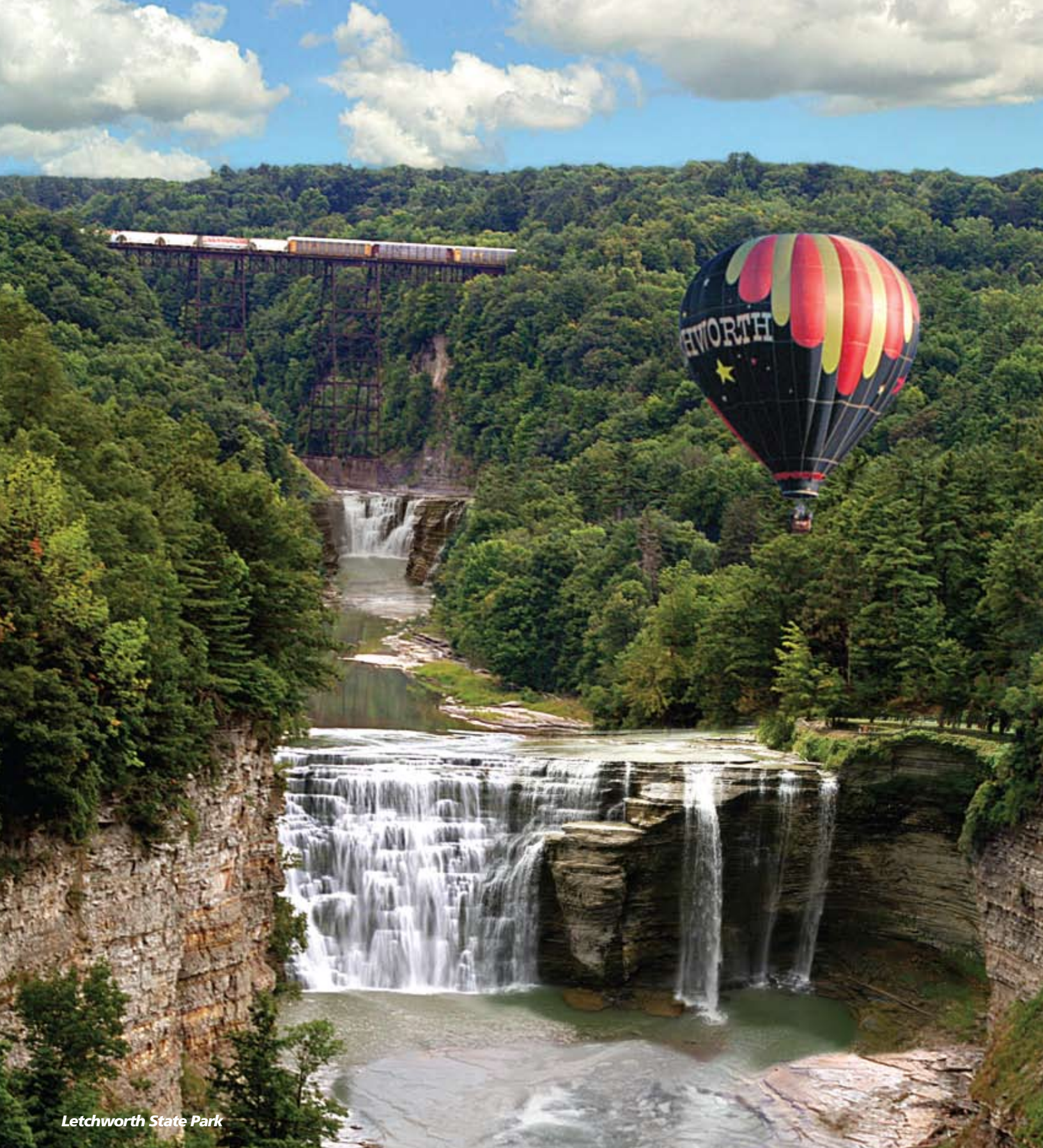
Letchworth State Park