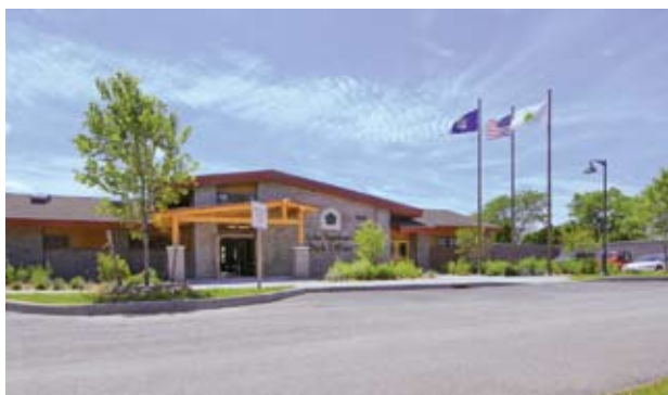
Lake Taghkanic State Park

completely renovated with upgraded restrooms, showers, lifeguard facilities, a concession with covered dining area, and a new park office. The $2.3 million project was completed using State Parks Capital Initiative and federal and Land and Water Conservation Fund (LWCF) funding.