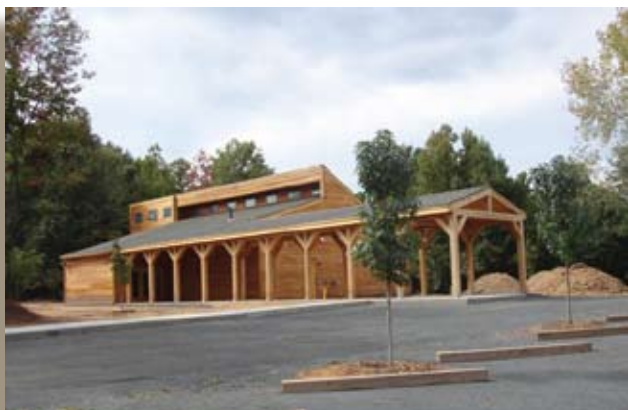
Clay Pit Ponds State Park Preserve

house available for both office space and programming, OPRHP has long sought a public visitor center at the 260-acre Clay Pit Ponds State Park Preserve. This fall, OPRHP will open the new 3,500 square foot Interpretive Center which includes exhibits and classroom space, as well as an outdoor pavilion. The Center will exhibit the cultural and natural history of the park and host a variety of educational programs. Assistance in raising the funds for this project was provided by Friends of Clay Pit Ponds State Park Preserve.