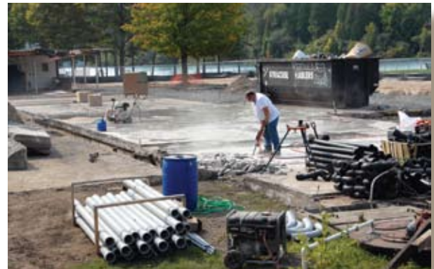
Green Lakes State Park

house at the swimming beach in this highly popular park. The previous bathhouse, constructed in the early 1960s, was deteriorated and did not meet today's public use or building code requirements. The new bathhouse will incorporate many of the existing architectural styles of the original Green Lakes Park buildings constructed in the 1930s, blended with today's building code updates, full accessibility, modern building construction, and green technologies. It will include new public restrooms, changing areas, lifeguard and first aid stations, a centrally located concession area, and a rental pavilion for private events, all under a 1930s style roof with dormers, gables and natural light and ventilation. The new bathhouse will be opened to the public for Memorial Day weekend, 2009.