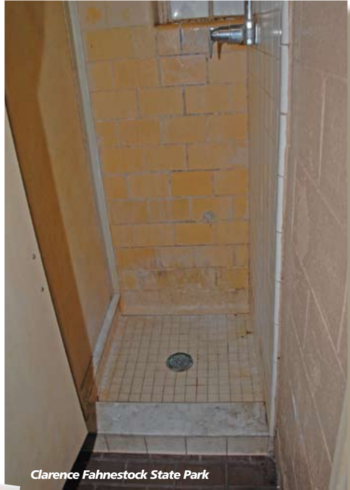
Clarence Fahnestock State Park

In last year's Annual Report (issued in November, 2007), the State Council called for a major new program to revitalize the state park system. Simply stated, New York's state parks and historic sites are suffering from decades of underinvestment, with the result that too many of our facilities are deteriorated and in dire need of rehabilitation. Many parks have significant health and safety concerns that require attention, such as outdated water supply systems, aging wastewater treatment plants that don't meet current standards, electrical systems that don't meet code, landfills that although inactive were never closed to state standards, underground petroleum storage tanks that don't meet state regulations, and dams that require rehabilitation. In addition, many of our park buildings and infrastruc-