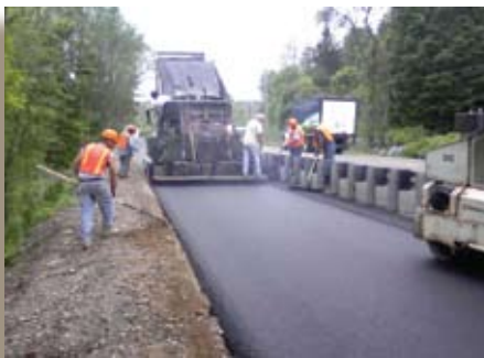
Finger Lakes State Park

This trail is a 12-mile long linear park connecting Watkins Glen State Park and Mark Twain State Park in the Southern Tier of New York State.