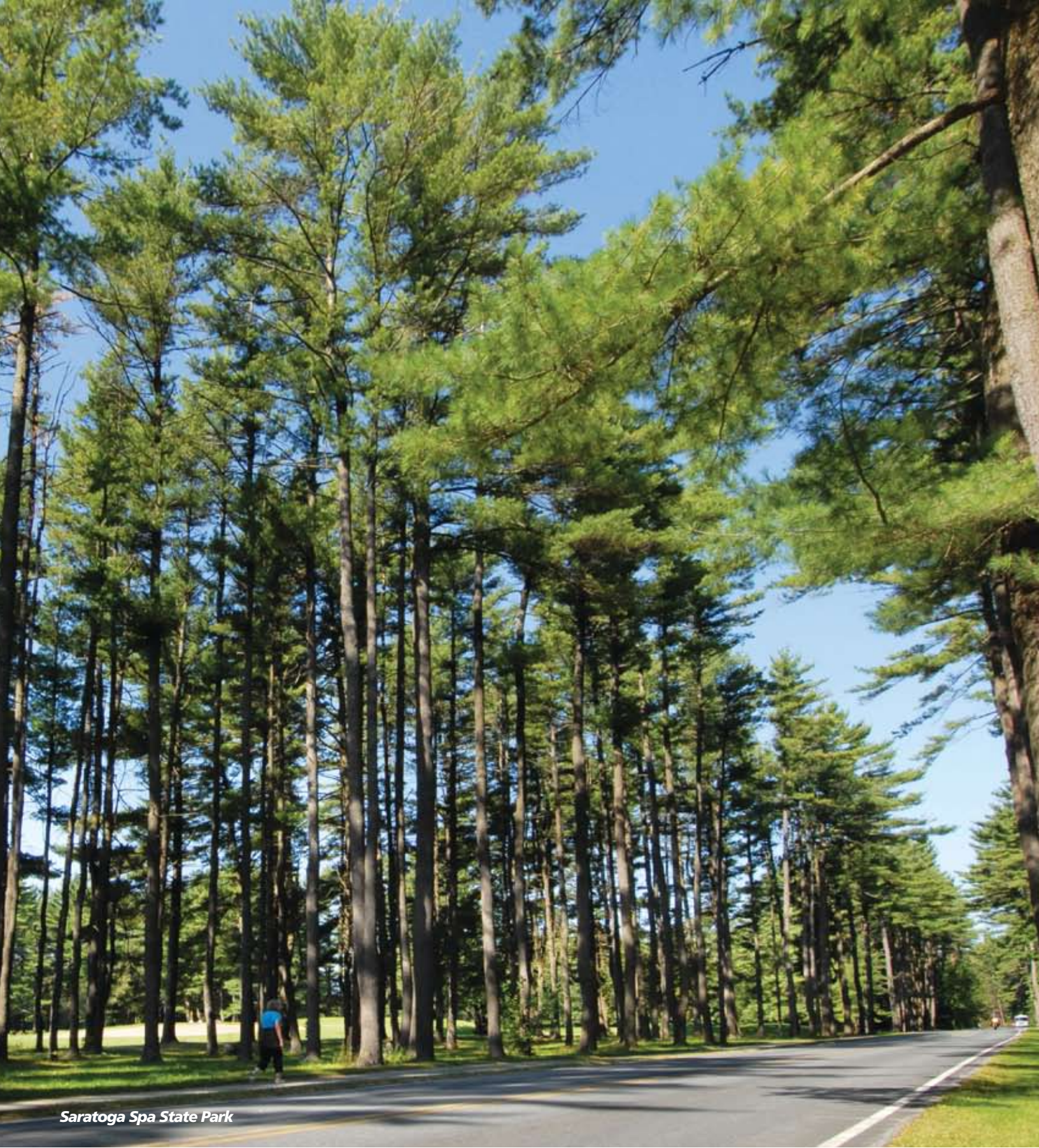
Saratoga Spa State Park