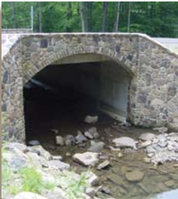
Allegany State Park

A number of long-deferred major capital improvements were initiated or completed during the past twelve months at Allegany State Park, funded through the State Park Capital Initiative. Cabin restoration and upgrades were accomplished on Anderson Trail, and the rehabilitation of several cabins on Congdon Trail is scheduled to begin this fall. A new washhouse is currently being constructed in the Cain Hollow campground, replacing an existing deteriorated building. The remediation of the Cricks Run landfill is scheduled to be completed this fall and will finalize an environmental stewardship project of removing all landfills within the park. Approximately 15 miles of park roads were repaired and resurfaced within the park. The combined cost of these capital projects is approximately $4,000,000.