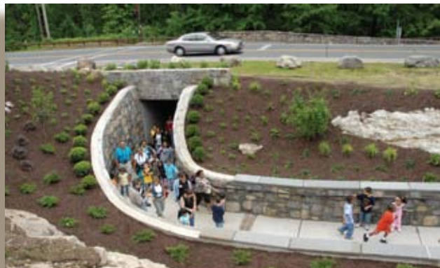
Bear Mountain State Park

been a set of steep stairs to a tunnel under Route 9W. This means of access was an impediment to