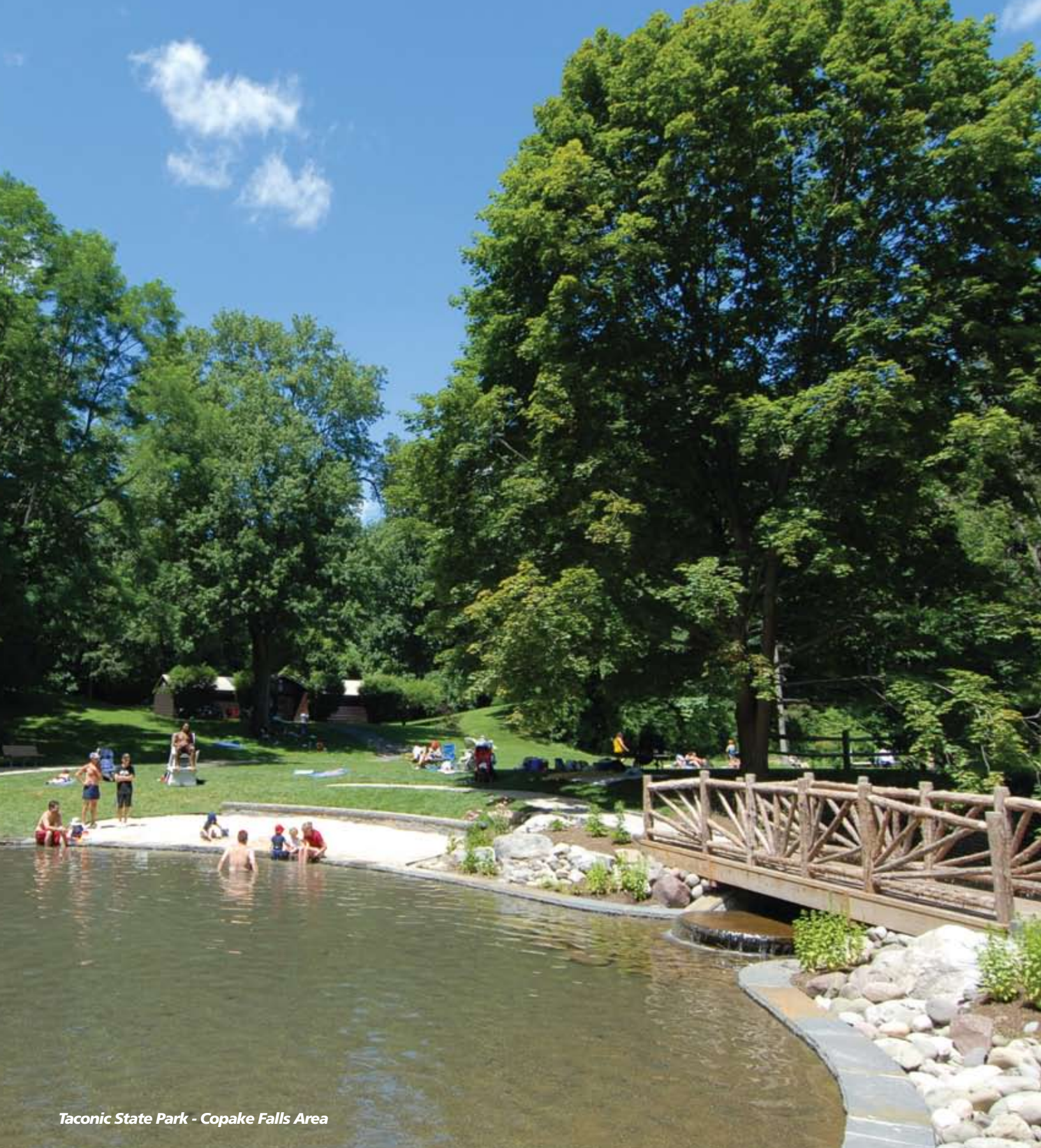
Taconic State Park - Copake Falls Area