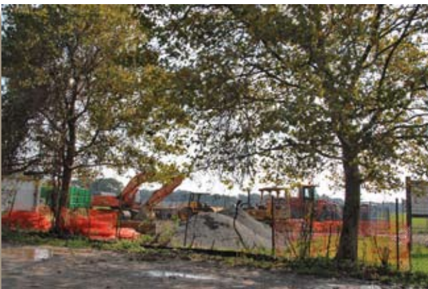
Brentwood State Park

a groundbreaking ceremony at Brentwood State Park, a major athletic complex that will provide greatly needed playing fields in this underserved area. This first phase of con-