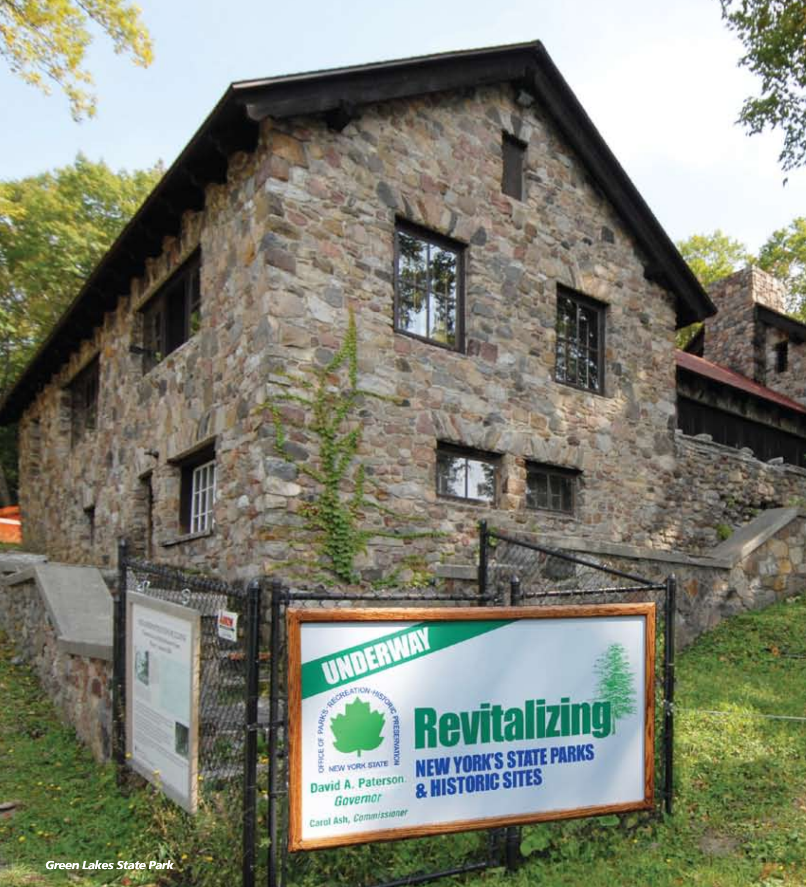
Green Lakes State Park