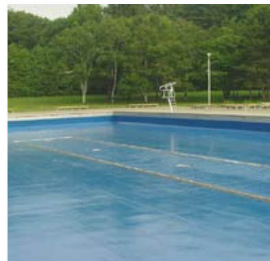
Saratoga Spa State Park

Drawing upon funds from the State Parks Capital Initiative, OPRHP initiated more than $1 million in improvements at Saratoga Spa State Park. The large Peerless Pool complex, including the handicapped-accessible main pool, slide pool,