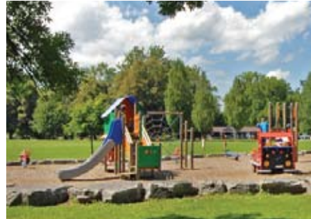
Finger Lakes State Park

region. This $1.2 million project created highly visible and very popular playgrounds in many of our facilities. Public response has been overwhelmingly positive. Children and their families, whether camping or on day trips, are enthusiastic about the new equipment. At each playground installation, community members and staff from other parks pitched in, along with the regional maintenance crew, in an old fashioned "barn raising" style event.