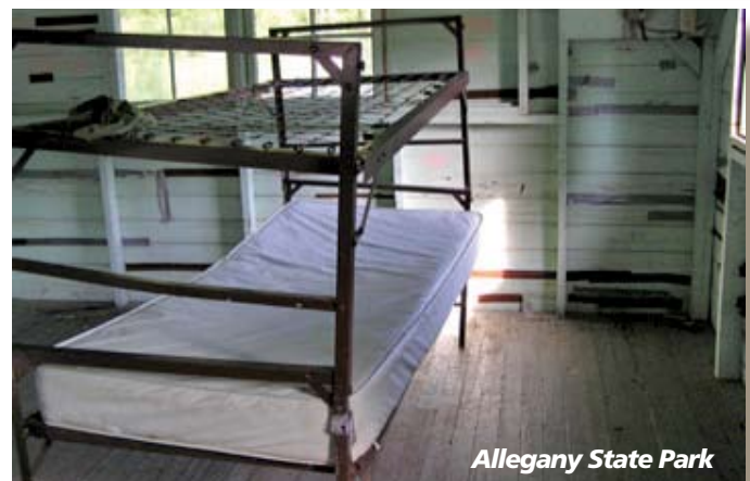
Allegany State Park