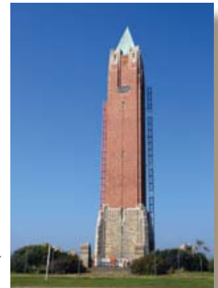
Jones Beach State Park