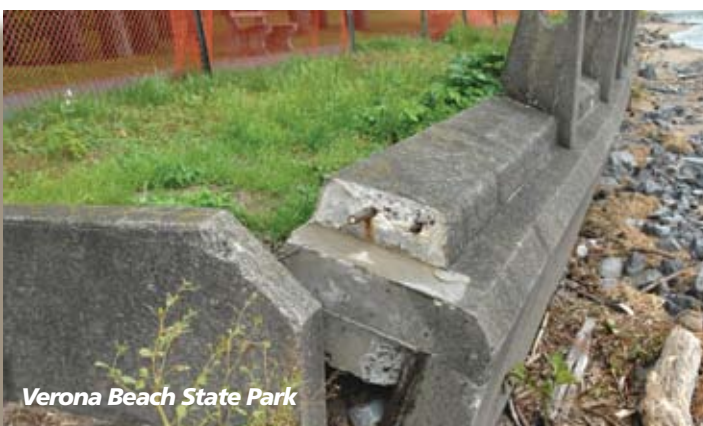
Verona Beach State Park