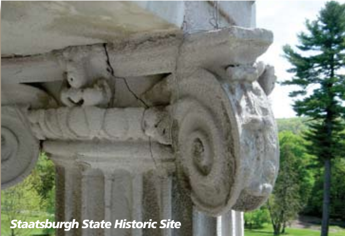
Staatsburgh State Historic Site