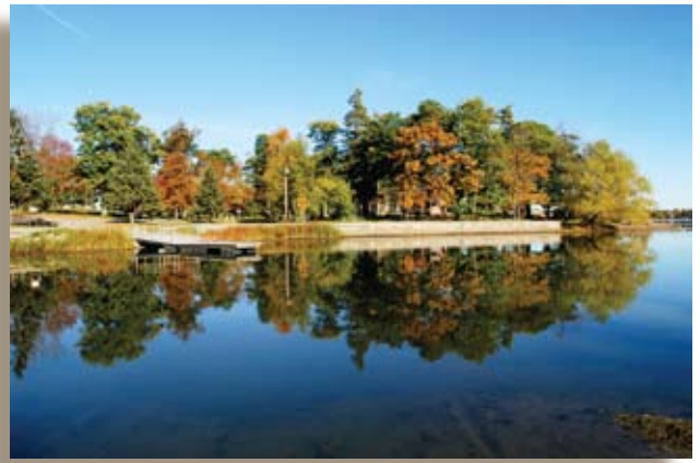
Kring Point State Park

are upgrading the public recreational vehicle sewage pumpout facility at Macomb Reservation State Park. In the spring of 2009, Cedar Point State Park will hook up to the Village of Clayton's municipal treatment sewage system, eliminating another outdated sewage treatment plant. All of these efforts will improve environmental conditions and reduce energy use in state park facilities.