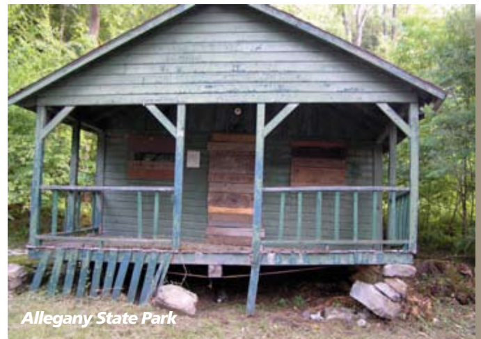
Allegany State Park

Fortunately, in 2008 New York State responded to the state park system's urgent funding needs. Under the leadership of Governor Paterson and with unified support from the Senate and Assembly, the enacted FY2008-09 state budget created a new $95 million State Parks Capital Initiative to supplement OPRHP's capital budget. This investment, coupled with other state, federal, and private funds available to State Parks, enabled the agency to implement a $132 million capital program for rehabilitation and improvements to our parks and historic sites. 2 All told, the agency is advancing 337 capital design and construction projects in 100 state parks and historic sites across New York State. OPRHP has aggressively advanced these projects - the agency is on track to fully spend and encumber the entire $132 million capital program within the current fiscal year.