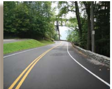
Letchworth State Park

Genesee engineering staff initiated design of a number of high priority park improvement projects, including waterline