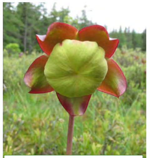
A pitcher plant flower emerges at Mud Lake in Robert V. Riddell State Park.

Every year, biologists and scientists from NYS Parks and NY Natural Heritage Program are witnessing firsthand the natural beauty of our NYS Parks.