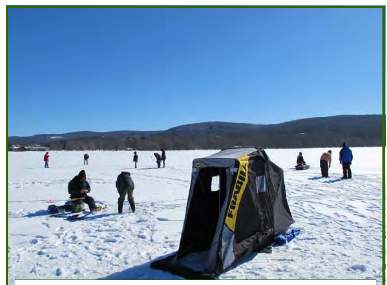
Anglers basked in the glorious sunshine while braving temperatures that barely reached 20 degrees F. A single ice shanty provided temporary relief from the cold on the ice. However, it remained vacant most of the time!