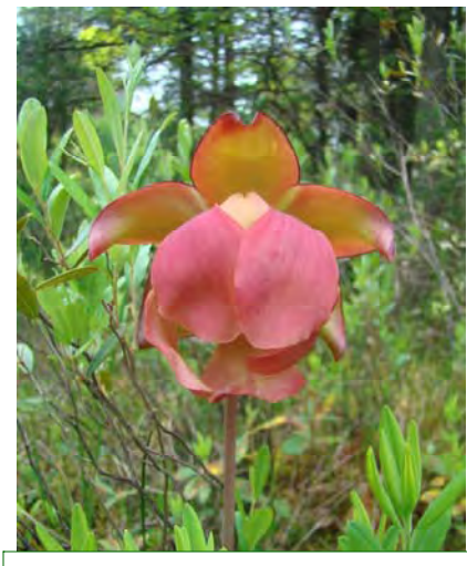
Across the state at Sterling Forest State Park, another pitcher plant blooms.

It is our hope that park patrons and readers of this newsletter will enjoy these remarkable photos as captured through the camera lenses of our staff.