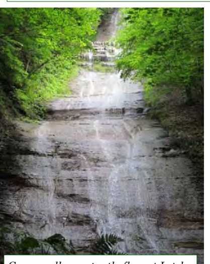
Gorge walls constantly flow at Letchworth State Park.