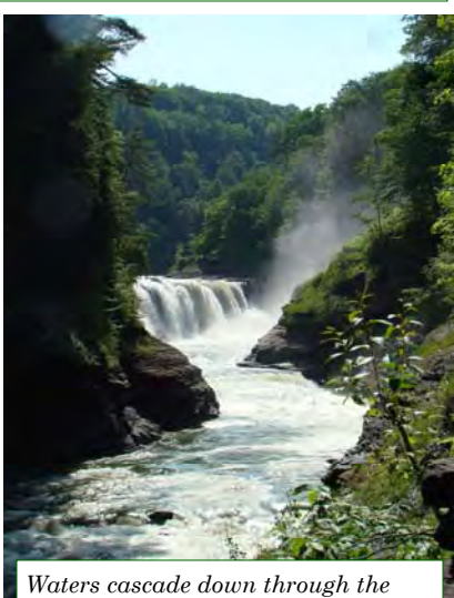
falls at Letchworth State Park.