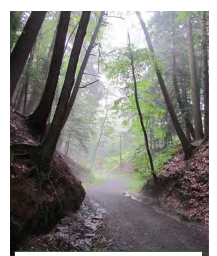
The Ferndell Trail weaves its way through Saratoga Spa State Park.