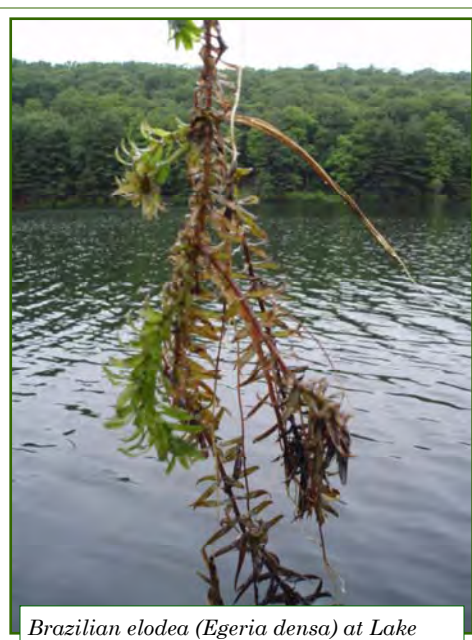
Stahahe, Harriman State Park

A containment device will be constructed at the outlet to the lake to prevent the sterile carp from escaping and possibly impacting non-target areas. This will be followed by stocking the lake with 10 carp per vegetated acre. Subsequent monitoring activities will follow to determine how effective the carp are at controlling elodea, and additional carp will be stocked if necessary. Hopefully, this early detection-rapid response effort will have positive results by preventing the spread of elodea to other lakes; restoring the biodiversity of the aquatic plant community in the lake; and reducing the recreational impacts on the lake.