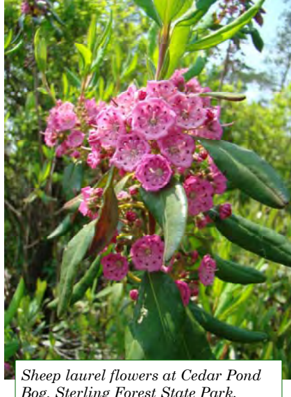
Bog, Sterling Forest State Park.