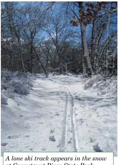
at Connetquot River State Park.