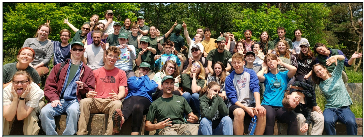
5th Annual FORCES Trainapalooza held at Letchworth State Park, May 30-31, 2019.

Keep an eye out on the FORCES website for the Who's Who publication that will highlight all of our 2019 FORCES Stewards. Searching for a spring internship? Be sure to contact your regional FORCES staff to inquire about spring opportunities.