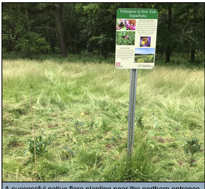
A successful native flora planting near the northern entrance of Letchworth State Park.

Conservation Stewards Christina Morrow and Alec Ritter, stayed busy this season with multiple projects at Letchworth State Park. At the start of their internship, they shared with me the desire to incorporate this environmental conservation experience into their future career plans. The main responsibilities for these two Geneseo students included assisting in slender false brome management, monitoring and mapping invasive species, constructing a wildlife fence, and preparing pollinator gardens at the north end of the park.