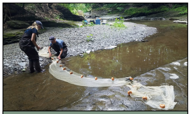
Hobart and William Smith Colleges students at Buttermilk Falls State Park setting up block nets prior to electrofishing.