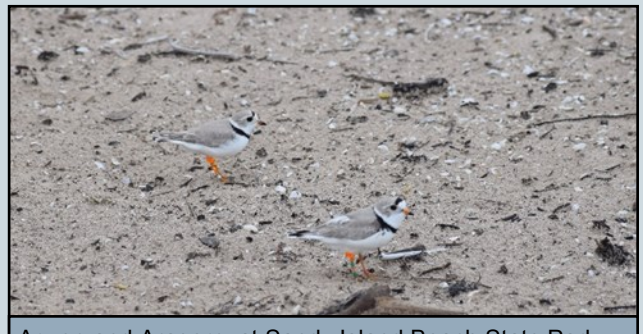
Arwen and Aragorn, at Sandy Island Beach State Park.

With the help of our Piping Plover Conservation team and FORCES stewards protecting and monitoring them – two out of three chicks survived (Chewie and Yoda) and hit the sky at the end of July. One other adult PIPL showed up, but didn't stick around long (dad is pretty protective). Our chicks from last year (Frodo, Gimli, Merry, and Pippin) have not shown back up yet, thus is the life of a critically endangered species. One of our chicks, Chewie (yellow dot), was documented in Clearwater, FL (thanks to citizen science!) on August 6<sup>th</sup>! Our project is slowing down for the season. We are still educating park patrons about this amazing species, and keeping our fingers crossed that we will see them all again come spring!