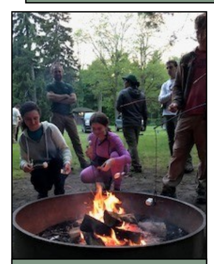
FORCES Stewards enjoying a campfire at Trainapalooza at Letchworth State Park.