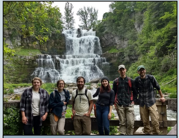
American hart's-tongue fern crew at Chittenango Falls State Park.