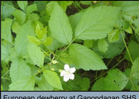
European dewberry at Ganondagan SHS

In its natural environment, European dewberry ( Rubus caesius ) is a loved species. It provides foragers in Europe and Asia such as birds, beetles, animals, and even humans with a great snack. To the untrained eye, European dewberry is easily misidentified for other Rubus species, but its big blue clusters of berries, long petiole, and small hooked prickles distinguish it from the rest. It thrives in riparian zones, which are areas with well-drained and moist soils near rivers and streams. For this reason, it was brought to the United States in 1897 to be used as an erosion control tactic. European dewberry has since grown in conjunction with native vegetation for hundreds of years, but recently it has been considered a threat to natural communities due to its invasive tendencies. Local scientists and hikers have observed it to displace native vegetation, reduce streambank