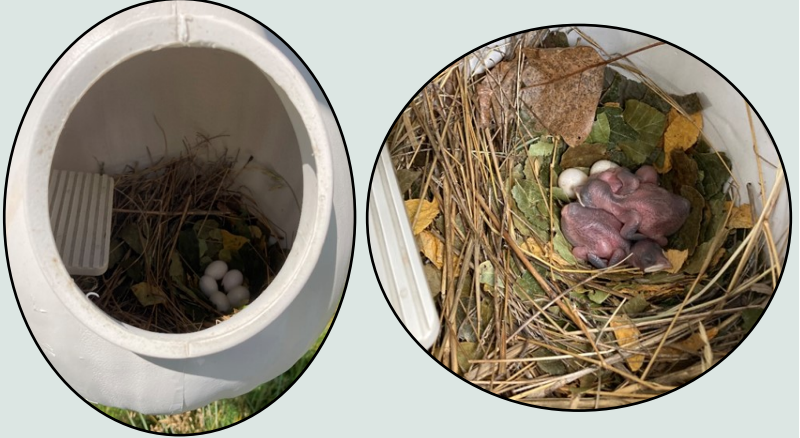
Newly installed nest boxes for purple martins with a clutch (left) and resulting brood of martin nestlings (right).

Throughout the remaining duration of 2021, we plan to work cohesively as a team to find new ways to implement short-term conservation initiatives with long-term preservation in mind. It is our hope to welcome in new FORCES Stewards to share in the planning and execution of such initiatives.