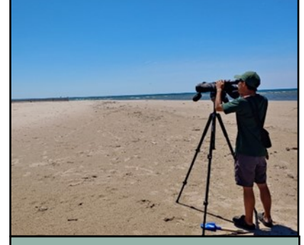
Mack Conan, Regional Field Technician, observing plovers through a spotting scope.

After many hours of staring through a spotting scope for behavioral observations and general monitoring, we confirmed seven unique adult birds with four nesting at Sandy Island Beach (SIB) State Park in addition to three migrants stopping over for a bit. Our veteran pair, Aragorn and Arwen, migrated safely back to the southern states for the approaching wintering months but sadly our parents did not have a successful chick-rearing experience. All three chicks (Sandy, Montario, and El Dorado) did not survive but hopefully our re-occurring pair can try again and make a better season in 2022. To bring some hope, a chick from the 2020 season year returned home briefly and gave her dad a little trouble. Stevie Nicks was spotted by Meredith Grimshaw (DEC Dune Steward), Mack Conan (Regional Field Technician) and Kennedy Sullivan (Piping Plover Field Tech). Stevie stayed until July 4<sup>th</sup>. Our brand new pair, Ajax and Arlene, found their way to Sandy Island to nest. They experienced a greater outcome, with two of their four chicks reaching their fledge date and migrating! We give a loved good luck to their chicks, Mr. Clean and Dr. Bronners, who may have stayed longer than we expected, but we are excited to hopefully hear reports of them on their