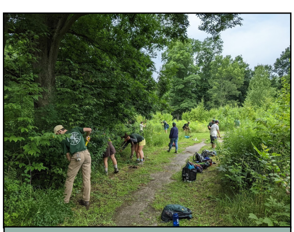
FORCES Stewards and Staff remove invasive species at Chittenango Falls State Park.