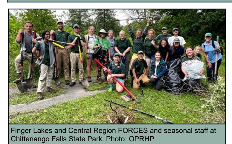
Through the summer season, the Chittenango Ovate Amber Snail (COAS) project continued their efforts with invasive management. This included removal of pale swallow-wort and woody invasive species stems along the Gorge and Creekside Trails, and along the roadside of Chittenango Falls State Park. In addition, we also clipped and removed European dewberry. In sections where dewberry was removed, there is evidence of native species growing back including goldenrods, sedges, and aster species. The Finger Lakes Region's Stewards and Environmental Field Team visited Chittenango Falls to help with buckthorn removals and did a forest health survey. During their visit, we removed over 200 stems of European buckthorn!

Reservation! Several surveys for Tree of Heaven and spotted lanternfly were completed and we were thankful to not detect any lanternfly at Clark Reservation or Chittenango Falls. Lastly, we started to wrap up work on jumping worm experiments and field sampling with our partners at SUNY Cortland and Cornell University.