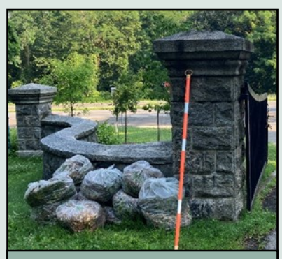
One weeks-worth of black swallow-wort.

FORCES Stewards Will Starkey and Felix Gonzalez took to land, water, and air whilst supporting preservation initiatives at Rockefeller State Park Preserve (RSPP). On the terrestrial plane, early summer marked a period in which the RSPP stewards focused their efforts on hand-pulling nearly 70 garbage bags of black swallow-wort, a highly-invasive vine detrimental to sensitive wildlife areas. This quantity of hand-removal inevitably resulted in environmental disturbance, but our long-term goal will be to replant native flora where this invasive flora was removed. A special thanks is extended to our new Flora Steward, Devyani Mishra, who has been instrumental in leading flora initiatives with our FORCES Stewards. These initiatives included the identification and removal of new invasive flora within the preserve, as well as monitoring floral diseases, such as beech leaf disease within the preserve.