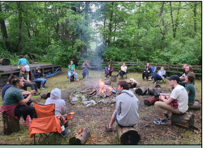
Trainapalooza participants sit around a campfire during the two-day training at Watkins Glen State Park in early June.