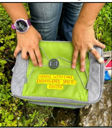
Photograph of SUNY ESF lab reared snails to be released into the habitat zone at Chittenango Falls State Park.