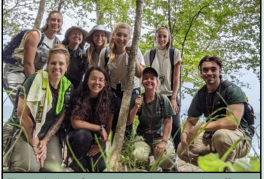
Finger Lakes Stewards and seasonal staff at Chimney Bluffs State Park during an invasive species systematic survey.