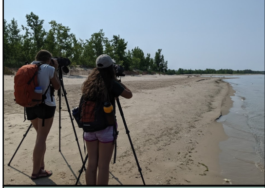
FORCES Stewards using spotting scopes to observe shorebirds at Sandy Island Beach State Park.

COAS Steward Foster Valle tabling at Chittenango Falls State Park.