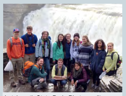
Letchworth State Park.

We are just getting started and have passion and momentum in our membership to propel us forward. You will be hearing a lot about SUNY Geneseo in the coming years!