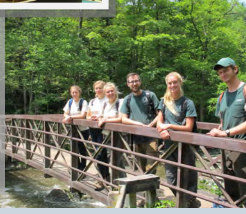
American hart's-tongue fern Conservation Stewards. Chittenango Falls State Park.