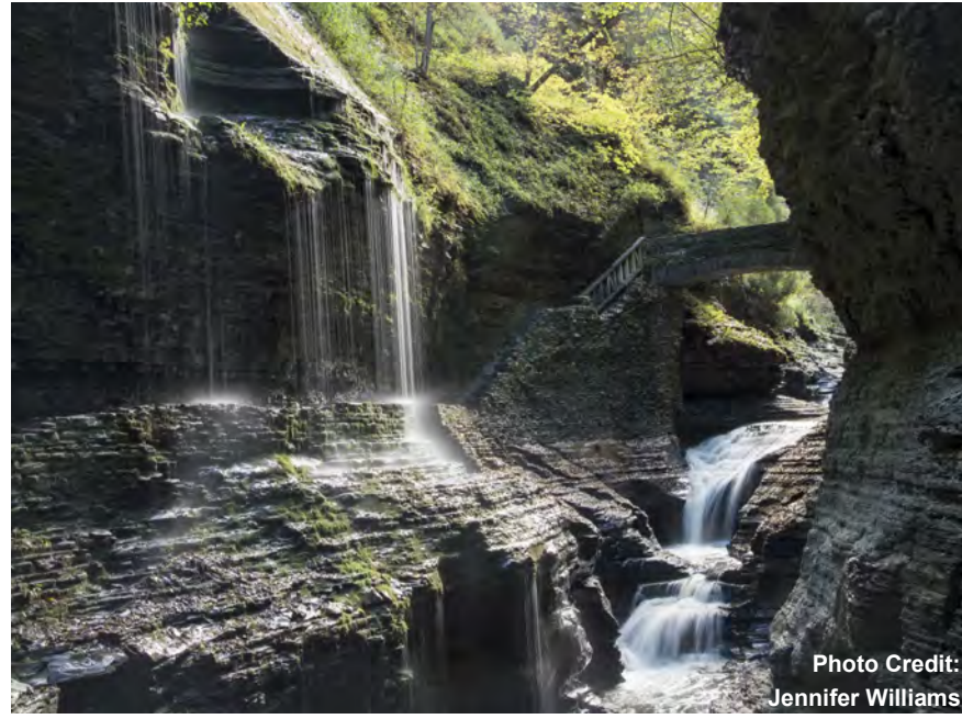
Watkins Glen State Park

The FORCES mission is to engage New York State college students to simultaneously improve OPRHP resources and enrich student academic, recreational, and career opportunities.