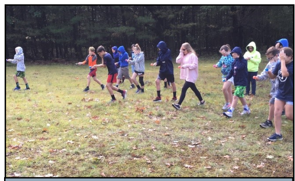
Environmental Awareness Days, Jefferson County.

counties with students who hear the recovery story of the Great Lakes piping plovers of New York and play a challenging game – putting them in the piping plovers pigeon-toed shoes! We've held events where people of the area come and learn about the piping plovers habitat, migration, conservation status, and what the people in the community can do to help! We said goodbye to the project's 10-month NYS Parks Corps member, and started looking for our next that will come on in January and stay throughout the