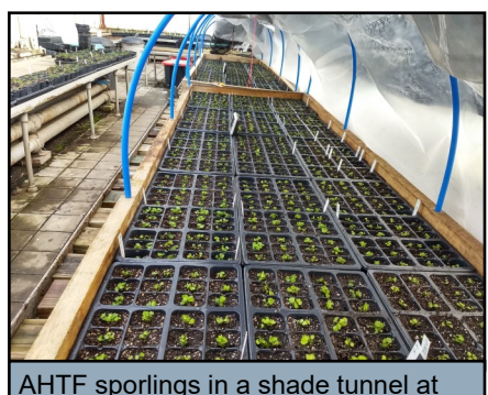
AHTE sporlings in a shade tunnel at Sonnenberg Gardens.

season with the project! Winter will fly by, and our plovers will be back ready to nest before we know it!