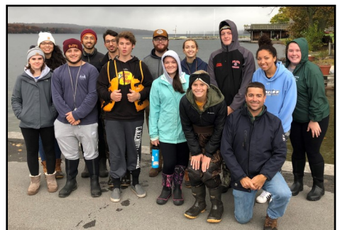
October YARE workshop with Cazenovia College.