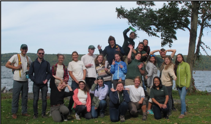
6th Annual FORCES Gathering at Taughannock Falls State Park.

The 6th Annual FORCES Gathering was held in September at Taughannock Falls State Park. As always, it was a great day for networking with each other and Park staff as we celebrated our program accomplishments. Our 2019 FORCES Who's Who highlights 102 FORCES Stewards from the Allegany, Genesee, Niagara, Finger Lakes, Central, Taconic, and Saratoga/Capital Regions! FORCES' institutional relationships are strengthening at SUNY Cortland with a possible club establishment soon, see page 16.