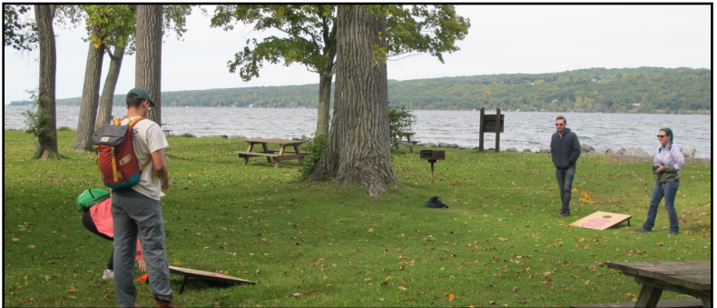
FORCES Stewards enjoying lawn games at the 6th Annual FORCES Gathering at Taughannock Falls State Park.