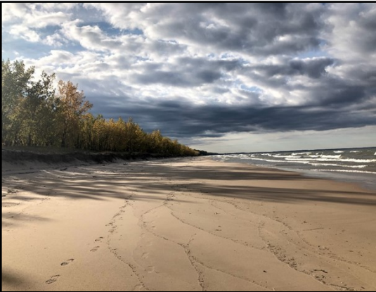
Sandy Island Beach in October.