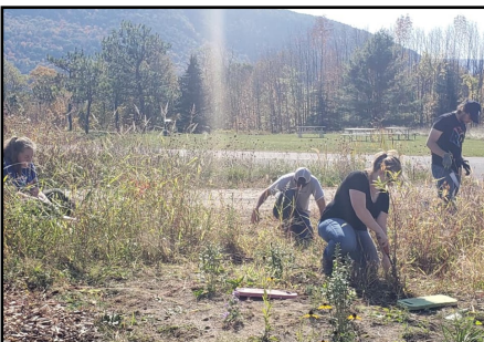
SUNY Cobleskill's Society for Conservation Biology members at Minekill State Park.

A pollinator garden was constructed this past year at Minekill State Park, and plants were installed in the spring with the help of park staff and members of the Student Conservation Association. With decreasing numbers in our insect populations, these can be a great way to provide aesthetics to any landscape/park, while also proving a food source for many insects, that in turn can benefit entire ecosystems. Follow up weeding is necessary to allow for growth of the desired nectar species.