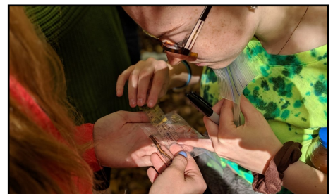
Students observing a red-backed salamander.

In addition to projects involving invasive species, as part of our classroom investigation of amphibian decline, we helped monitor salamander boards in Jennings Pond, Buttermilk Falls State Park. The students loved finding the red-backed salamanders and