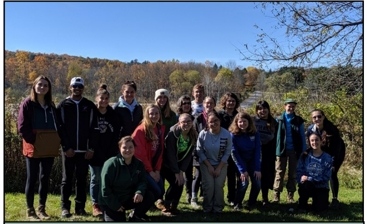
Ithaca College students and OPRHP staff.