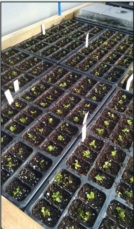
Hart's-tongue fern sporelings in a shade tunnel at Sonnenberg Gardens.

To support environmental stewardship projects across several regions of New York State Parks, the Plant Materials Program collects and propagates seed from a variety of native species. Plants are grown in dedicated space in the historically-significant greenhouse complex at Sonnenberg Gardens & Mansion State Historic Park. Many plants in state parks are genetically distinct and in need of conservation – which is where the Plant Materials Program comes in.