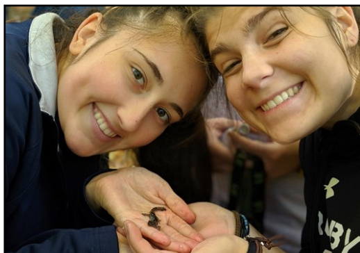
Ithaca College Conservation Biology Students at Buttermilk Falls State Park.