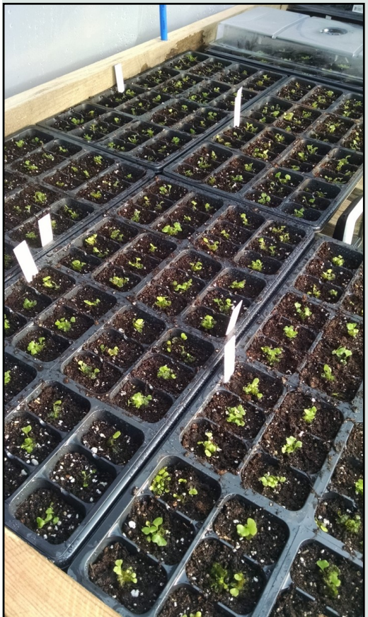
Hart's-tongue fern sporelings in a shade tunnel at Sonnenberg Gardens.

To support environmental stewardship projects across several regions of New York State Parks, the Plant Materials Program collects and propagates seed from a variety of native species. Plants are grown in dedicated space in the historically-significant greenhouse complex at Sonnenberg Gardens & Mansion State Historic Park. Many plants in state parks are genetically distinct and in need of conservation – which is where the Plant Materials Program comes in.