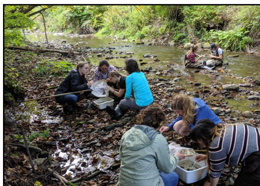
Benthic macroinvertebrate sampling with Ithaca College Conservation Biology class at Robert H. Treman State Park.