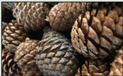
Pitch pine cones.

If you are interested in supporting these and other projects, please reach out to the FORCES program! This work would not be possible without the assistance of our enthusiastic FORCES Stewards.