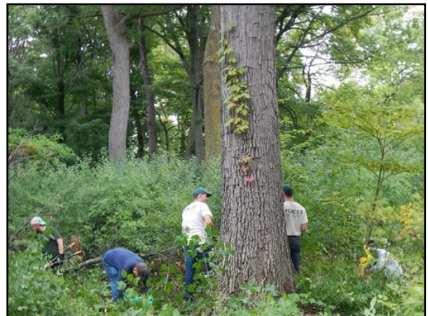
FORCES Stewards help remove common buckthorn from Whirlpool State Park.