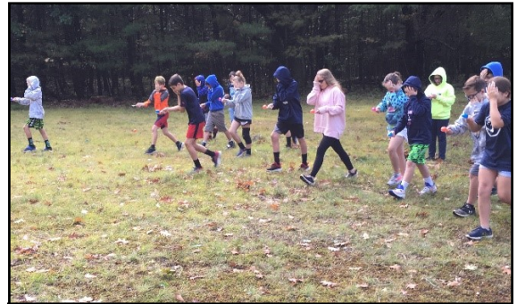
Environmental Awareness Days, Jefferson County.

As classrooms started back up, we participated in large environmental events in Jefferson, Oswego, and Onondaga