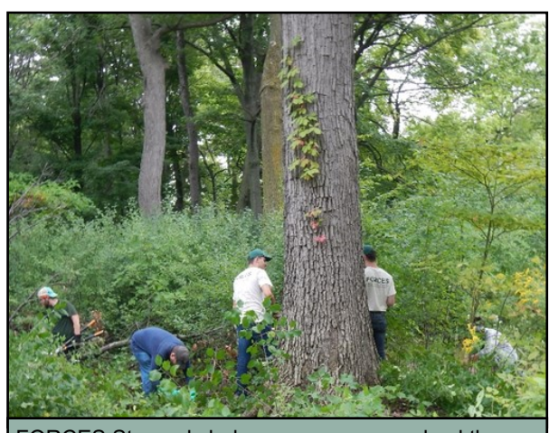
FORCES Stewards help remove common buckthorn from Whirlpool State Park.