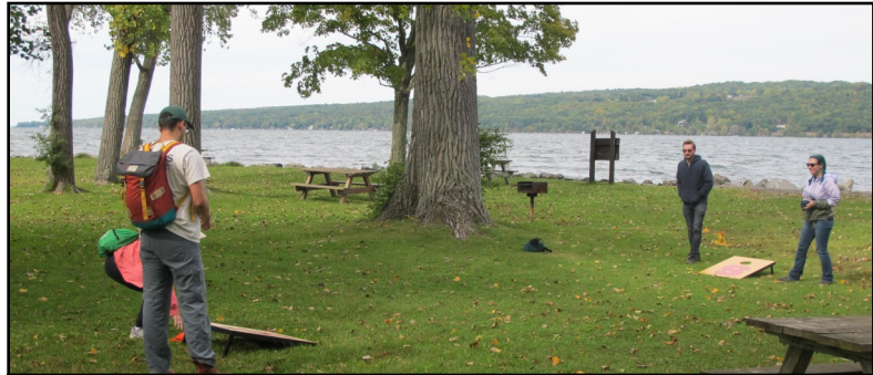
FORCES Stewards enjoying lawn games at the 6th Annual FORCES Gathering at Taughannock Falls State Park.