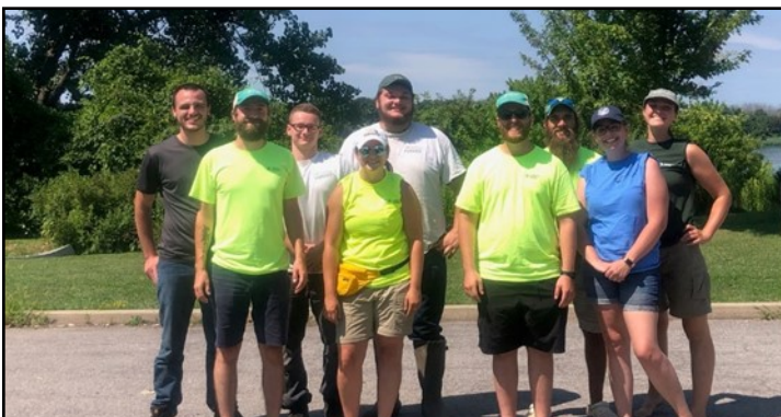
FORCES Stewards assist with the survey and removal of an infestation of European frog-bit at Buckhorn Island State Park.

To learn more about WNY PRISM, visit our website (wnyprism.org), and follow us on Facebook (@wnyprism) and Instagram (@wnyprism8) for exciting behind the scenes snapshots of our work.