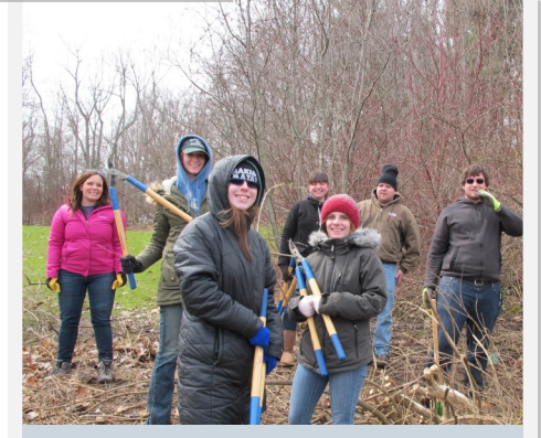
SUNY Oswego students tackle amur honeysuckle at Fair Haven Beach State Park.