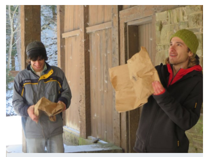
Stewards remove fluff from milkweed seeds on a freezing winter afternoon.

Every semester seems to be busier than the last, and spring 2016 was no exception. We had 8 stewards from Ithaca College, SUNY Cortland, and Cornell University who worked on lesson plans, archiving, emerald ash borer management plans, Laricobius nigrinus surveys (the biological control for