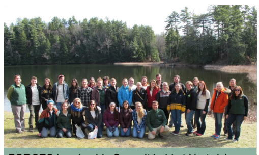
FORCES Leadership Summit held at Hartwick College Pine Lake Environmental Campus.

The second annual FORCES Leadership Summit was held on April 10, 2016 at Hartwick College's Pine Lake Environmental Campus. This event brought together 29 students from 8 academic institutions to provide strategic planning for the program, enhance connectivity among parks