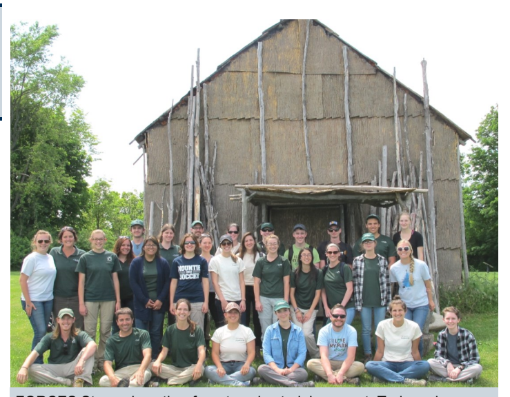
FORCES Stewards gather for a two day training event; Trainapalooza held at Ganondagan State Historic Site.

I give thanks to our Stewards for all that they do, and I'll see you at the Great New York State Fair!