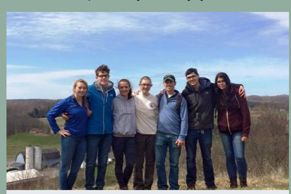
Ash tree survey crew.

Next fall I look forward to seeing what new and creative events the club puts on. In the meantime, I hope everyone enjoys their summer!