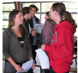
Left: Students and staff play twister at the 2015 FORCES Gathering. Right: Students network before career trainings.