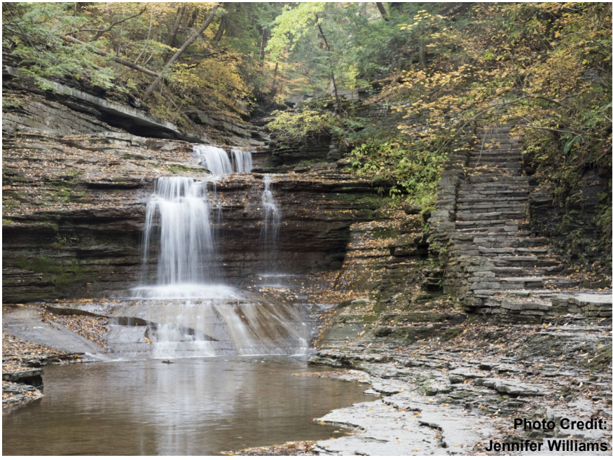
Buttermilk Falls State Park

The FORCES mission is to engage New York State college students to simultaneously improve OPRHP resources and enrich student academic, recreational, and career opportunities.