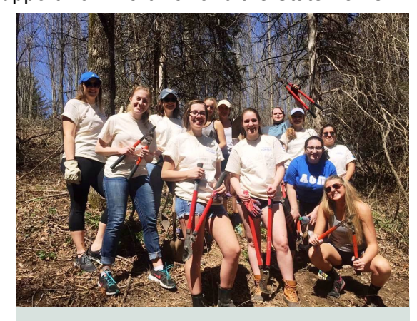
Multiflora rose removal at Mine Kill State Park.

Next semester we are excited to have plenty more invasive species removals and more volunteer events than this semester with our continued support from Hartwick and the State Parks!