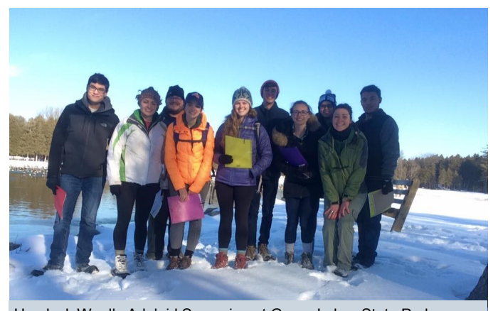
Hemlock Woolly Adelgid Surveying at Green Lakes State Park.

This past semester, ESF FORCES has again been very busy, both on and off campus. We started off the semester by up-cycling and tie dying old FORCES t-shirts. At ESF's winter carnival, we made pine cone bird feeders with sunflower butter and bird seed.