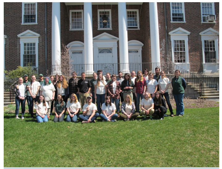
3<sup>rd</sup> Annual FORCES Summit, Wells College, April 9, 2017.

Nowhere is this more evident than at our annual student events—FORCES Summit (Page 1), Trainapalooza (Page 14), and the Fall Gathering, this year on October 1st (Page 11). I am proud to have been present at all of them! These events capture and showcase the enthusiasm, talents and successes of our FORCES staff and students. In addition, we get to gather at some of the most amazing State Parks and academic campuses. For example, Le Moyne College, Hartwick College and Wells College have all hosted the FORCES Summit, and we have plans