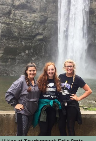
Hiking at Taughannock Falls State Park.