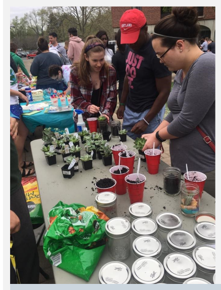
Above: Le Moyne FORCES Club members create terrariums at the 2017 Earth Jam.

Left: Participant takes aim at the 11th Annual Women in Nature Workshop.