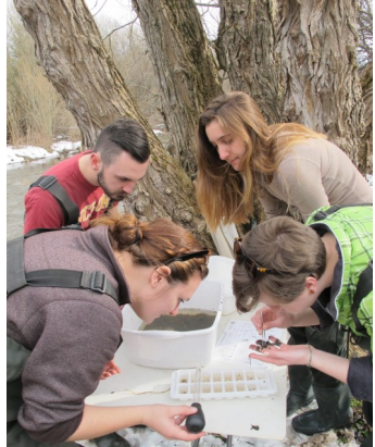
Members of the SCA and ECC identify macroinvertebrates collected from the creek.

Our SUNY ESF Federal Work Study partnership continued to remain strong with 6 work study stewards on board for the spring semester. Additionally, 7 stewards worked on projects that included native seed collection and propagation planning, aquatic education planning and implementation at the YARE (Youth Aquatic Resource Education) Workshop held in April at the Onondaga Lake Visitor's Center, environmental education programs, Chittenango ovate amber snail (COAS) lab work at ESF, and American hart's-tongue fern mapping at Clark Reservation. FORCES sustained its strong presence at the Women in Nature (WIN) 11<sup>th</sup> Annual Workshop held in April.