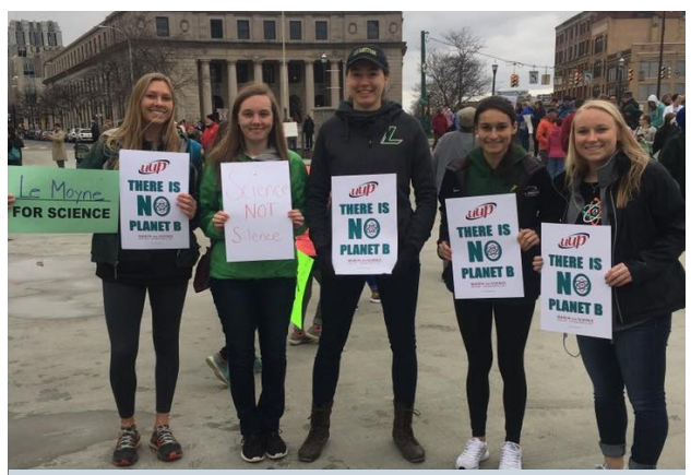
March for Science, April 22<sup>nd</sup>, Syracuse, NY.

We began the spring semester by participating in our school's annual spring club fair. We enjoyed recruiting people to join FORCES! We also did eco-friendly Friday's twice a month outside of our cafeteria where we passed out eco-friendly facts and people could decorate a canvas bag to help promote sustainability. We had planned to do a spring camping trip, but unfortunately the weather did not corporate. In April, we were busy with participating in the Syracuse satellite March for Science and volunteering at Women in Nature. Members enjoyed participating in the March for Science and doing fun activities at Women in Nature. Also in April, we did Earth Jam on our campus where people could make succulent and air plant terrariums. We had people make over eighty terrariums! We also planted flower seeds in flower pots for our community service event to donate to Tiny Homes for Good. Everyone had a lot of fun planting seeds! In the fall we are looking to growing our membership, doing more on campus events, and participating in more events at state parks!