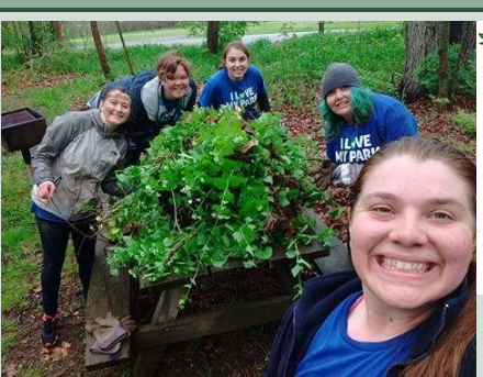
The garlic mustard haul at Robert H. Treman State Park I Love My Park Day.