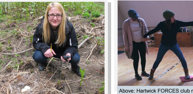
Above: Hartwick FORCES club members participate in team building activities at Hartwick College's Pine Lake Preserve.