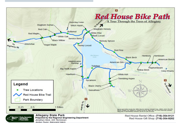
The Red House Bike Path hosts new signage tor a tour of the trees of Allegany State Park.

My FORCES project for the winter months was the new interpretive tree trail that is on the Red House bike path. I was able to plan out what trees went on the trail. assist in mapping them. and condense all the information into a brochure. The trail features trees such as yellow birch, sugar maple, and tuliptree along with 28 other species. The majority of the trees incorporated into the tour are native to the region.