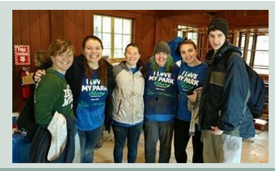
Above and below: I Love My Park Day at Robert H. Treman State Park.

Cornell Cooperative Extension. The other two were with Cayuga Lake Watershed Network at Long Point and Great Gully. We went to Fillmore Glen and helped to remove pine needles from the park area. Lastly, we went to Robert H. Treman for I Love My Park Day. We helped to remove garlic mustard, plant trees and helped to remove excess dirt and rocks after planting trees.