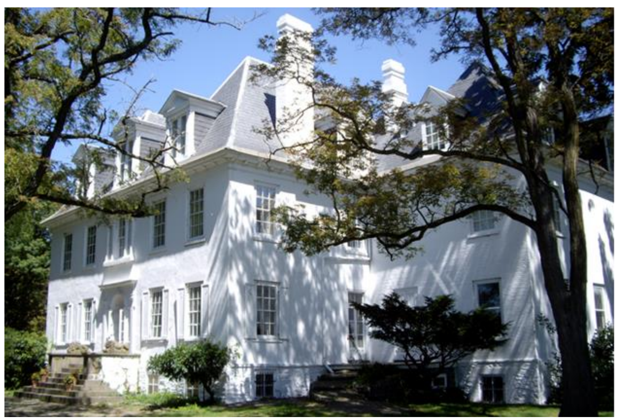
Clermont's mansion today is largely representative of its 1930s appearance.

impacts on national parks indicates that visitation at almost all parks may change as severe heat waves become more frequent and last longer.<sup>6</sup>