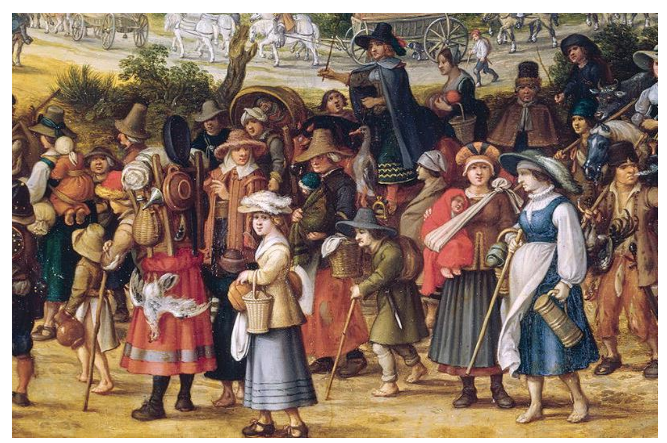
Palatine refugees, from "War Scene" (detail) by Flemish painter Sebastiaen Vrancx (1573–1647)

The visitor tour of Clermont's mansion reflects how the structure evolved over time. After the mansion was burned, in 1777, it was rebuilt as a two-story brick Georgian residence (apparently using the north and south (end) walls of the