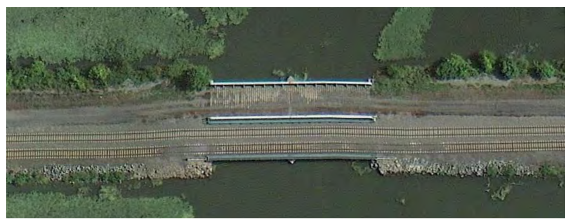
Metro-North Causeway bridges over the mouth of Fishkill Creek with two parallel bridges side by side

3.2B - Bridge Across Wetlands: In order to avoid using private property, a short section of the utility easement would be used to go as far east as possible on publicly owned land. This land does not extend far enough to reach the point at which the creek narrows, so the bridge would have to cross along the edge of the wetland area. Supports would be placed where there is some stable ground for landings as shown to the right. This bridge would provide visual access to a very unique habitat.