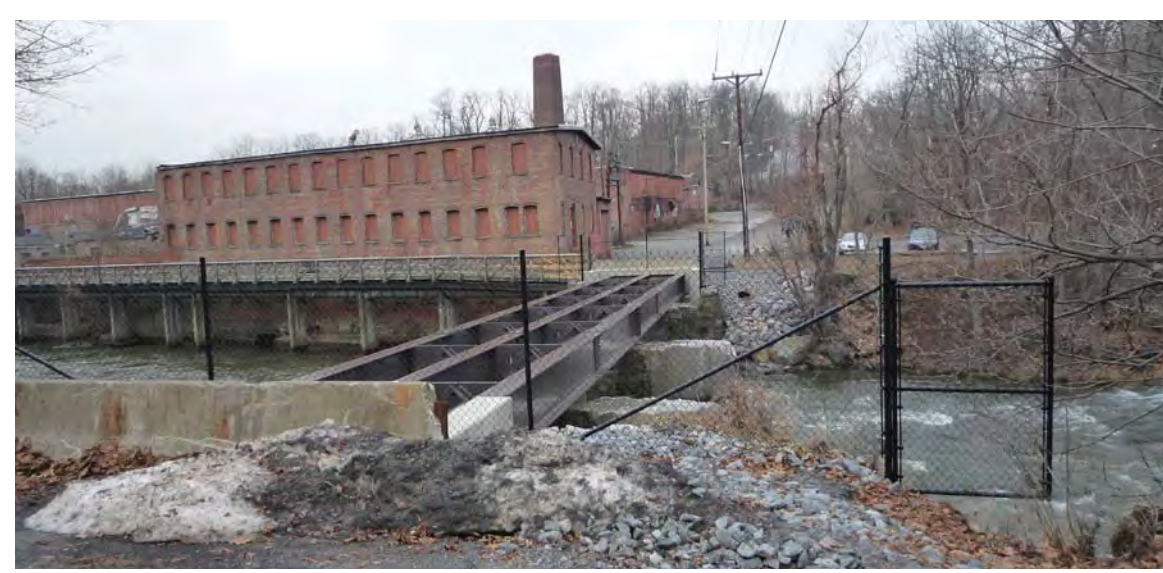
Tioronda Bridge looking north