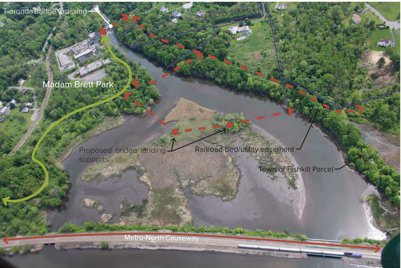
Fishkill Creek crossing options. Property lines shown in purple are approximate and not to scale.

3.2C - Bridge Across Fishkill Creek Mouth: To minimize shading and wetland impacts to the creek, a shorter span could be used to cross at the mouth where the creek narrows. This would require an easement across one of the privately owned parcels along the creek, but would not extend beyond the first private parcel. A shorter span in this location would reduce the environmental impacts.