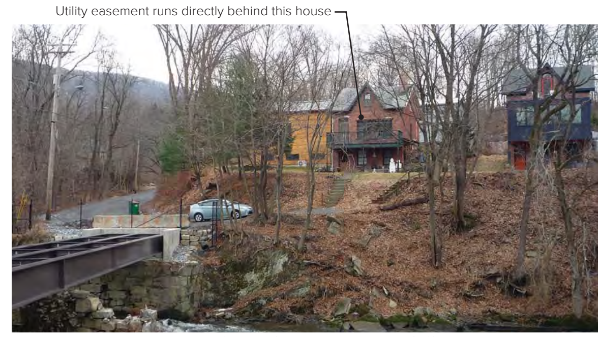
Private property on the south side of Fishkill Creek, Tioronda Bridge (left)

3.2D - Tioronda Bridge via Utility Easement: This graded land is an old railroad bed and runs through what today is private property. It is currently used as a utility easement for Central Hudson's power lines, and is cleared wide enough for a trail. This would provide an off-road alternative to the 2 mile climb to the Mount Beacon trailhead to cross Fishkill Creek over the Route 9D/Wolcott Ave Bridge, which does not connect directly to the existing trail in Madam Brett Park. Negotiations with private property owners would have to take place in order to align the trail through the easement.