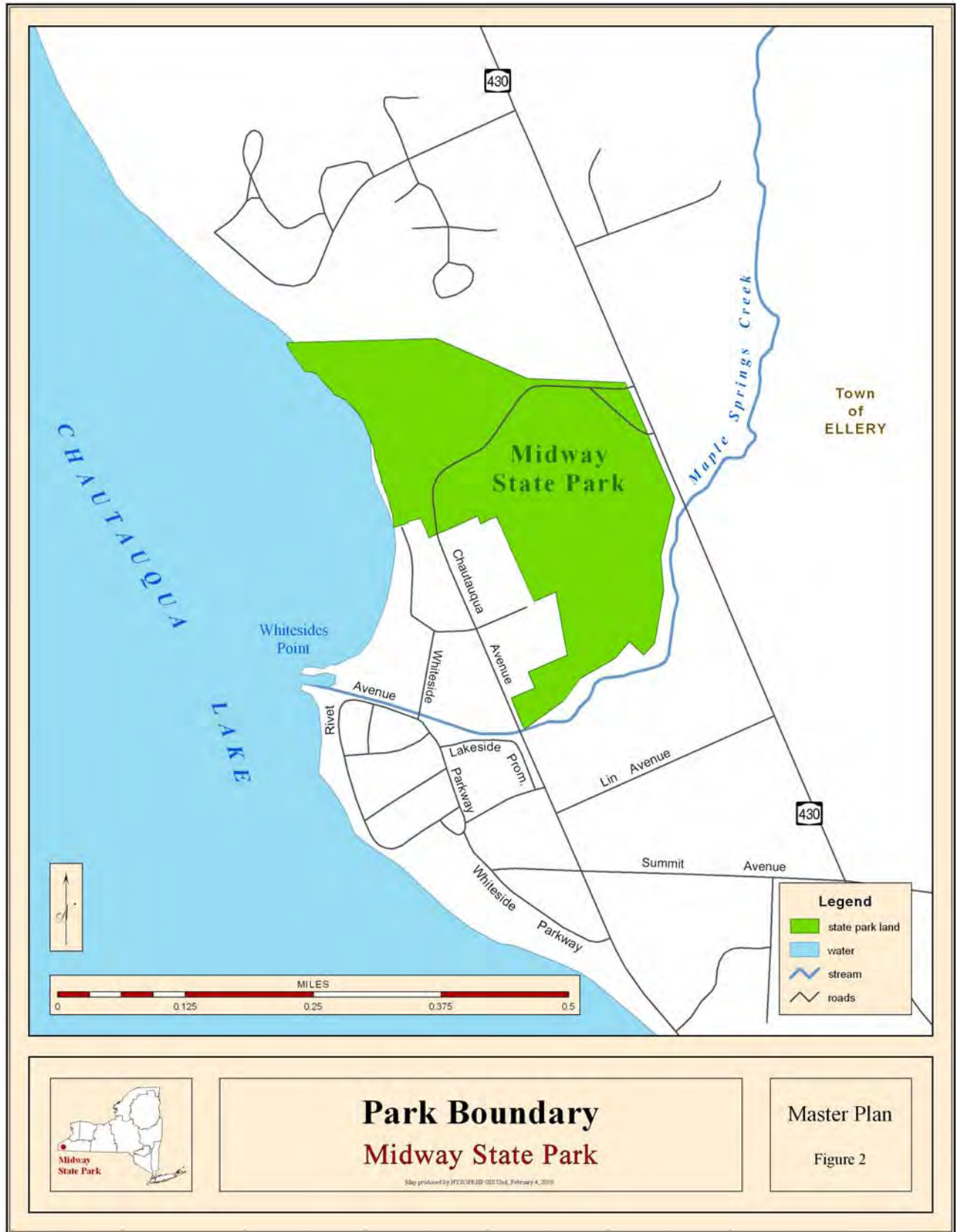
Figure 2 Park Boundary