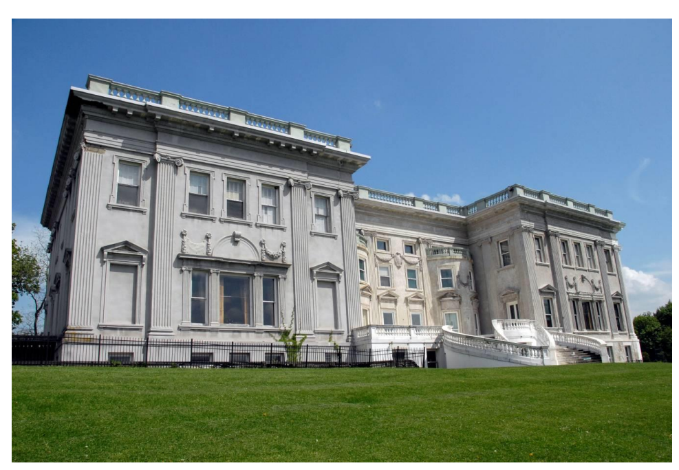
April 17, 2013