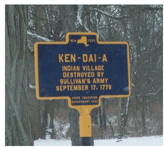
Historical marker at the location of Kendaia, a Native American archaeological site located within the park.

Long before Europeans arrived on the continent, Native Americans were living and traveling by way of footpaths throughout the Finger Lakes and along the shores of Lake Ontario. For more than 10,000 years, prehistoric people made settlements, grew agricultural crops, hunted, and fished in the Finger Lakes region, with the Iroquois Nation the last of a series of Indian cultures to have lived here.