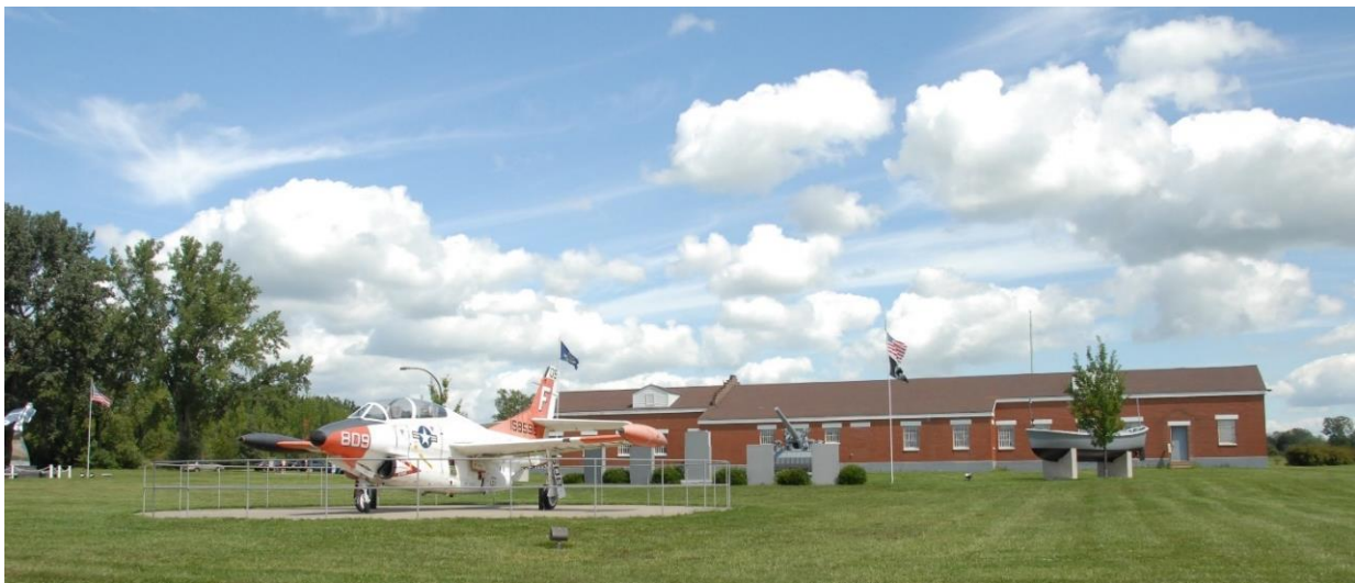
Sampson Memorial Naval and Air Force Museum

This action will allow the park to offer a more complete picture of the site’s military history. There is strong interest in this type of content, and it may help attract new visitors to the park.