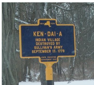
Historical marker at the location of Kendaia, a Native American archaeological site located within the park.

Long before Europeans arrived on the continent, Native Americans were living and traveling by way of footpaths throughout the Finger Lakes and along the shores of Lake Ontario. For more than 10,000 years, prehistoric people made settlements, grew agricultural crops, hunted, and fished in the Finger Lakes region, with the Iroquois Nation the last of a series of Indian cultures to have lived here.