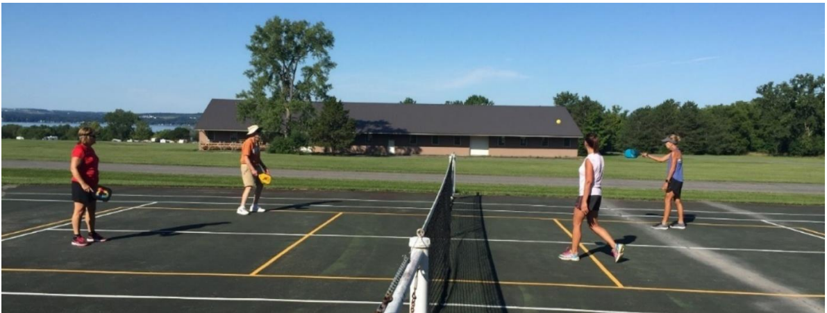
Pickleball at Sampson