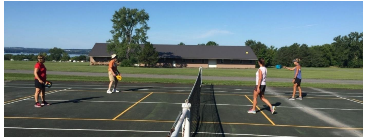
Pickleball at Sampson