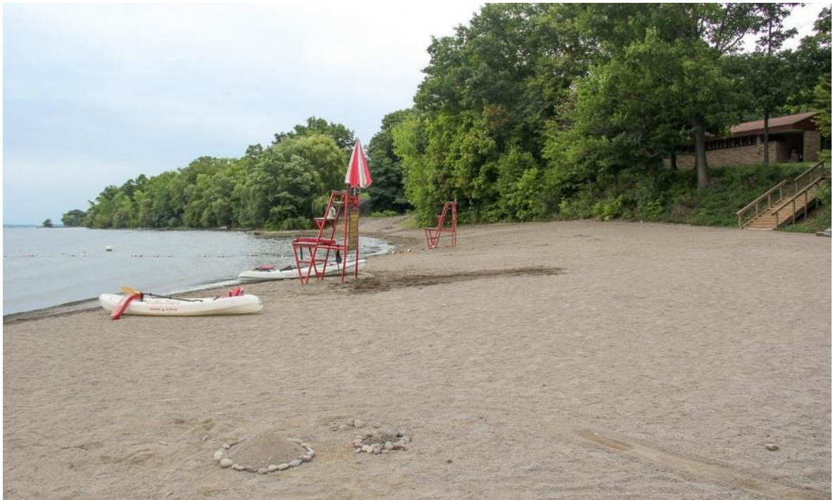
Sampson SP beachfront on Seneca Lake

The implementation of the balance of the action items in the master plan for the Park will be divided into priority phases. These elements are subject to reorganization based on available funding for specific components in the Master Plan.