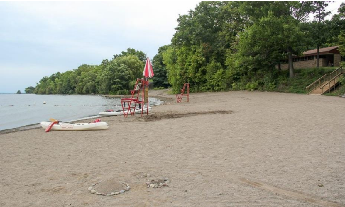
Sampson SP beachfront on Seneca Lake

The implementation of the balance of the action items in the master plan for the Park will be divided into priority phases. These elements are subject to reorganization based on available funding for specific components in the Master Plan.