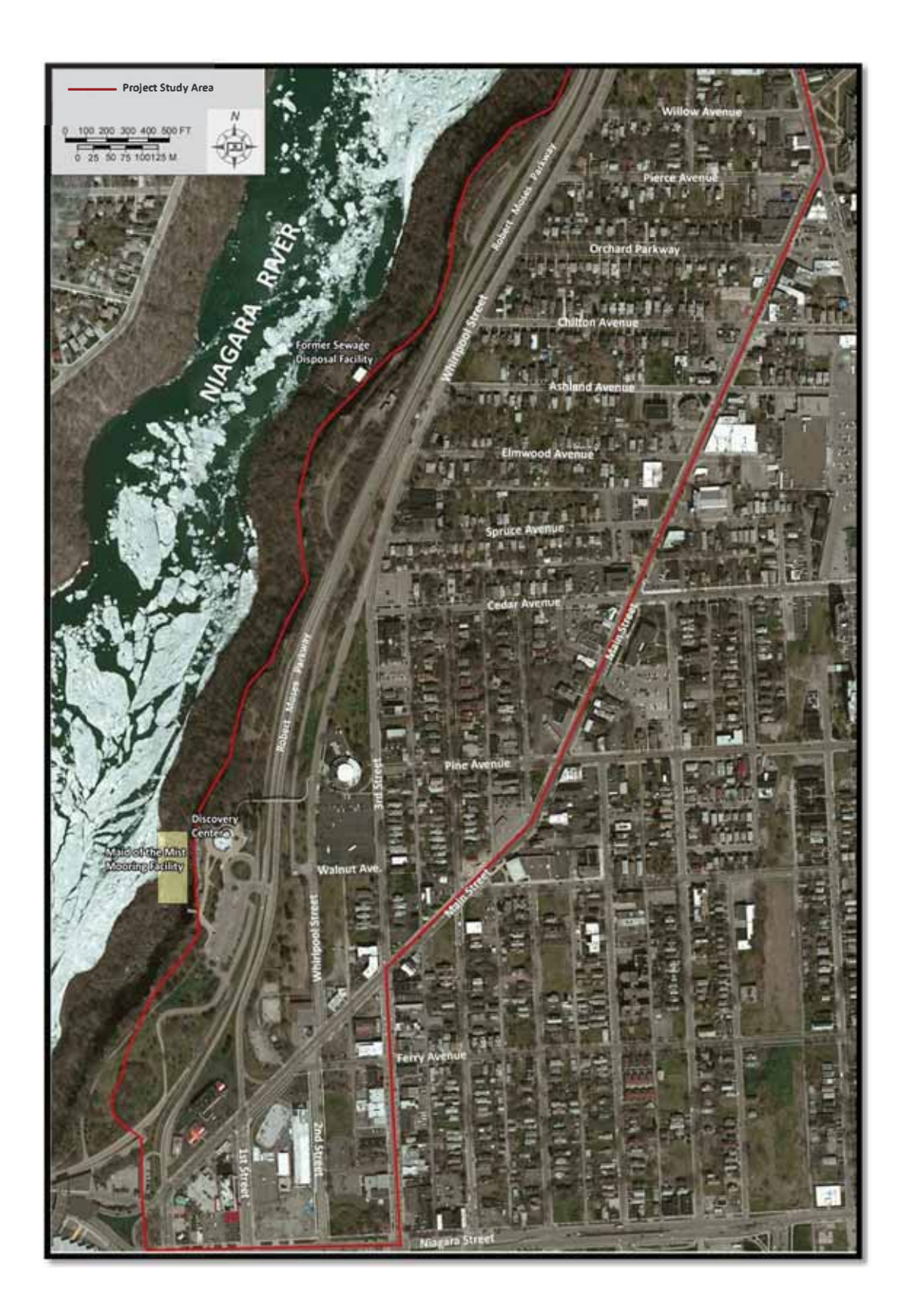
Figure 2-a - Southern portion of the Project Study Area / Project's Area of Potential Effect depicted on a recent aerial photograph (after Google 2014).