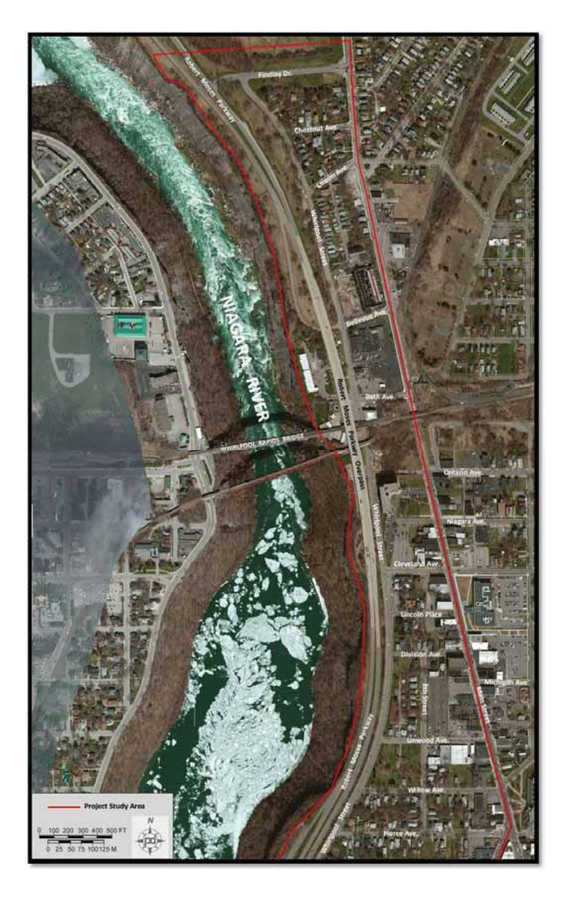
Figure 2-b - Northern portion of the Project Study Area / Project's Area of Potential Effect depicted on a recent aerial photograph (after Google 2014).