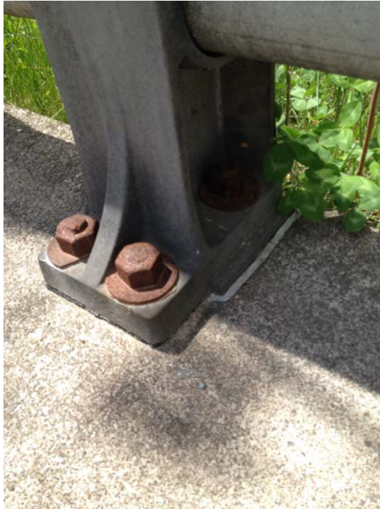
Photo 3: BIN 1068229. View of railing post with the pad beneath the base and caulk around the perimeter of the base.