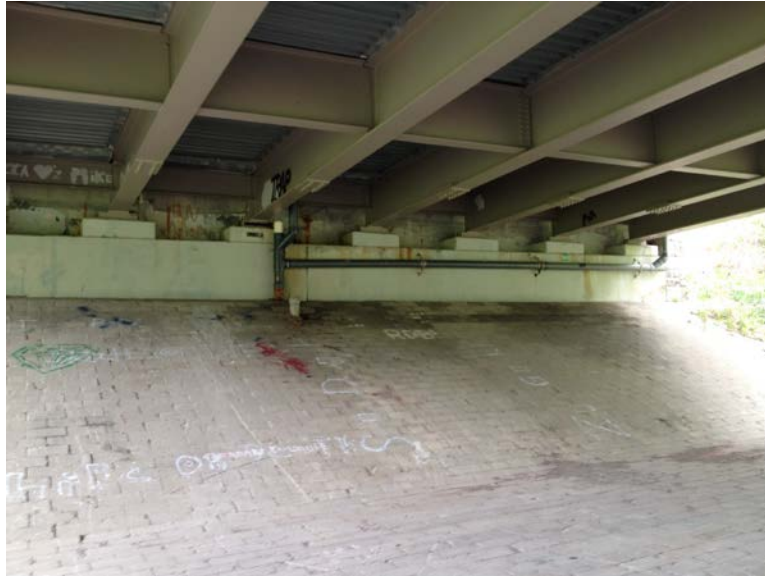
Photo 5: BIN 1039539. View of the underside of the bridge showing the beige/tan paint on the girders, the concrete abutment with masonry coating, and bearing pads.