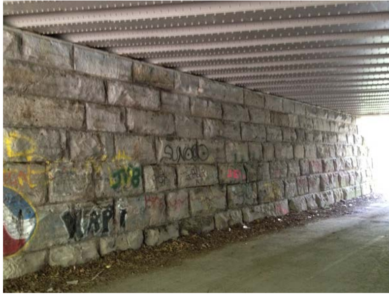
Photo 1: BIN 1068229. View of beige/tan paint on underside of bridge and abutment masonry where pointing is located in between the stones.