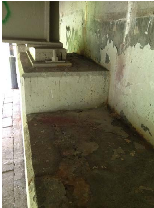
Photo 6: BIN 1039539. View of the concrete abutment, one concrete bearing pad with masonry coating, and a bearing plate with bearing pad.