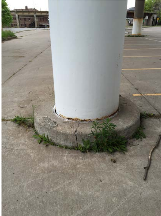
Photo 7: BIN 1039539. View of the caulk located between the base of the pier and the concrete base pad.