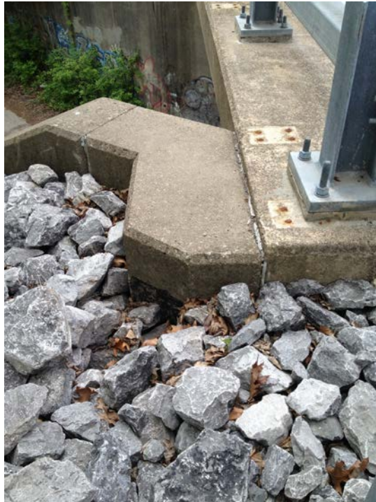
Photo 2: BIN 1068229. View of waterproof coating on wing wall and caulk between abutment and wing wall. In addition, there is joint filler beneath the caulk.