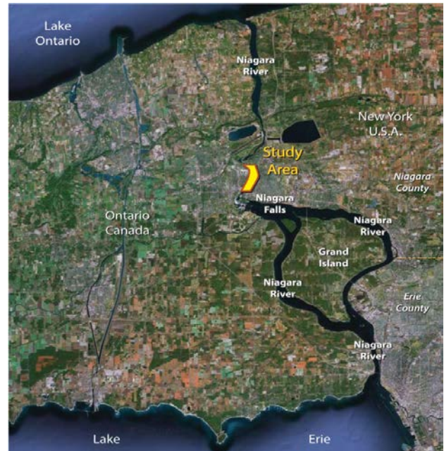
Figure 1-1 - Project Area Map

This Project Study Area includes both the RMP and Third Street / Whirlpool Street as shown in Figure 1-2 . Improvements along these roadways are specifically proposed as part of this Project. It should be noted that the traffic study limits extend beyond the Project Study Area delineated in Figure 1-2 , encompassing several of the major roadways shown on the overall graphic.