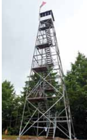
Dickinson Hill Fire Tower

Thanks to an extraordinary volunteer effort by the Fire Tower Committee of the Friends of Grafton Lakes State Park, and assistance from the New York State Police, the historic Dickinson Hill Fire Tower was faithfully restored and reopened to the public as an exciting new hiking destination on the Taconic Ridge. The only one of its kind in Rensselaer County, the 65 foot tower offers panoramic views of the Adirondack and Green Mountains.