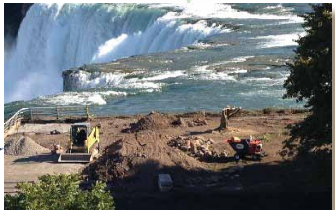
Repairs at Niagara Falls State Park

New York Works funded projects in every region of the state that will enhance the visitor experience and enable our parks to re-emerge after years of decline in capital infrastructure. Highlights of the program include: $25 million for restoration and repairs at Niagara Falls State Park; over $9 million for the rehabilitation of popular athletic facilities, picnic areas and playgrounds at Riverbank and Roberto Clemente State Parks in New York City; over $34 million for infrastructure projects at state parks and historic sites in the Hudson Valley, including $9 million for road and water system repairs at Bear Mountain State Park and over $4 million to restore historic stone work at Mills Man-