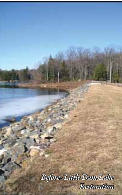
Before- Little Dam Lake Restoration