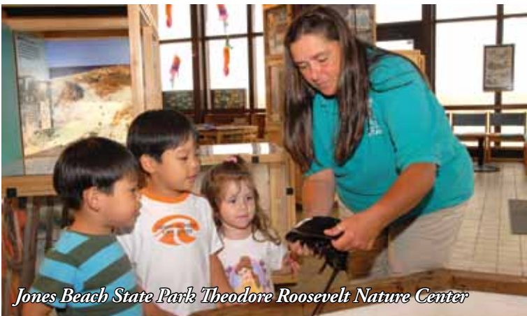
Jones Beach State Park Theodore Roosevelt Nature Center