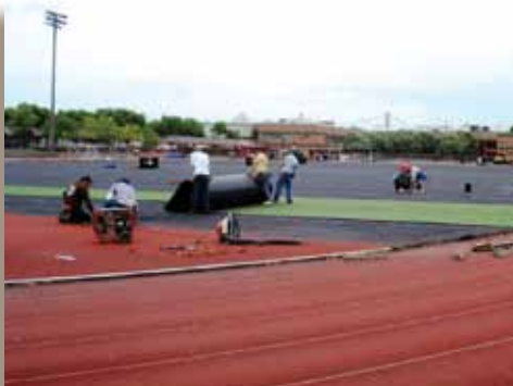
Work on the Riverbank State Park athletic field.

to rehabilitate state parks. Leveraged with other funds, a total of $143 million was invested in state parks capital projects in 2012, the single largest infusion