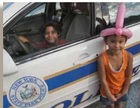
“National Night Out Against Crime”

In August, Park Police hosted a “National Night Out Against Crime” event at Riverbank State Park with various