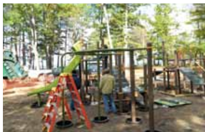
Verona Beach State Park

Playgrounds: New York Works funded two new playgrounds to replace outdated playground equipment at Verona Beach State Park and Clark Reservation State Park. Verona Beach, located along the eastern shore of Oneida Lake, has adopted a nautical theme with an abstract ship wreck design. An accessible picnic and patio area for informal game play and