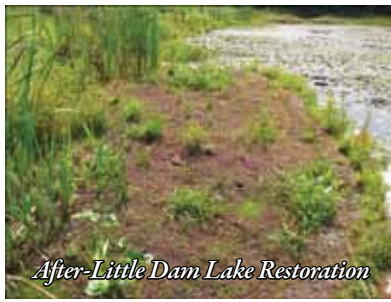
After- Little Dam Lake Restoration