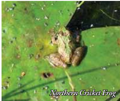
Northern Cricket Frog