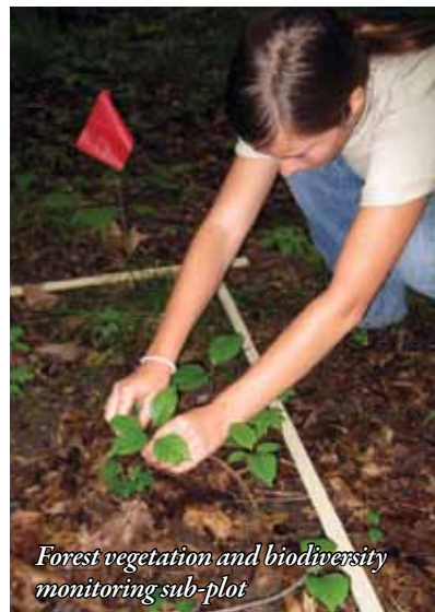
Forest vegetation and biodiversity monitoring sub-plot