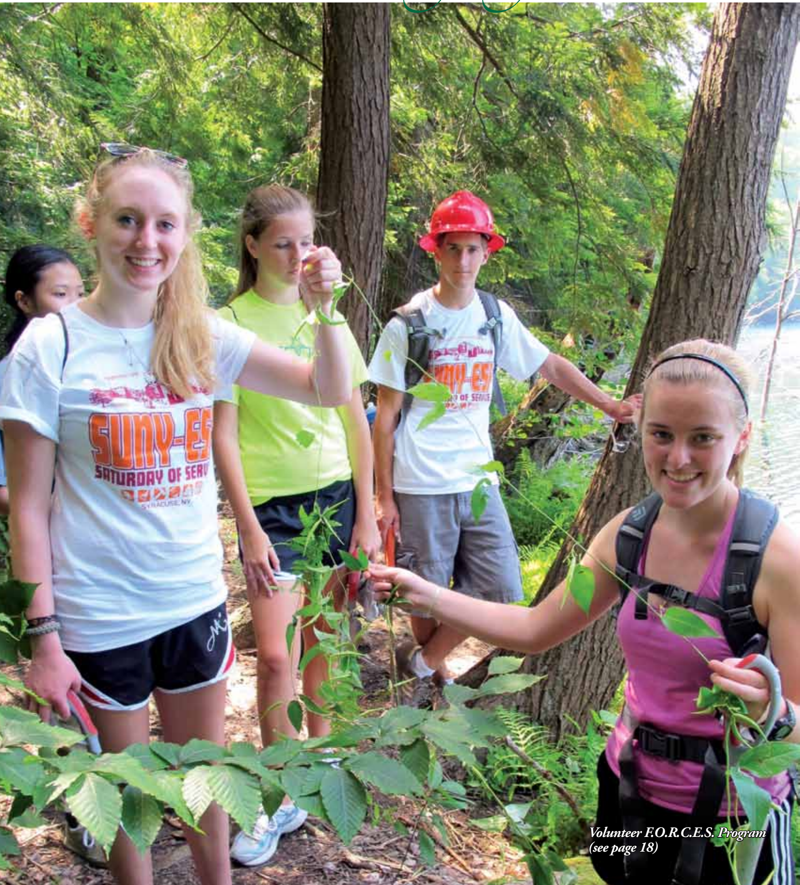
Volunteer F.O.R.C.E.S. Program (see page 18)