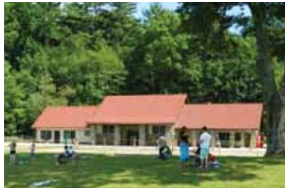
Beach Bathhouse complex

Chenango Valley State Park: Land and Water Conservation Fund and the State Park Infrastructure Fund provided funds for the rehabilitation of the Beach Bathhouse complex. This new building, valued at $1.4 million, provides space for patron restrooms, lifeguard/first aid services and a concession area. Water and energy efficient fixtures and appliances were added to the complex, which features a smaller, well-organized building layout and reduced paved surfaces. The building and beach area are now fully accessible and ADA compliant.