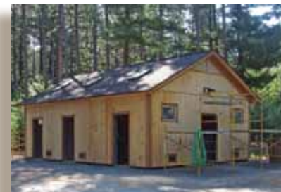
New comfort station

Higley Flow State Park: This popular camping park in St. Lawrence County is seeing the convergence of three exciting construction projects in 2012-2013. First, a new comfort