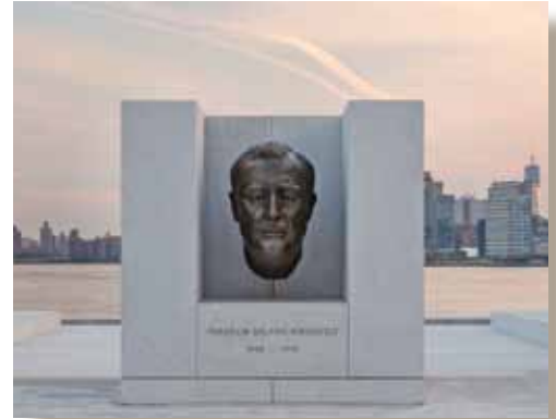
Franklin D. Roosevelt Four Freedoms State Park

speech delivered by President Roosevelt, in which he described his vision for a world founded on four essential human freedoms: