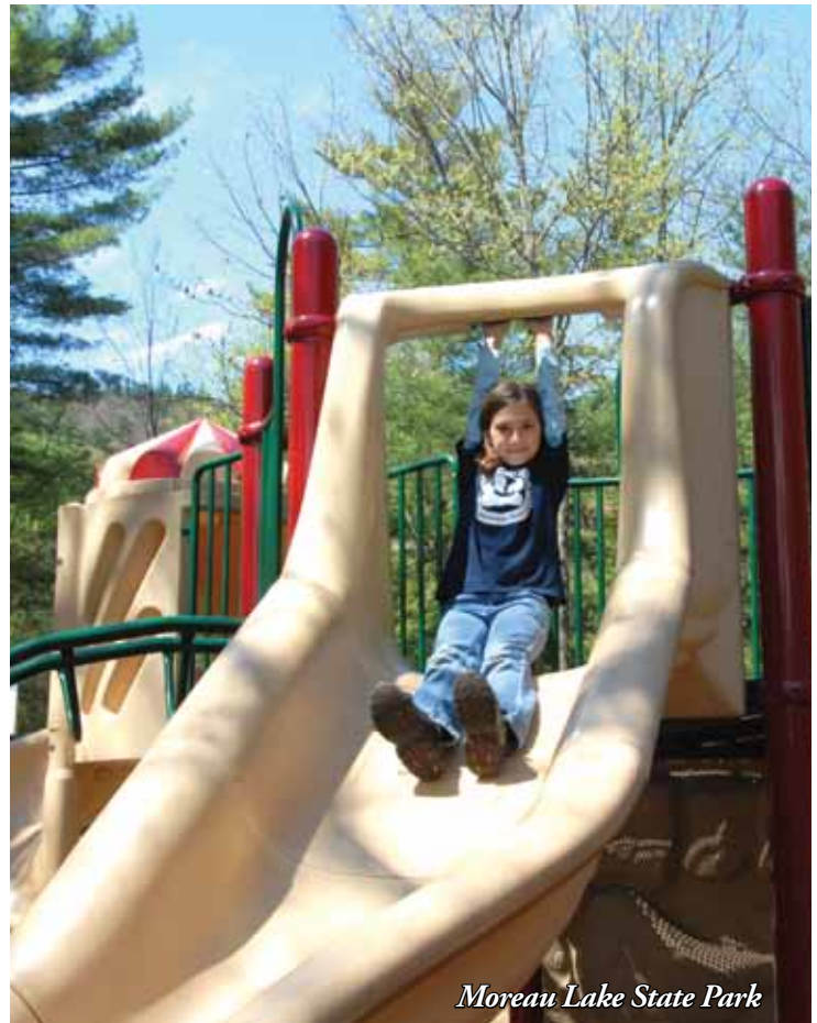
Moreau Lake State Park