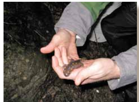
J.B. Thacher State Park Mole Salamander Habitat Enhancement

In 2012, State Parks regional biologists and environmental staff completed more natural resource stewardship projects. These projects