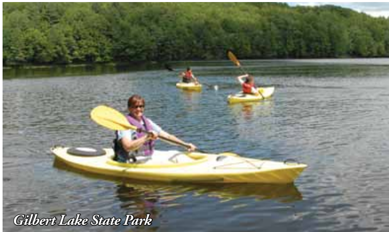
Gilbert Lake State Park