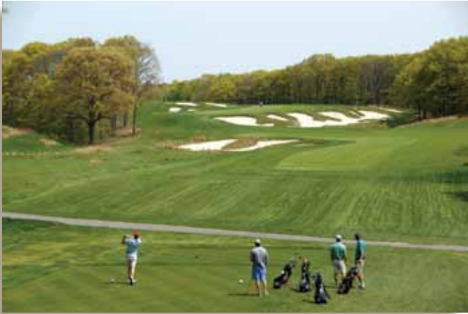
Bethpage State Park, Black Course

the park, but attracted millions of television viewers and world-wide attention to Niagara Falls State Park. And, once again, the world's best golfers played on the Bethpage Black course during the Barclays golf tournament which brought thousands of fans to the famed park during a week of play in August.