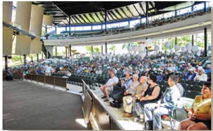
Saratoga Performing Arts Center , Saratoga Spa State Park

period in 2011. Revenue was up 6.3 percent year to date. The revenue trend must continue to support our operating needs.