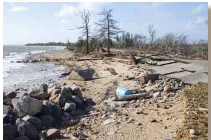
Orient Beach State Park