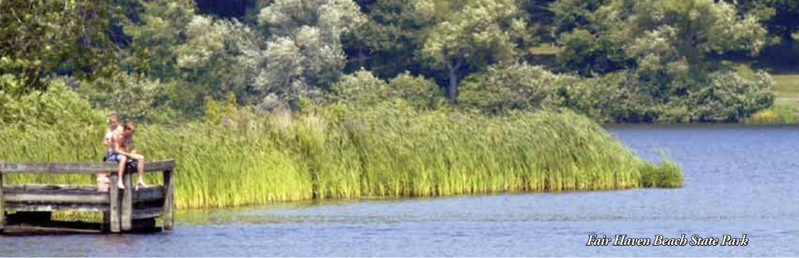
Fair Haven Beach State Park