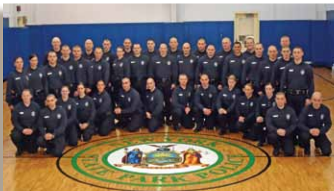
New York State Park Police Academy Recruits

The most positive event of 2012 was the commencement of the first Basic School for newly hired police officers