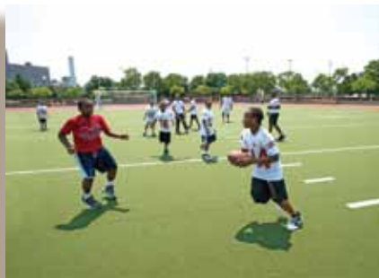
Riverbank State Park

Riverbank State Park: On June 29th, the park’s main athletic field was reopened. New York Works funds of $1,500,000 replaced the worn and torn artificial turf with a new surface and support base while clearing the field and