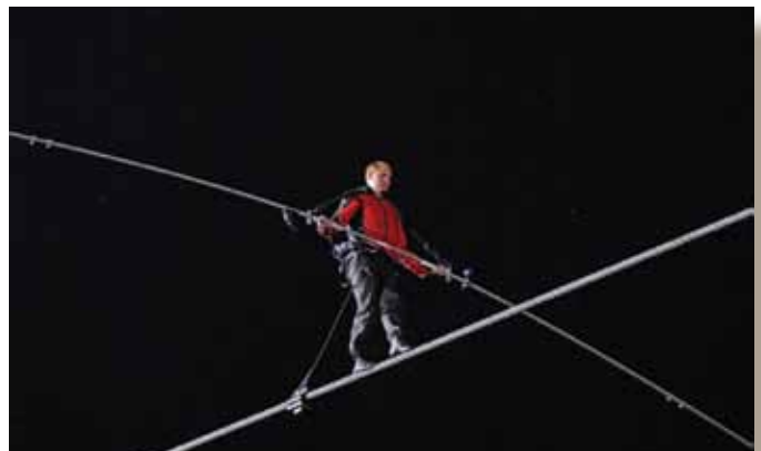
Nik Wallenda’s tight rope walk across Niagara Falls

State Parks hosted several major events that drew millions of visitors, including a string of sold out concerts at the Jones Beach Theater, Saratoga Performing Arts Center and Artpark. Nik Wallenda’s tight rope walk across Niagara Falls not only brought thousands of visitors to