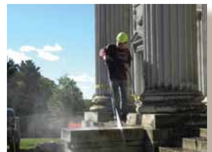
Work being done on the Portico of the Mills Mansion

need of structural and aesthetic rehabilitation. Funding for the projects was provided by Governor Cuomo's New