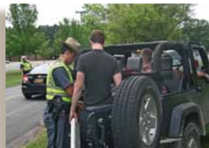
Saratoga Performing Arts Center (SPAC)

Performing Arts Center (SPAC) and Artpark. The concert season was very active as many major acts were touring. The popular jam band Phish