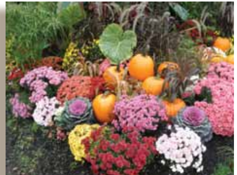
Saratoga Spa State Park

ty to the Region's facilities. Member businesses of New York Flower Power Inc. are donating flowers and plants to nearby state parks and historic sites. Through the partnership, parks receive a welcome addition of colorful gardens and floral displays to greet the public, while patrons learn about the stunning local options for home gardens. The partnership has yielded eye-popping results at the entrances