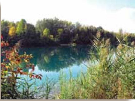
View from trail at Green Lakes State Park

a federal Recreation Trails Program and an EPF stateside match is $300,000.