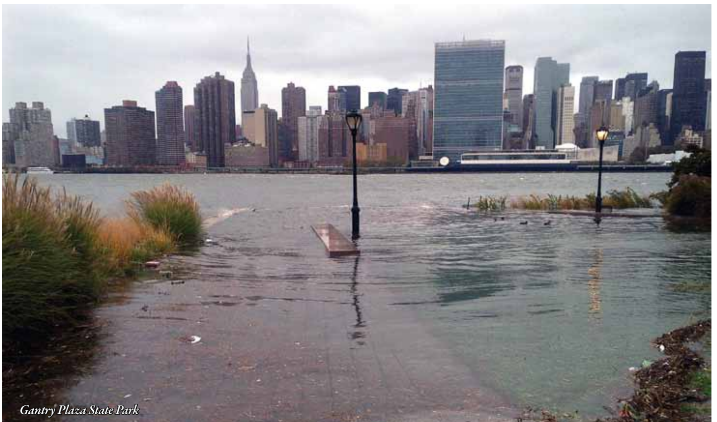
Gantry Plaza State Park