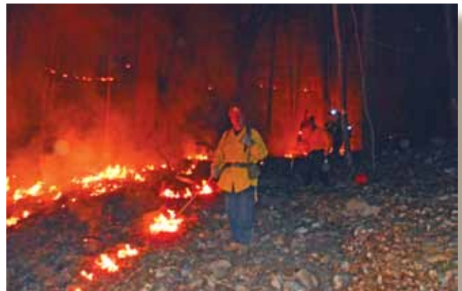
Anthony Wayne Recreation Area (Palisades)

days by state park forest rangers, state park staff, local firefighters and DEC forest rangers and staff. The fire burned more than 480 acres before it was brought under control.