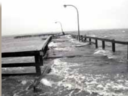
Flooding at Jones Beach State Park

Hurricane (Super Storm) Sandy: Beginning Monday, October 29, 2012 the Long Island Region began to notice the effects of impending storm, Hurricane Sandy. Although Sandy was downgraded to a tropical storm, when combined with two other weather systems affecting the Northeast at the time, she caused significant damage to Long Island State Parks. Sandy's strong winds and rain blanketed the island during high-tide. She left behind significant flooding from the ocean and bay waters which caused a significant amount of damage to state parks on Long Island. All parks were closed due to fallen trees, hanging electrical wires, massive flooding, and loss of electrical power, and heat. To date several parks are still closed and will remain closed until they are safe to reopen. Major damage includes the