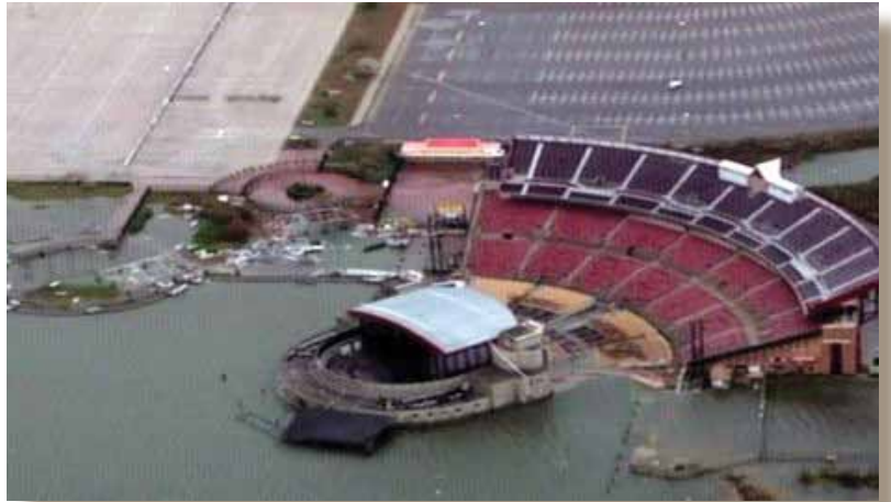
Jones Beach Theater, Jones Beach State Park

Rebuilding and restoring the most affected state parks will take significant time and resources. Clean up and repair efforts are underway, with the goal of enabling efforts to allow all parks to reopen by Memorial Day. Fortunately, a significant portion of the repair costs will be eligible for funding from the Federal Emergency Management Agency (FEMA).