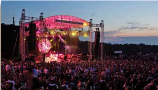
Artpark State Park

Earl W. Brydges Artpark: Renovations to Artpark's outdoor amphitheater were completed as patrons enjoyed outdoor concerts all summer long. Improved patron access into the seating area, new service areas for concessions, a new restroom building, a reformed bowl area for