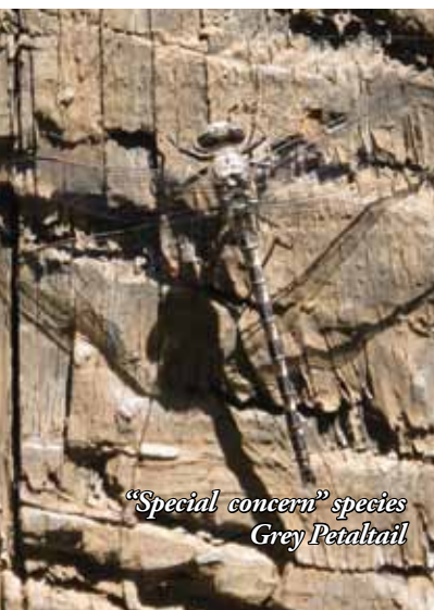
"Special concern" species Grey Petaltail