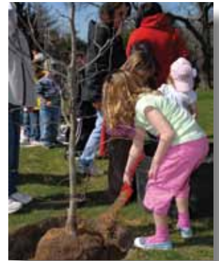
Bayard Cutting Arboretum

Arboretum: A major event for the region was the establishment of the first and only community sponsored agriculture (CSA) farm in a New York state park at Bayard Cutting Arboretum. The CSA provided 24 weeks of fresh, organically grown vegetables to 50 families.