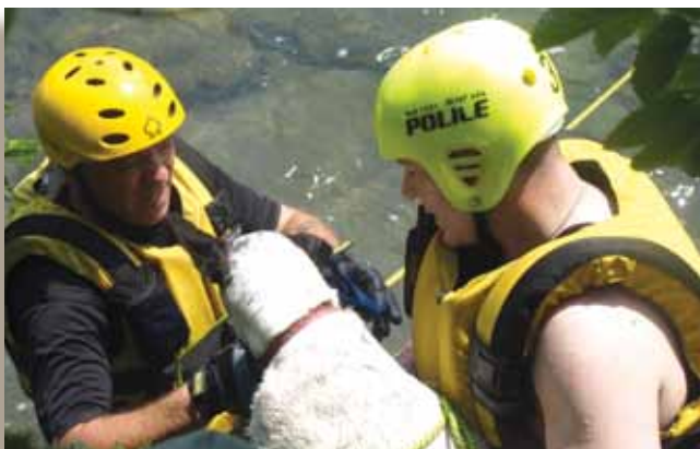
Niagara Falls State Park

the subject of great joy for the family and received much media attention. In January, officers observed a suicidal subject approaching the falls and with the assistance of other members were able to talk the subject back from the brink.