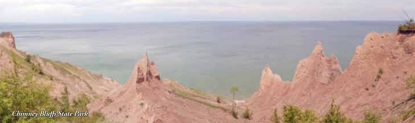
Chimney Bluffs State Park