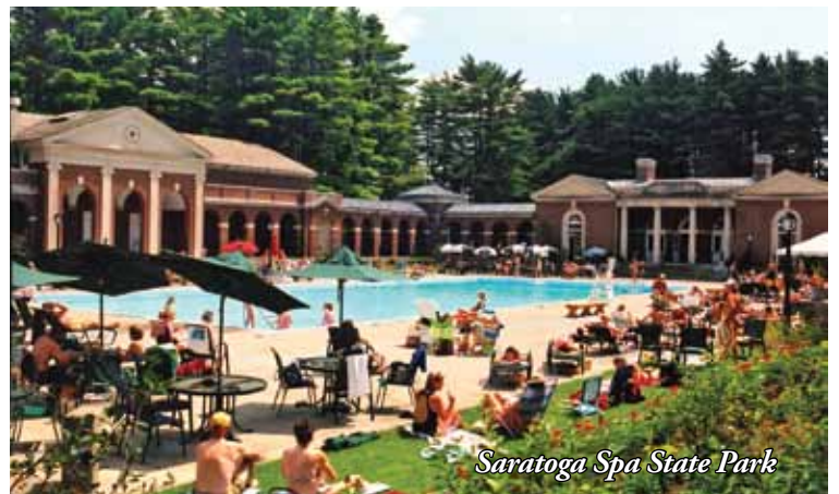
Saratoga Spa State Park