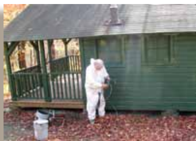
Group Camp 5

Quaker Area: Completions are being made to the family Group Camp 5 located in the Quaker Area. Final touches are being made to the 18 sleeping units, new washhouse and