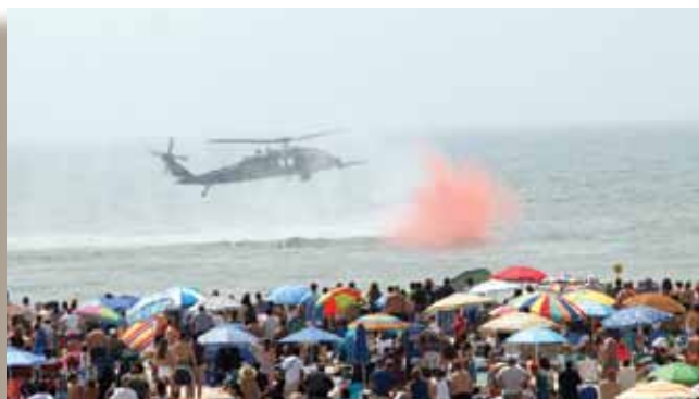
The Jones Beach Air Show

Navy's Blue Angels. The Jones Beach Air Show is one of the leading air shows in the world and attracts hundreds of thousands of spectators each year.