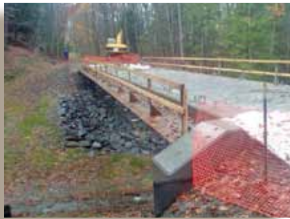
Black Diamond Trail

Black Diamond Trail: New York Works funded two bridges on the Black Diamond Trail (BDT). The BDT is a planned trail that connects four state parks: