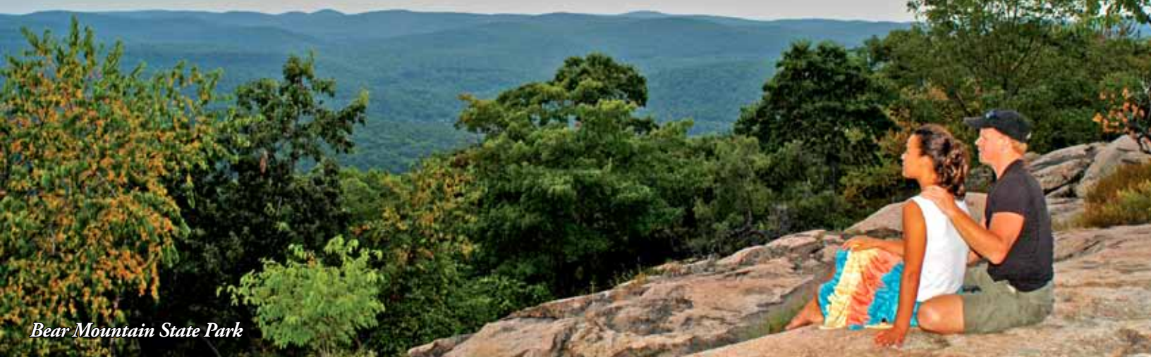
Bear Mountain State Park