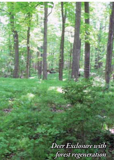
Deer Exclosure with forest regeneration