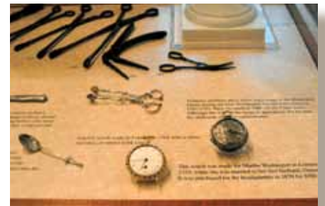
Artifacts at Washington Headquarters

cosm of collecting in America, from the birth of the nation to the present, from things used in battle to things used in homes, from souvenirs of travel and