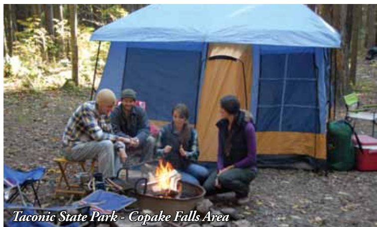
Taconic State Park - Copake Falls Area