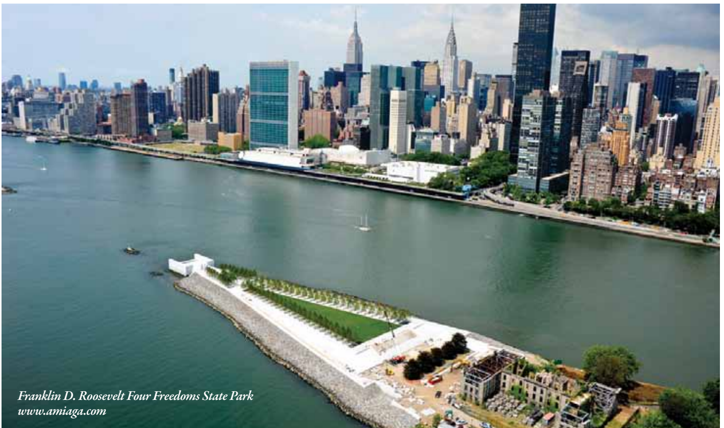
Franklin D. Roosevelt Four Freedoms State Park

Further budget reductions would result in reduced operations and maintenance efforts, negatively impacting the experiences of the park system's 60 million visitors. The State Council of Parks opposes further reductions to the agency's operating budget in fiscal year 2013-14.