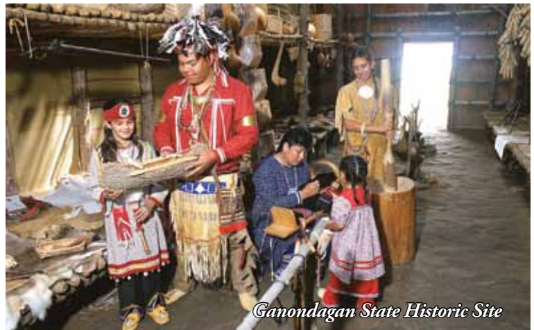
Ganondagan State Historic Site

The State Council will continue to assist the agency in implementing a marketing plan to create a strong brand for our parks and historic sites. We also support the message of “this parkland is your parkland” to promote stewardship and responsibility among our park visitors and partners.