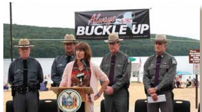
Buckle Up NY event at Lake Welch State Park

to provide an extraordinary public safety detail for Nik Wallenda's high wire crossing over Niagara Falls from New York to Canada.