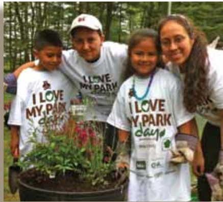
Franklin D. Roosevelt State Park