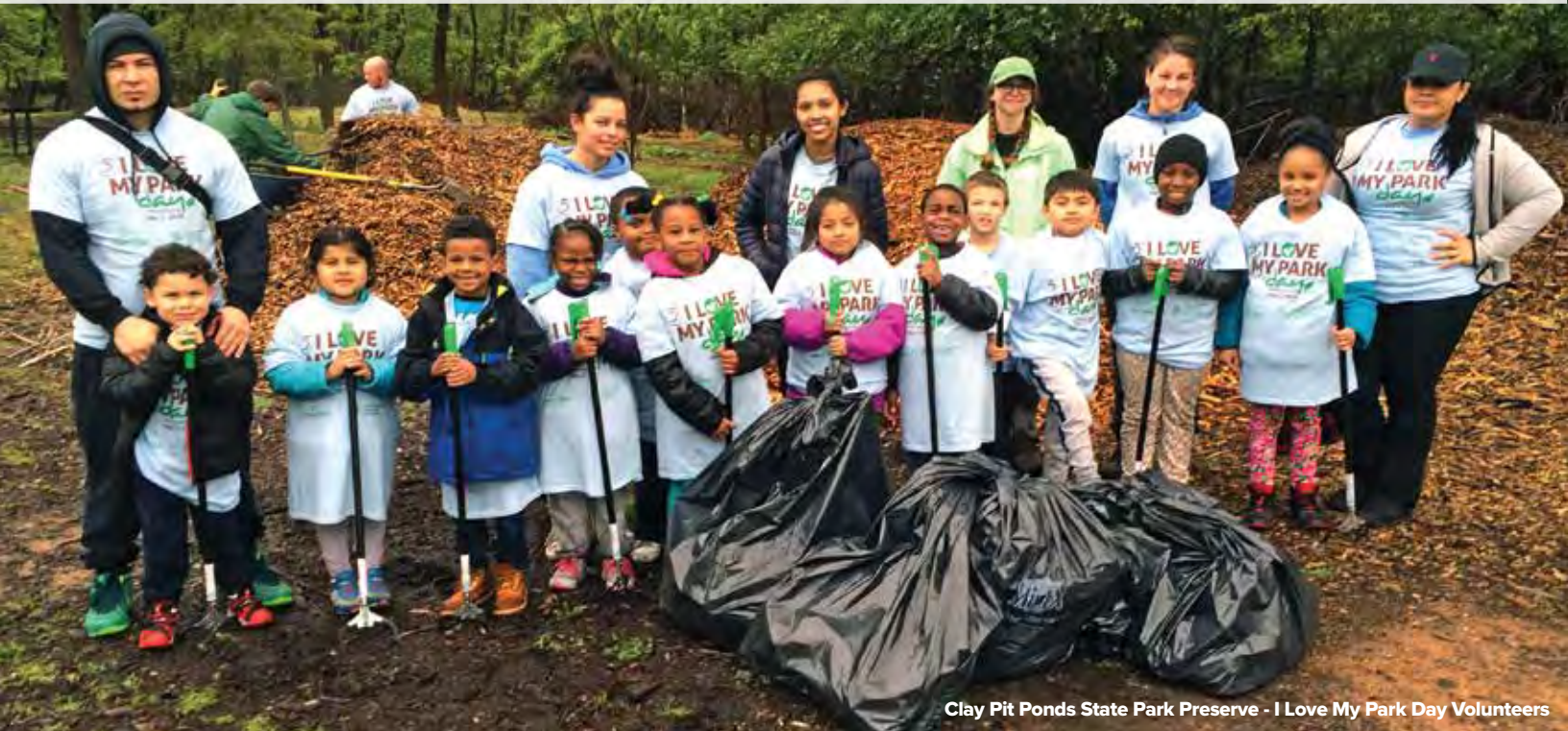
Clay Pit Ponds State Park Preserve - I Love My Park Day Volunteers