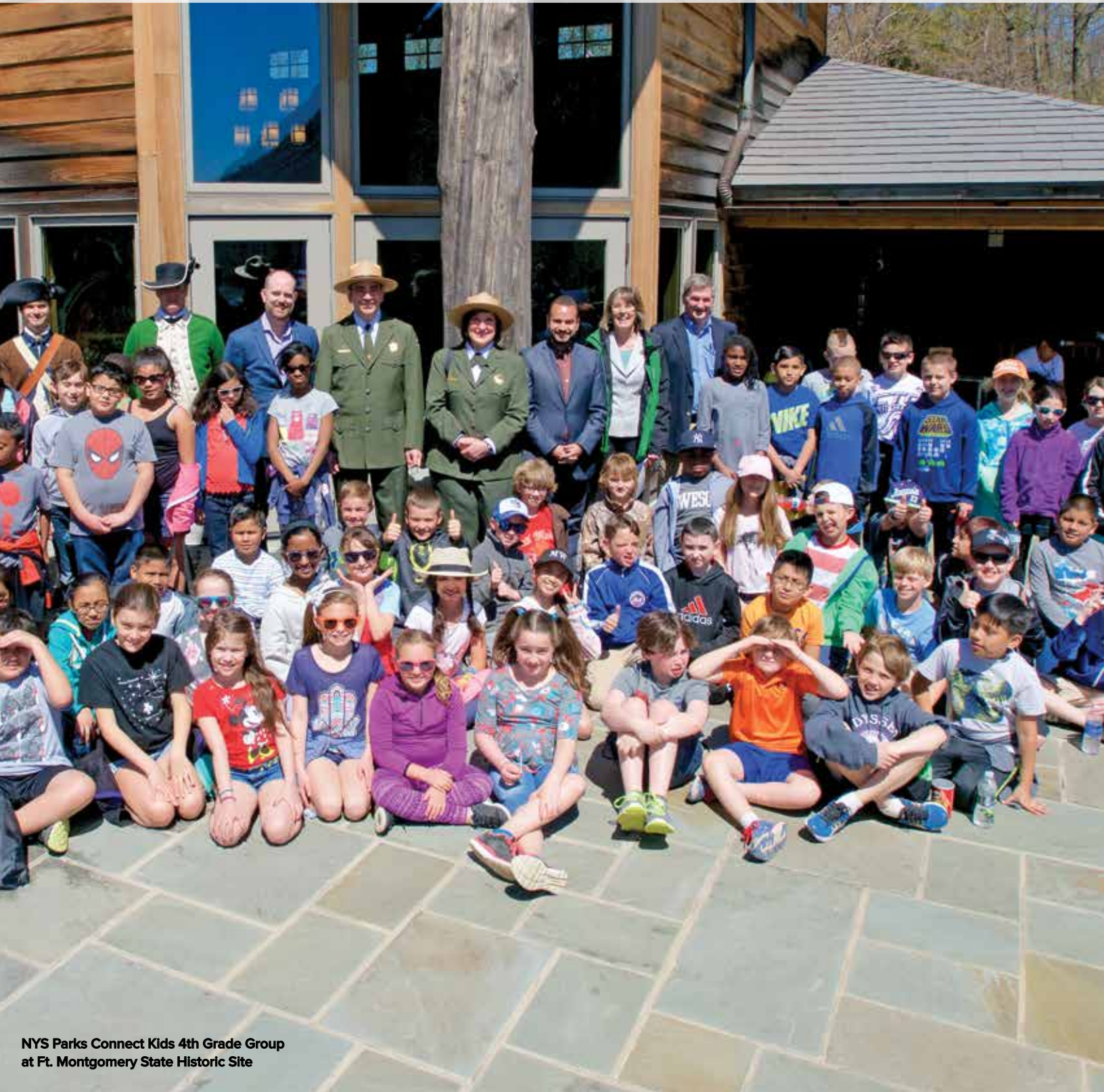
NYS Parks Connect Kids 4th Grade Group at Ft. Montgomery State Historic Site

New York State Council of Parks, Recreation & Historic Preservation