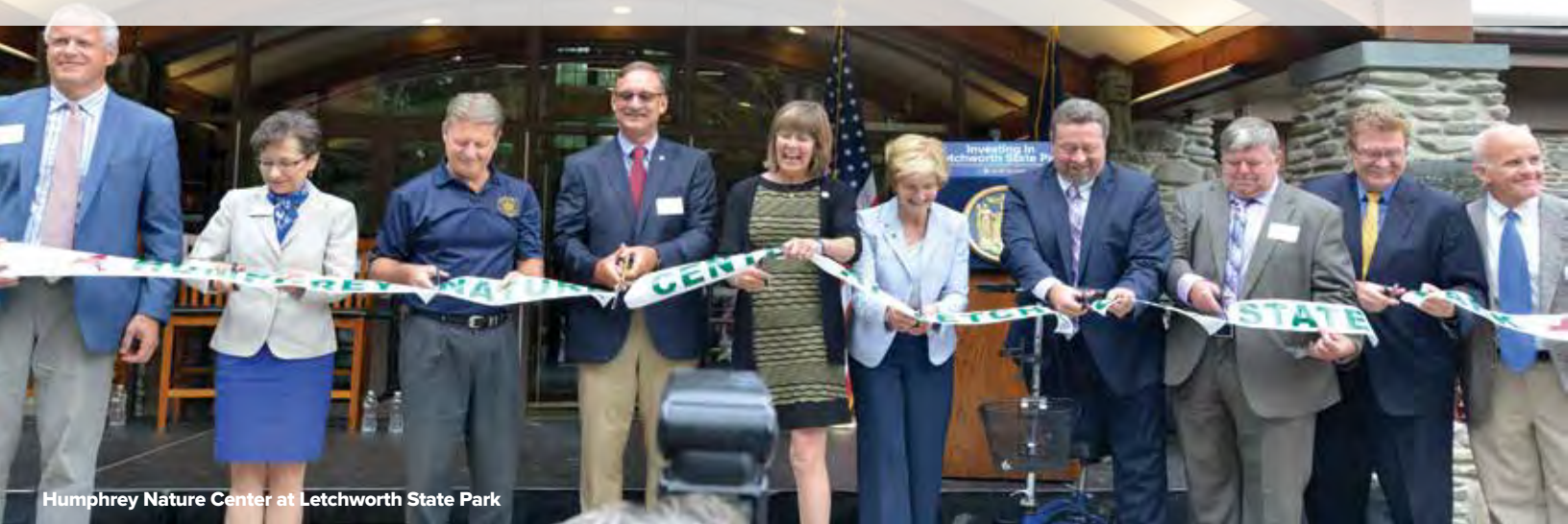
Humphrey Nature Center at Letchworth State Park