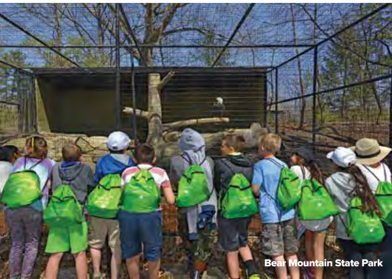
Bear Mountain State Park