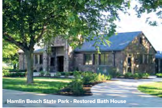
Hamlin Beach State Park - Restored Bath House