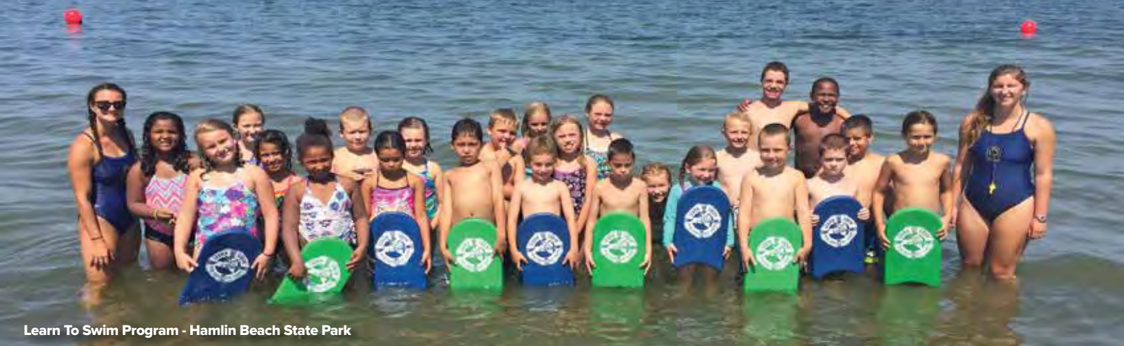
Learn To Swim Program - Hamlin Beach State Park