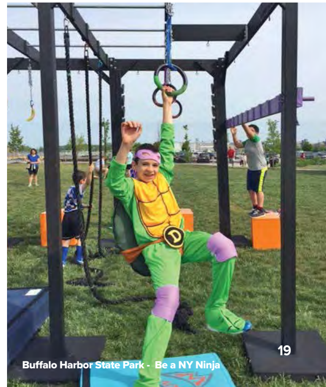
Buffalo Harbor State Park - Be a NY Ninja