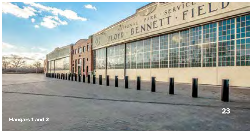
Hangars 1 and 2