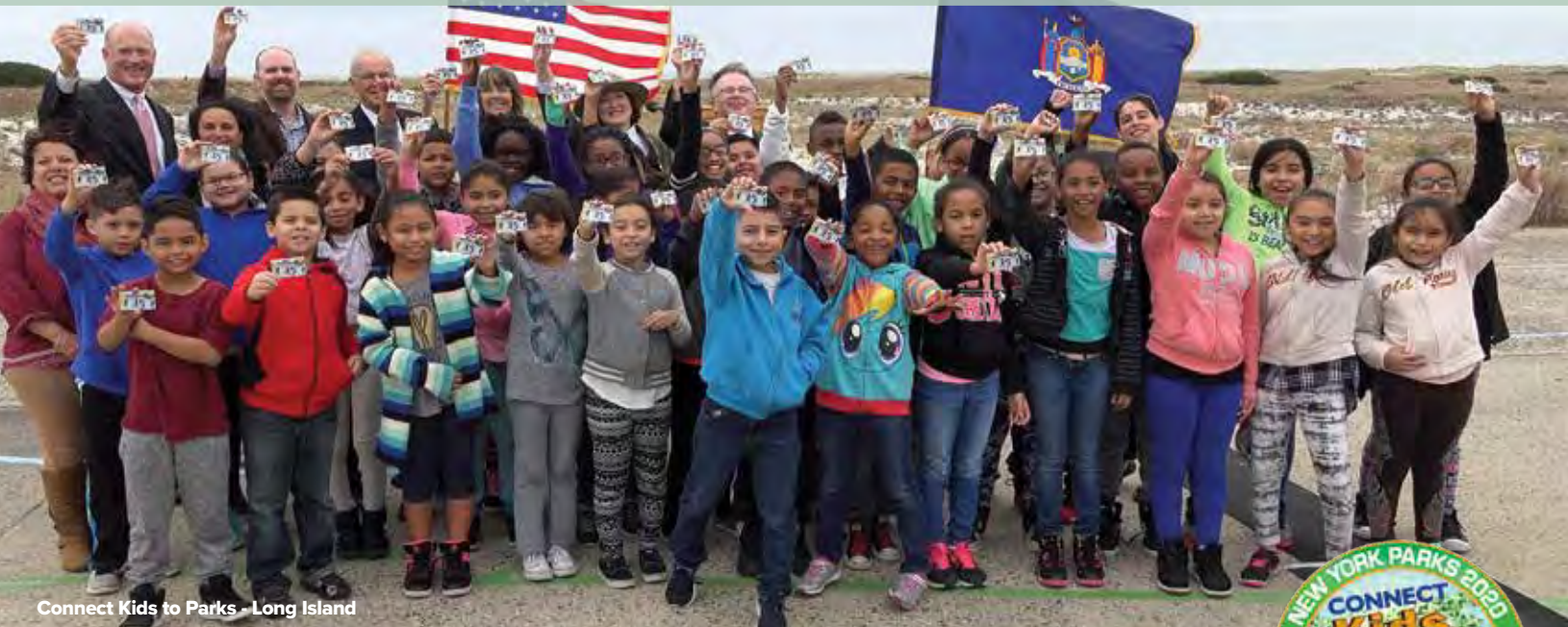
Connect Kids to Parks - Long Island