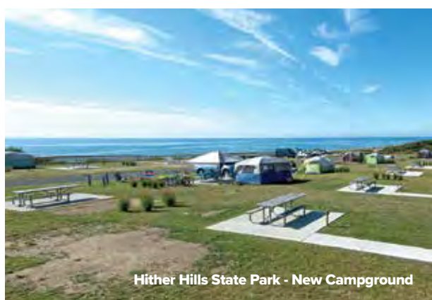
Hither Hills State Park - New Campground