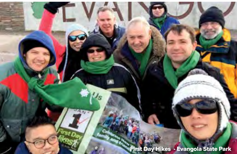
First Day Hikes - Evangola State Park