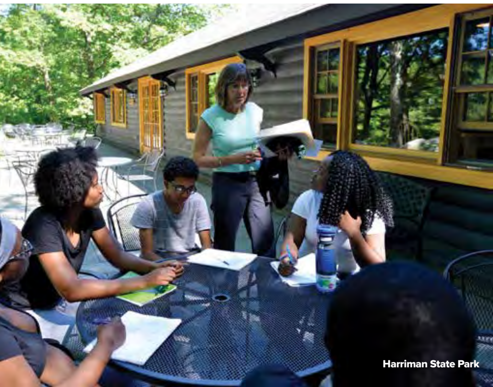
Harriman State Park

Niagara Falls State Park hosted a visit from Governor Cuomo who inspected the restoration work that has been underway. He heralded the improvements as transformative not only for the park but for tourism in the region. Much of the capital work in the park should conclude by the end of 2017. Niagara Falls State Park was also launched as a Taste NY site with New York State produced and inspired items featured at retail locations and the Top of the Falls Restaurant. At Buffalo Harbor State Park the pedestrian walkway on the break wall opened in the fall and will surely be a new hot spot come this summer in Buffalo. Buffalo Harbor also hosted a very successful Be a NY Ninja event in partnership with the Governor's Film