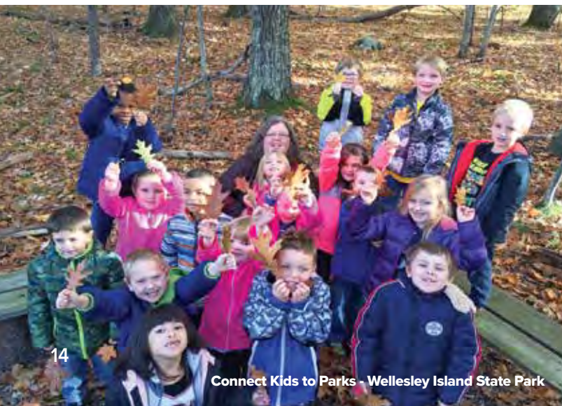
Connect Kids to Parks - Wellesley Island State Park

In 2016, New York State launched the “Connect Kids to Parks” program to enhance educational and recreational opportunities for schoolchildren and help promote parks and historic places in every corner of the state. As part of the effort, New York partnered with the National Park Service to extend free State Park day-use entry to all fourth-grade students and their families as well as created a grant program to help transport schoolchildren from underserved communities to outdoor recreation and environmental education programs in state parks and historic sites.