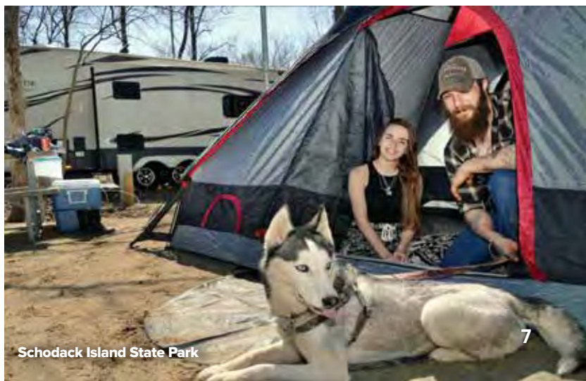
Schodack Island State Park