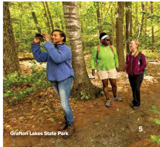
Grafton Lakes State Park