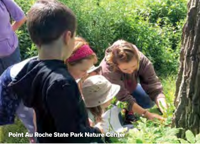
Point Au Roche State Park Nature Center