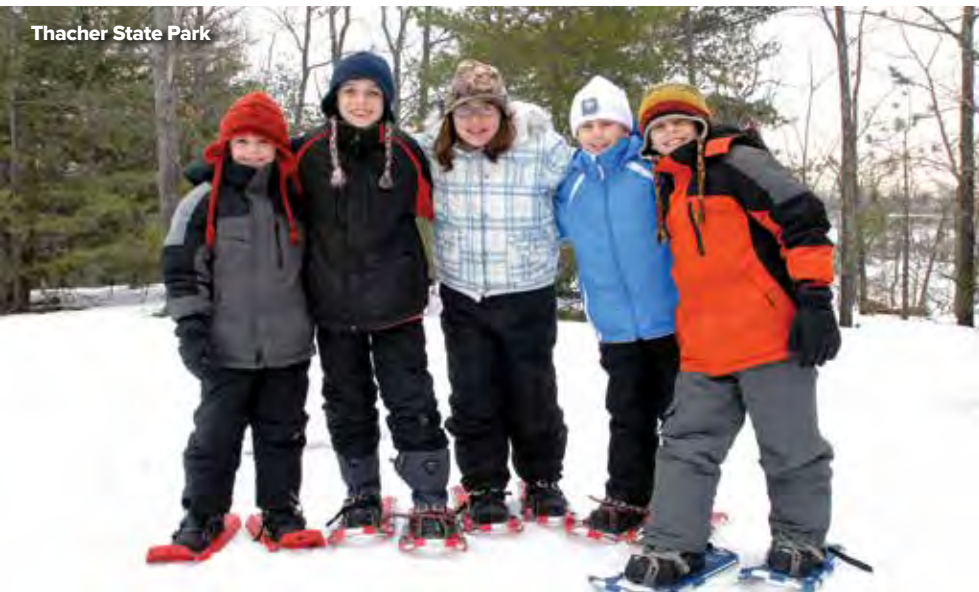
Thacher State Park