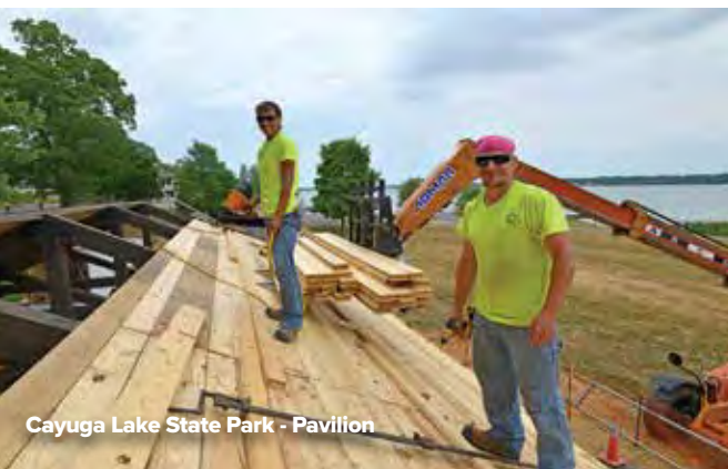
Cayuga Lake State Park - Pavilion