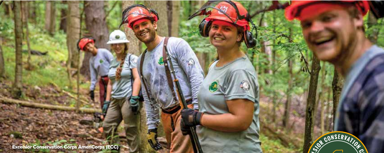
Excelsior Conservation Corps AmeriCorps (ECC)