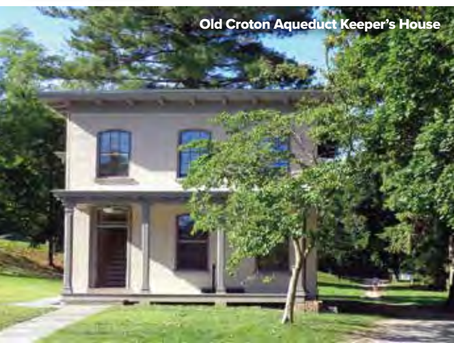
Old Croton Aqueduct Keeper's House