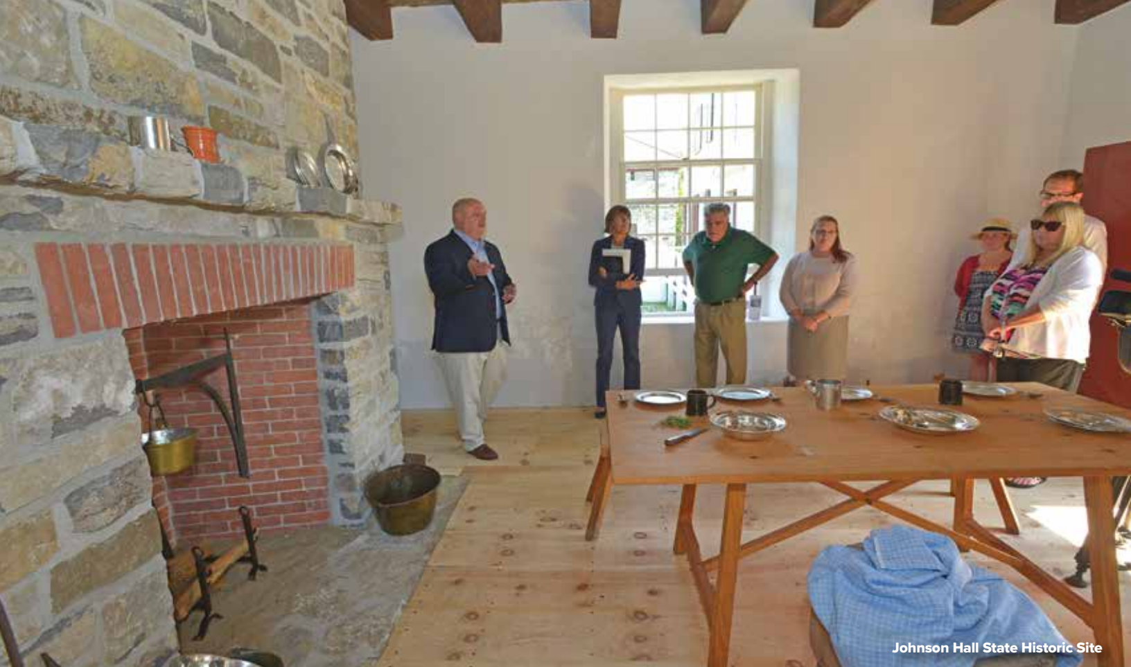
Johnson Hall State Historic Site

Office where hundreds of community kids came out for a day of physical activity and games in the park Niagara Reional Commission Members attended the launch of the enhanced lighting of Niagara Falls on December 1. And, the Commission graciously hosted an Employee Appreciation picnic for all regional employees which was greatly appreciated and enjoyed by all.