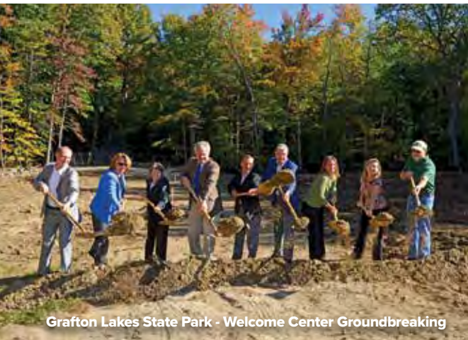
Grafton Lakes State Park - Welcome Center Groundbreaking