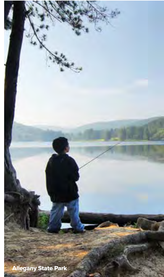
Allegany State Park