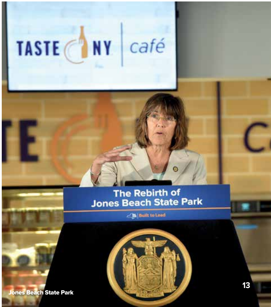
Jones Beach State Park