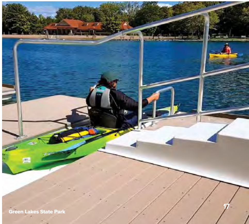
Green Lakes State Park

The Finger Lakes Region managed to endure record droughts in 2016 which had a significant impact on the waterfall experience the region is known for. Record numbers came to our facilities to enjoy swimming, hiking and camping. In late fall, the region hosted local trail supporters who were