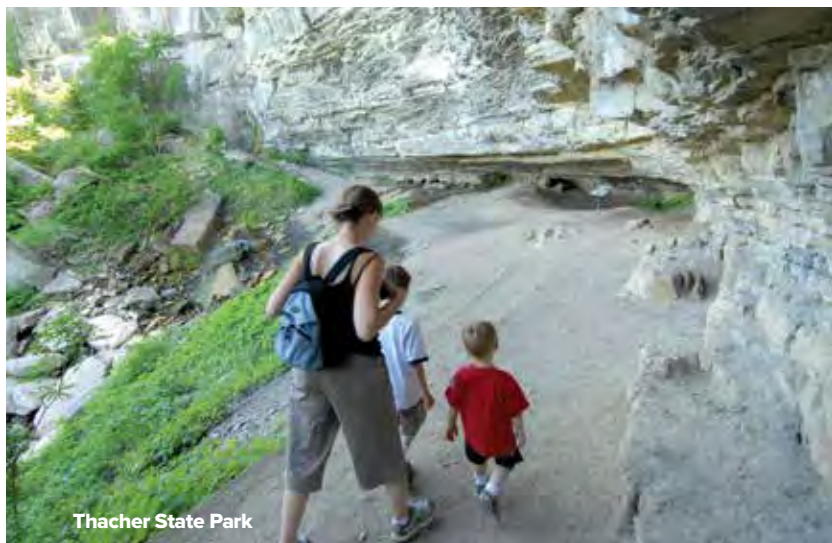
Thacher State Park