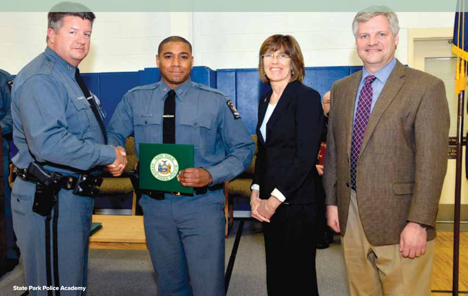
State Park Police Academy