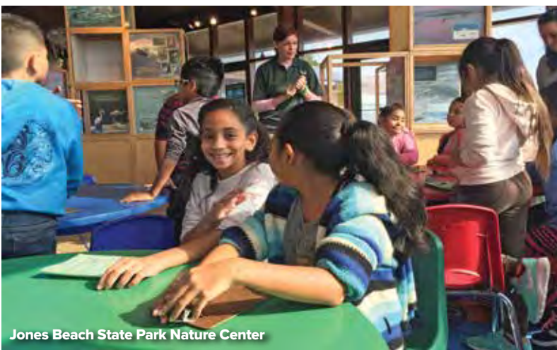
Jones Beach State Park Nature Center

The term "State park system" as used in this report refers to New York's 250 state parks, historic sites, recreational trails and boat launch sites.