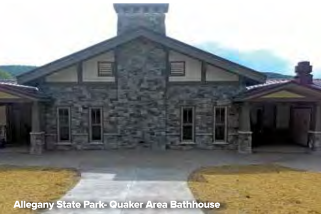
Allegany State Park- Quaker Area Bathhouse