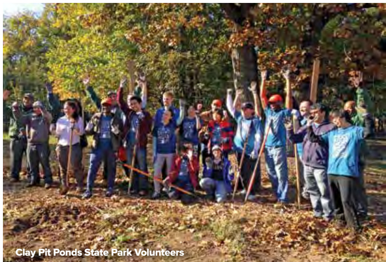
Clay Pit Ponds State Park Volunteers

awarded 20 grants to friends groups across the state that have resulted in projects like the installation of new interpretive kiosks and panels along popular areas of several parks; upgrading digital technology at historic sites and capital improvements that improve or expand park amenities.