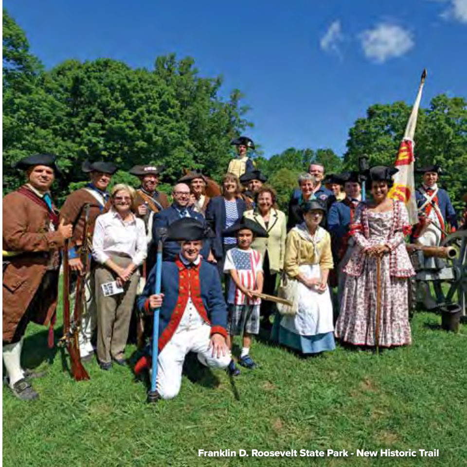
Franklin D. Roosevelt State Park - New Historic Trail

of the battle and positions of the troops. In early 2017, the new visitors center at Thacher State Park will open. A private fundraising campaign led by the regional commission and the Open Space Institute has raised more than $750,000 toward the facility that will serve as a gateway to the popular park. Construction on new visitor facilities at Grafton Lakes and Saratoga Spa State Park also began in 2016.