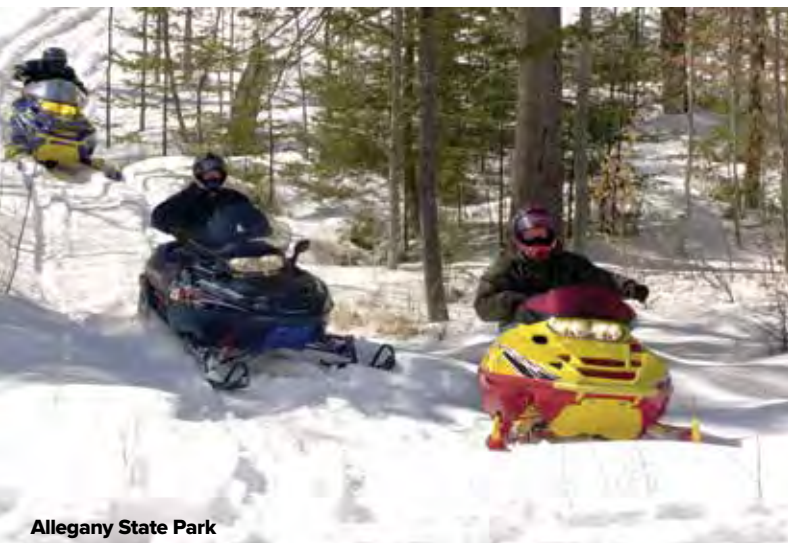
Allegany State Park