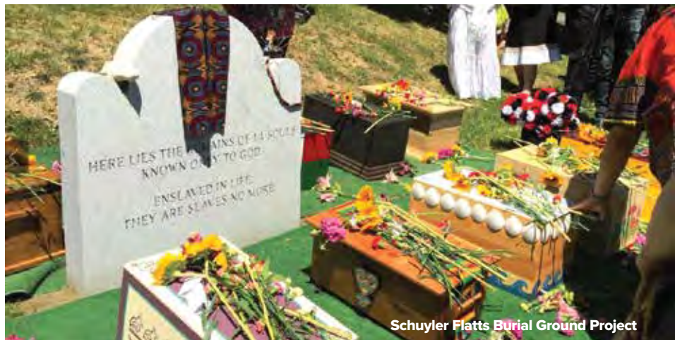
Schuyler Flatts Burial Ground Project