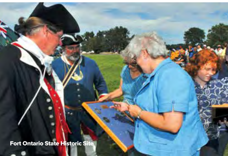
Fort Ontario State Historic Site