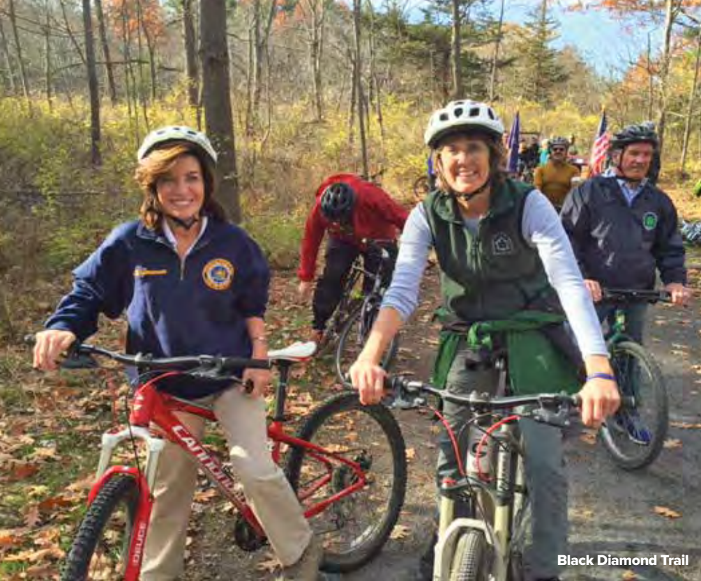
Black Diamond Trail