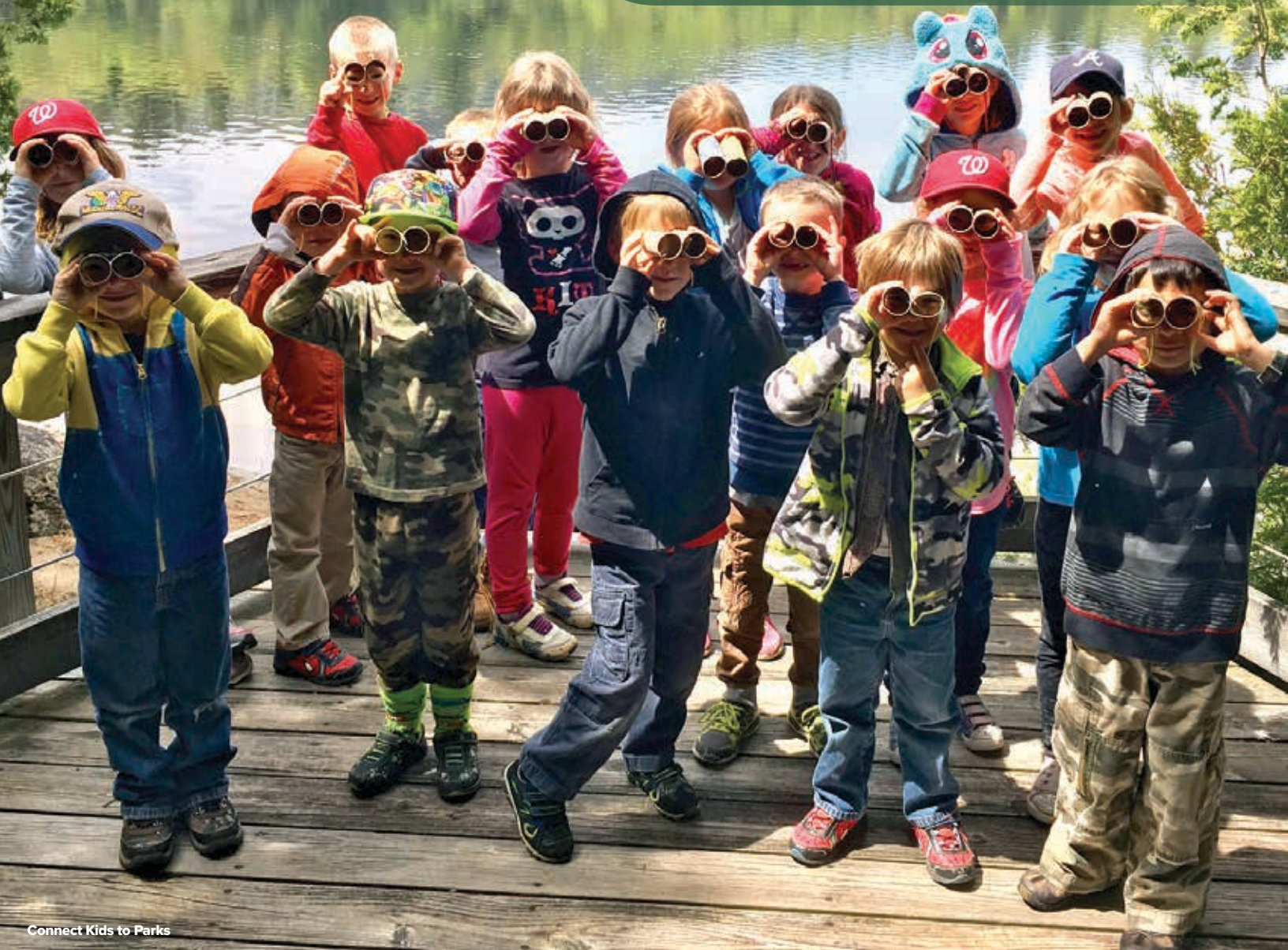
Connect Kids to Parks