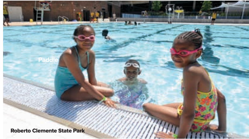
Roberto Clemente State Park

Niagara Falls State Park is greater than that of Grand Canyon and Yosemite National Parks combined, and more than twice as many people visit Jones Beach each year than visit Yellowstone. Niagara Falls is the oldest state park in the nation and Washington's Headquarters is the first property acquired with public funds for the express purpose of historic preservation and patriotic visitation.