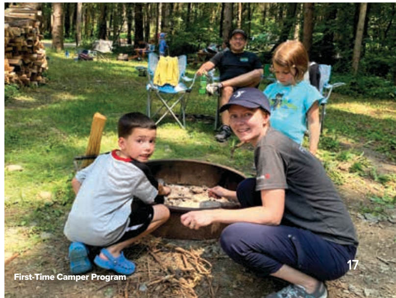
First-Time Camper Program