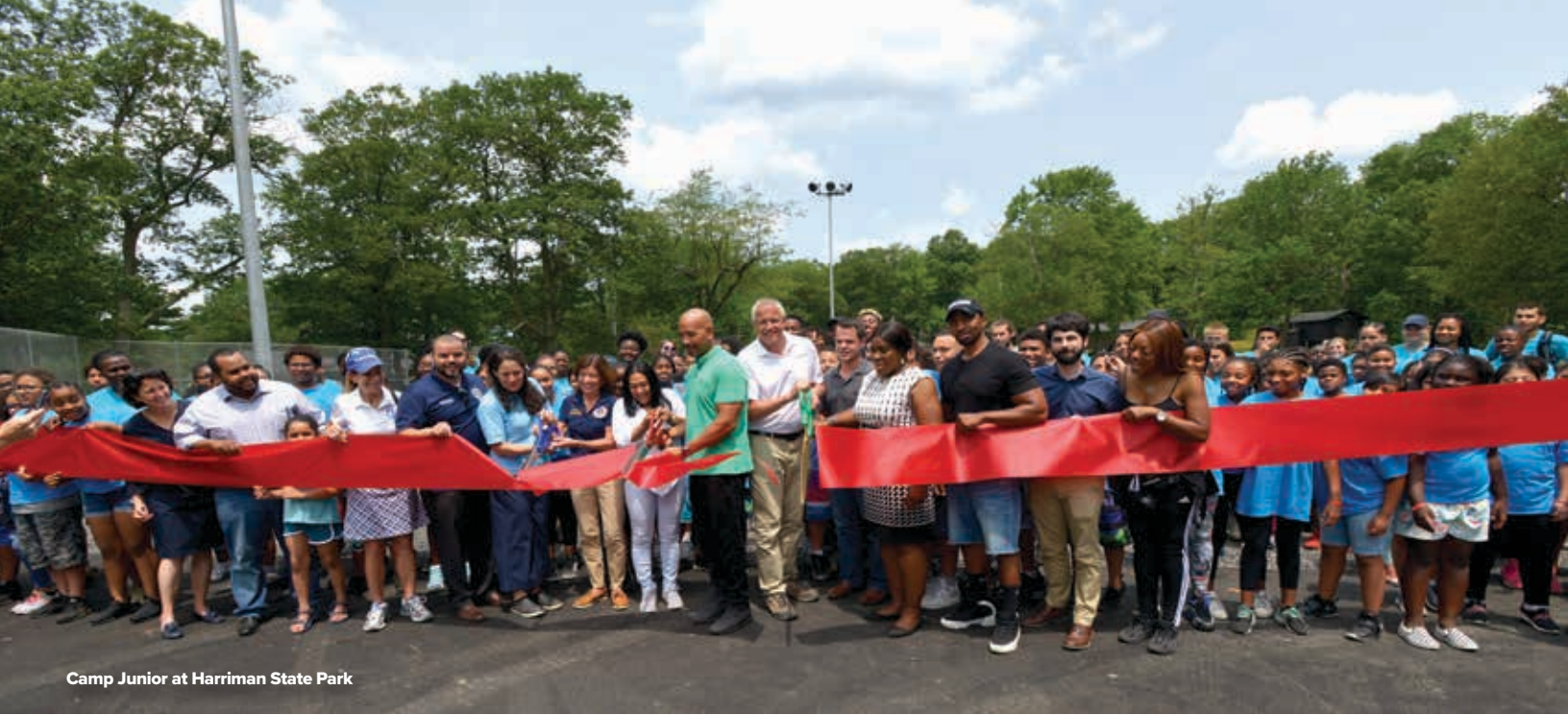
Camp Junior at Harriman State Park