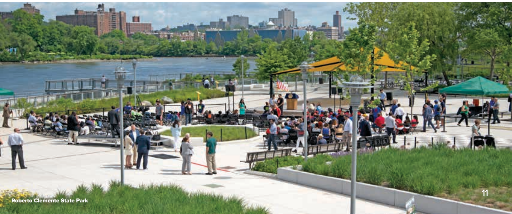
Roberto Clemente State Park