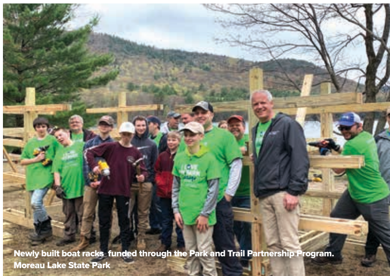
Newly built boat racks funded through the Park and Trail Partnership Program. Moreau Lake State Park

tions received $450,000 in 2019 to advance their work to raise private funds for capital projects; perform maintenance tasks; provide educational programming; and promote public use through hosting special events. Grants will be matched by over $200,000 in private and local funding.