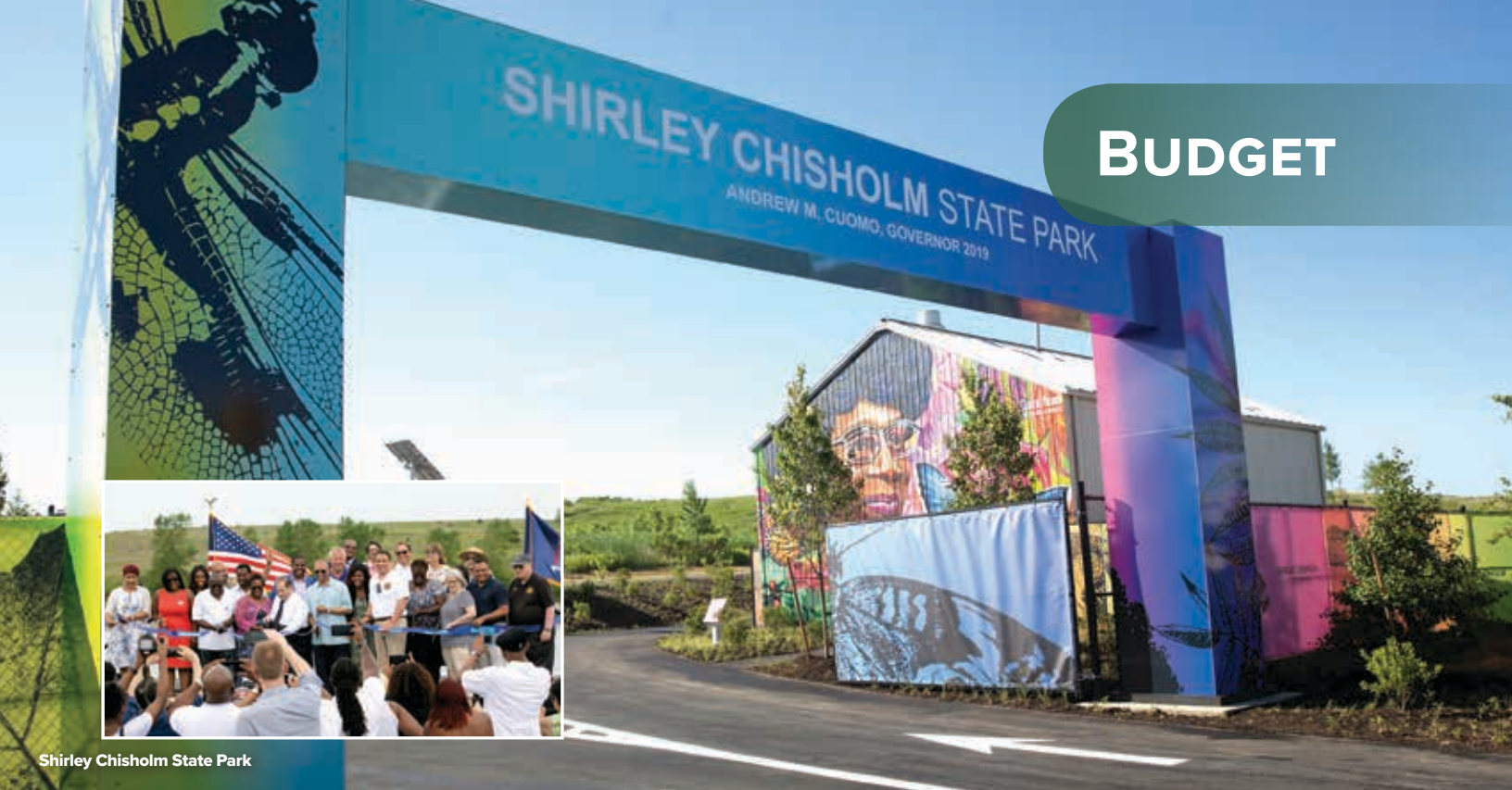
Shirley Chisholm State Park