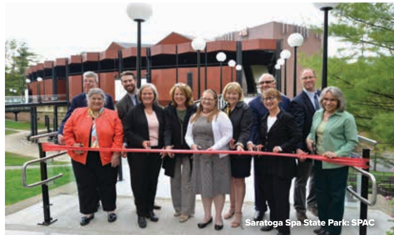
Saratoga Spa State Park: SPAC

A $1.75 million project to modernize the Saratoga Performing Arts Center amphitheater was completed in time for the 2019 summer concert season. The project renovated the amphitheater's aging balcony ramps and lighting with an elegant and safe entryway.