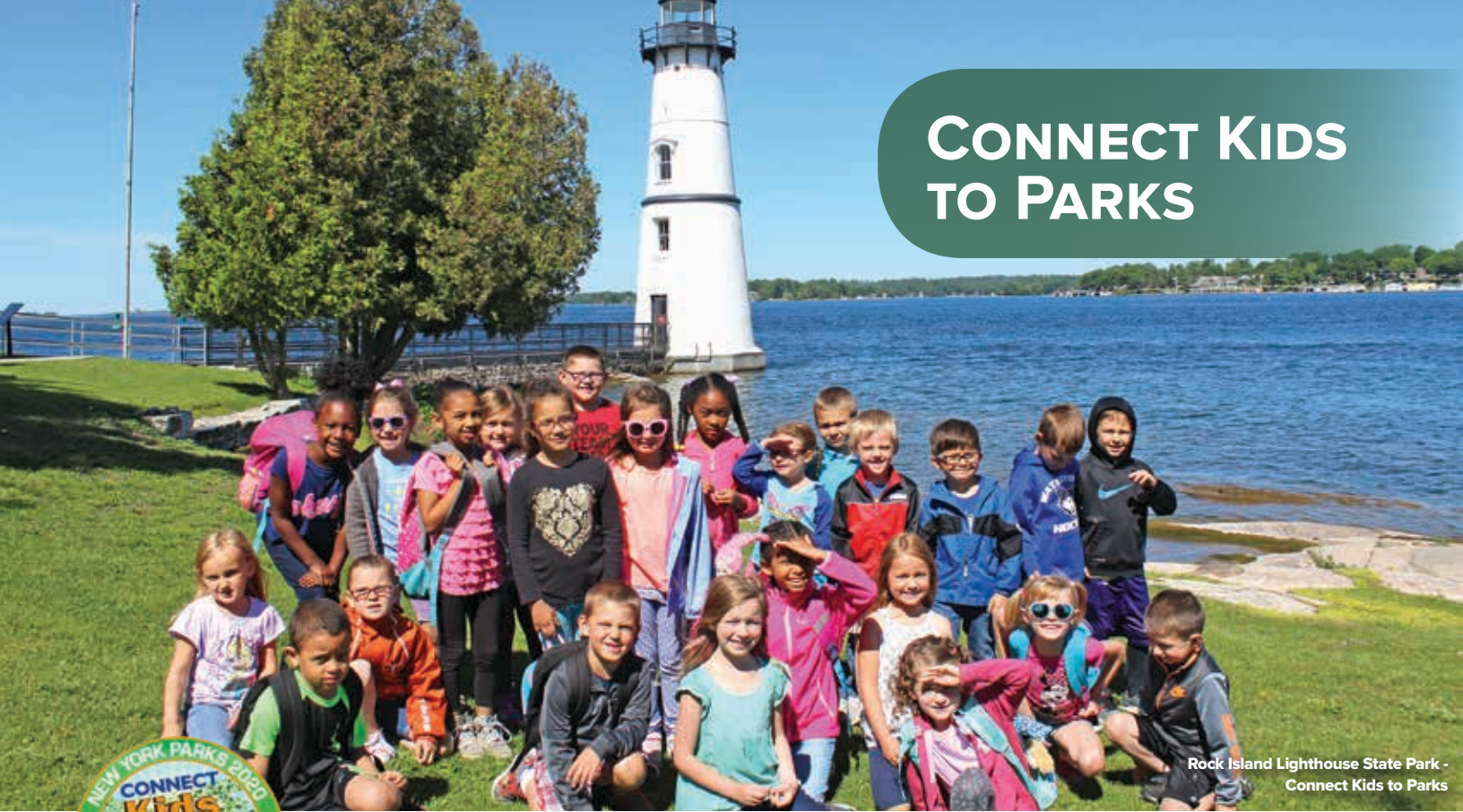
Rock Island Lighthouse State Park - Connect Kids to Parks