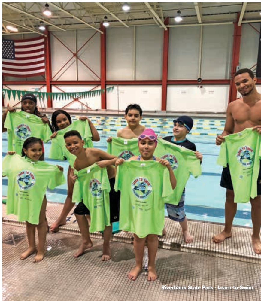
Riverbank State Park - Learn-to-Swim