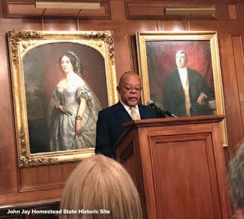
John Jay Homestead State Historic Site