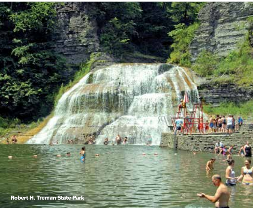
Robert H. Treman State Park