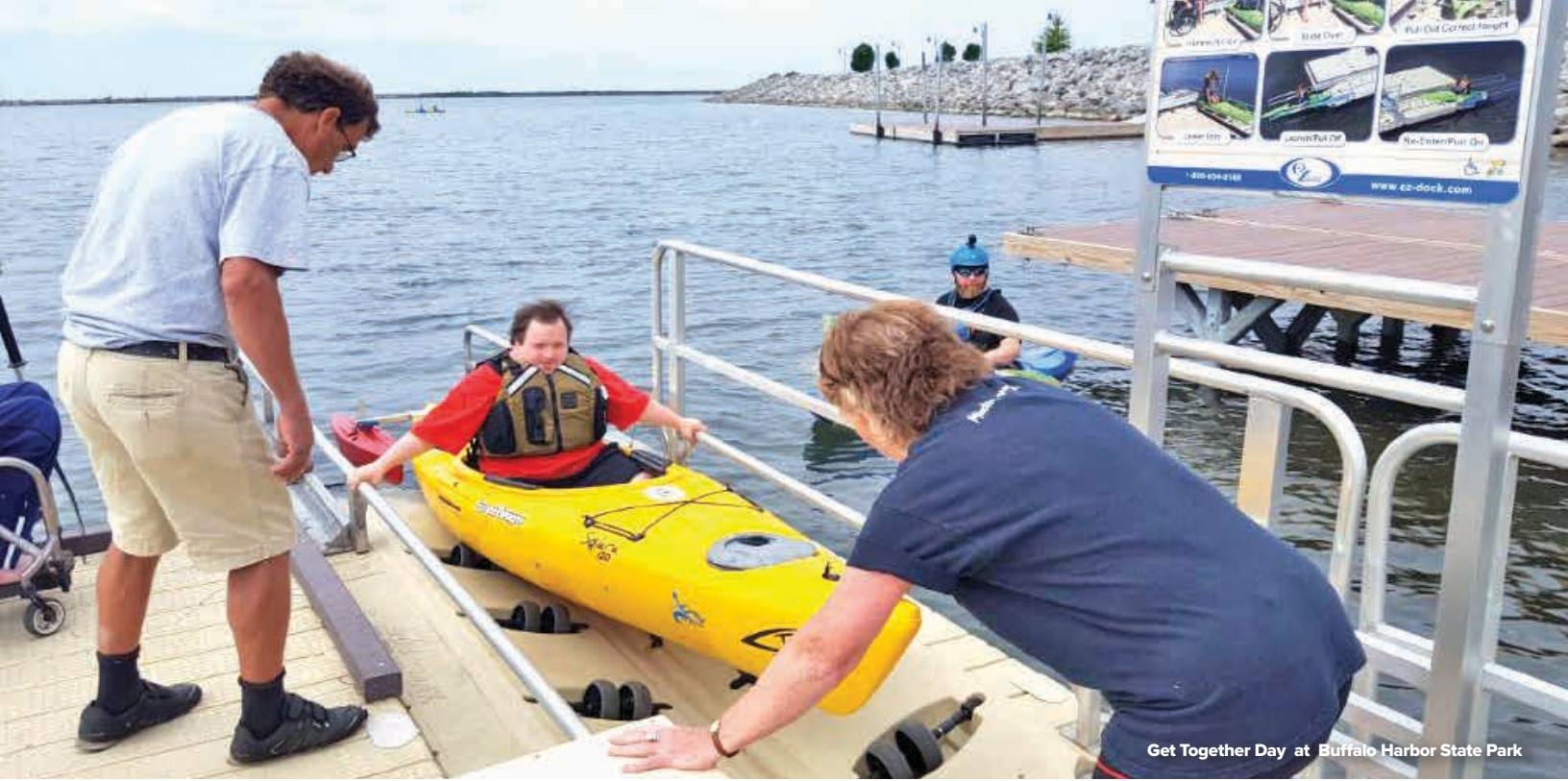
Get Together Day at Buffalo Harbor State Park