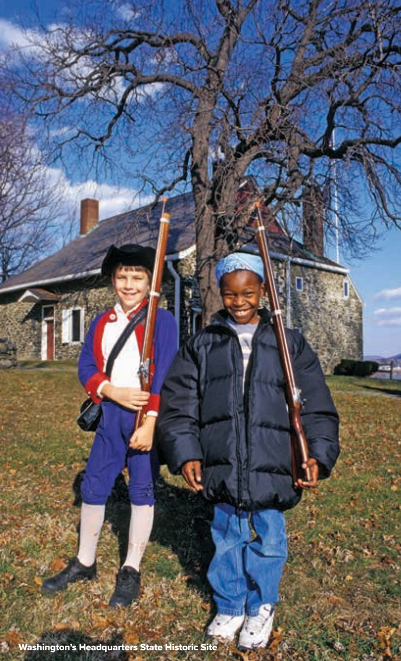
Washington's Headquarters State Historic Site