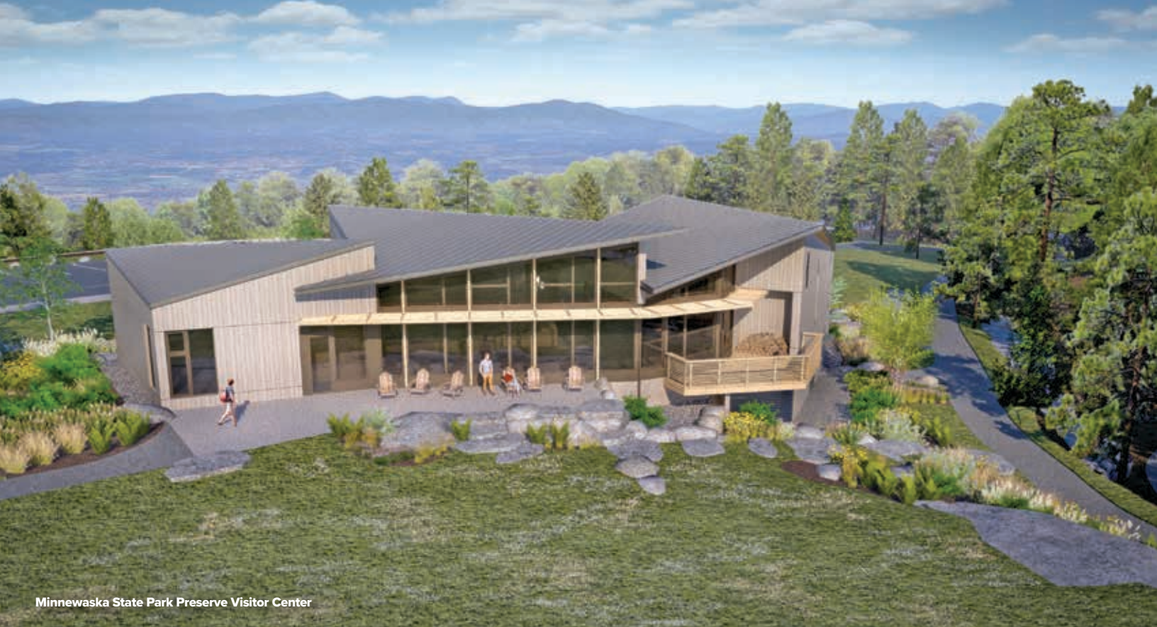
Minnewaska State Park Preserve Visitor Center