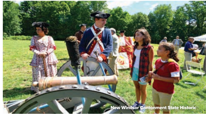
New Windsor Cantonment State Historic