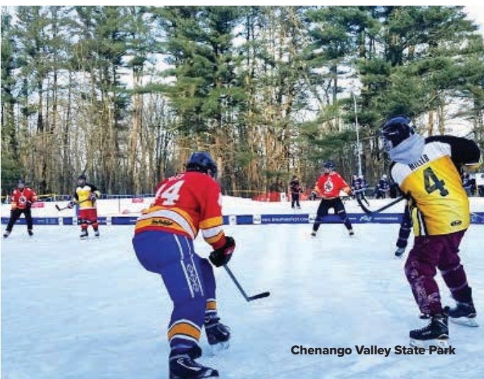
Chenango Valley State Park

The First Day Hike at Taughannock continues to shatter records. On January 1, 2019 1,242 intrepid hikers started their year on the right foot with a hike through the park and demonstrated the strong community connection to the park. Two major trail improvements were completed this year and