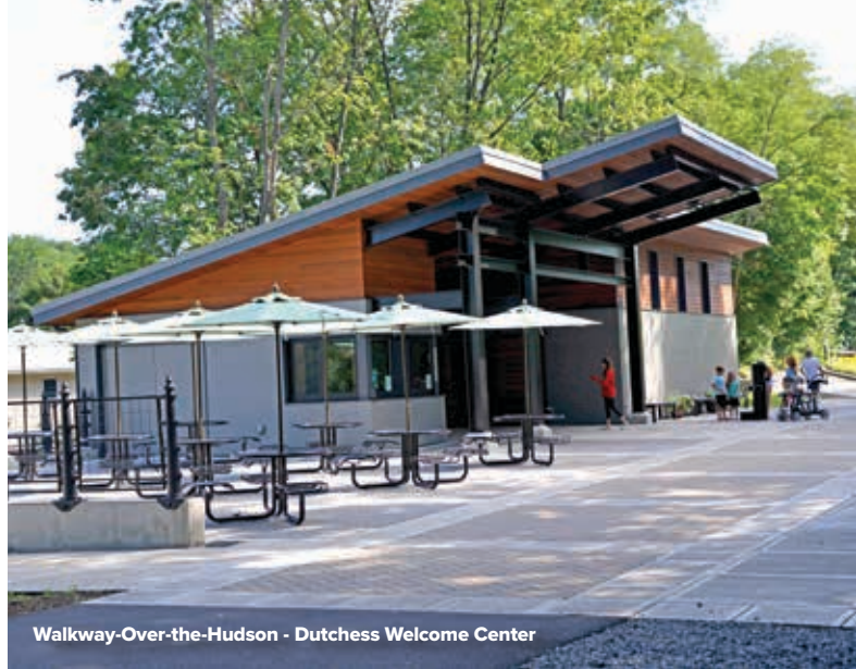
Walkway-Over-the-Hudson - Dutchess Welcome Center

artists. The performance space is named in recognition of philanthropist and Vista Equity Partners Founder, Chairman and CEO Robert Frederick Smith's $1 million donation toward a $2.8 million renovation of the facility.