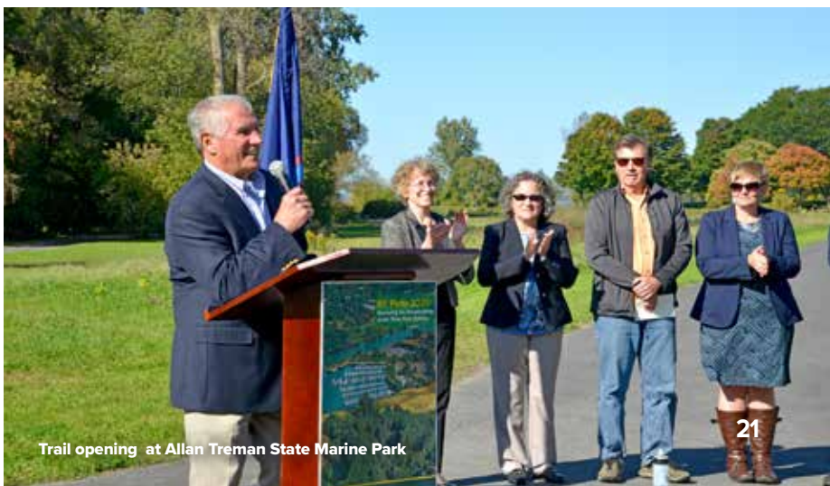
Trail opening at Allan Treman State Marine Park