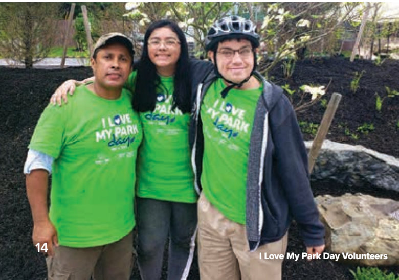
I Love My Park Day Volunteers

New York State Park Friends Groups continue to be an integral part of the success of the state park system. Over 90 friends' groups provide funding and volunteers for park and historic site programs, events and special projects. A study by Parks & Trails New York released in 2019 found not-for-profit Friends organizations supporting New York's state parks and historic sites provide critical support and programs to the state park system, including more than $17 million in private funds raised and nearly 132,000 hours of volunteer labor donated.