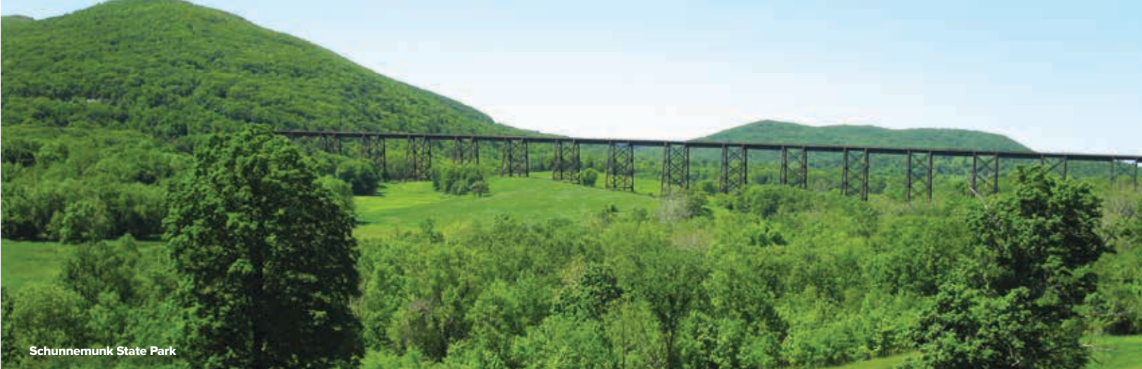
Schunemunk State Park