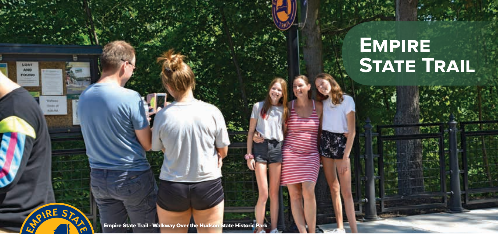
Empire State Trail - Walkway Over the Hudson State Historic Park