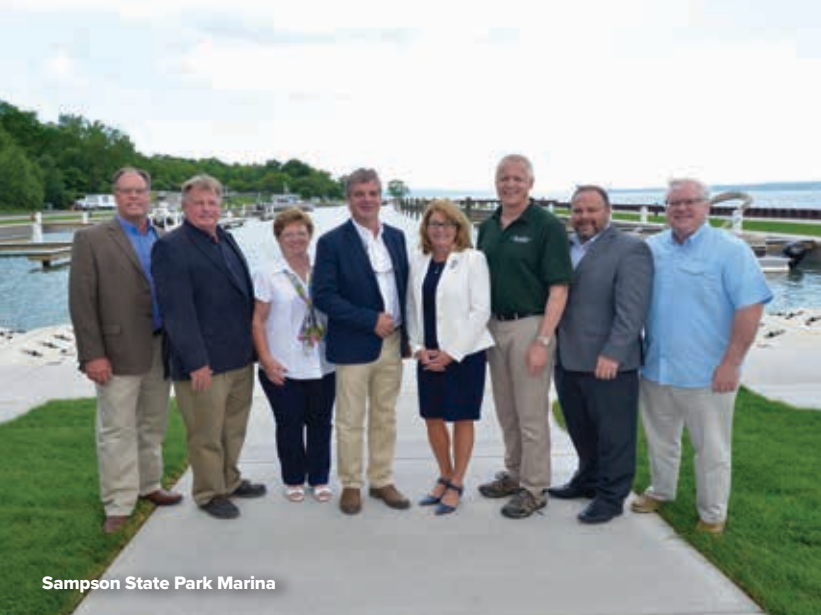
Sampson State Park Marina