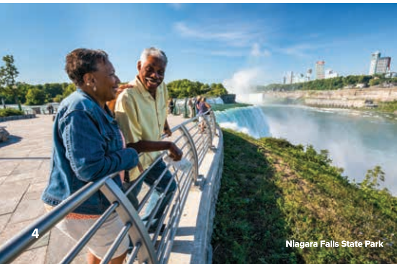
Niagara Falls State Park