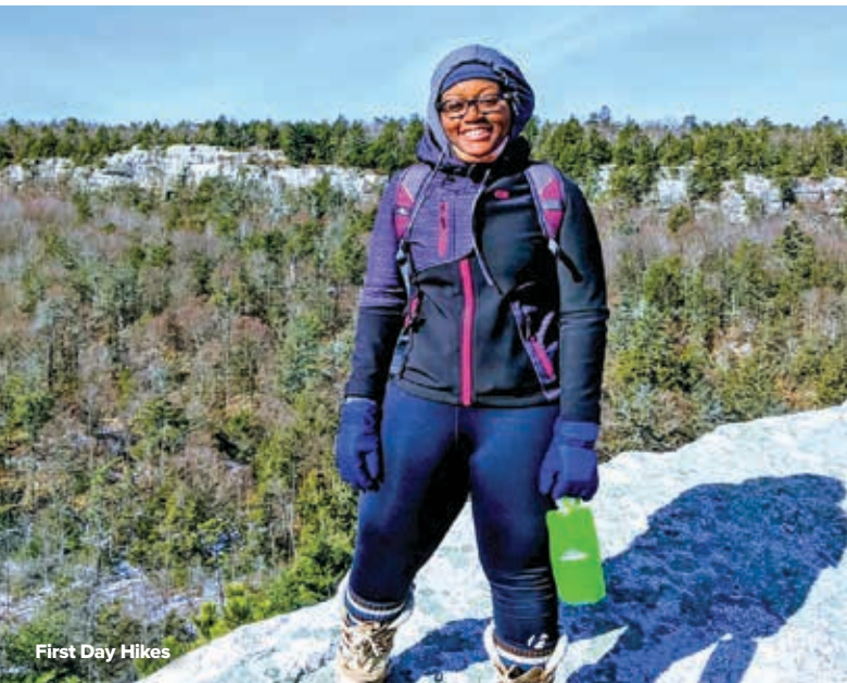
First Day Hikes