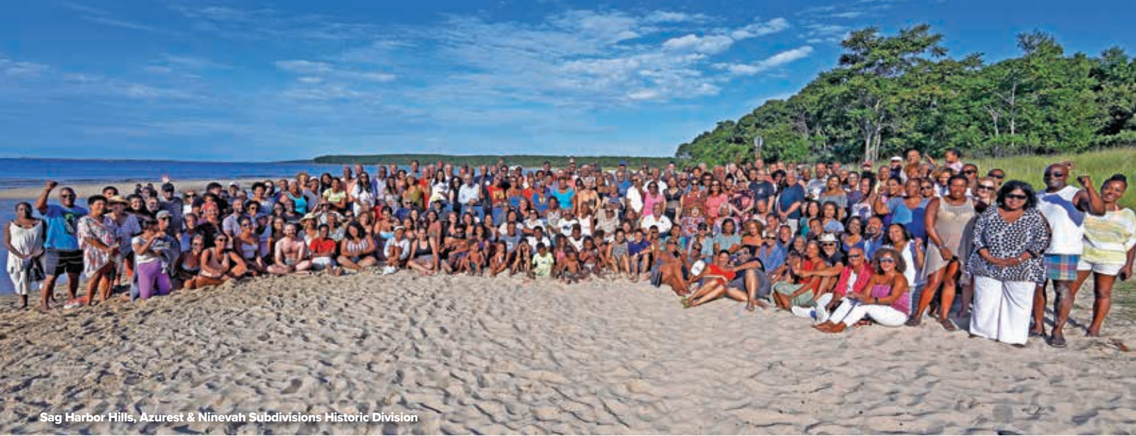
Sag Harbor Hills, Azurest & Ninevah Subdivisions Historic Division