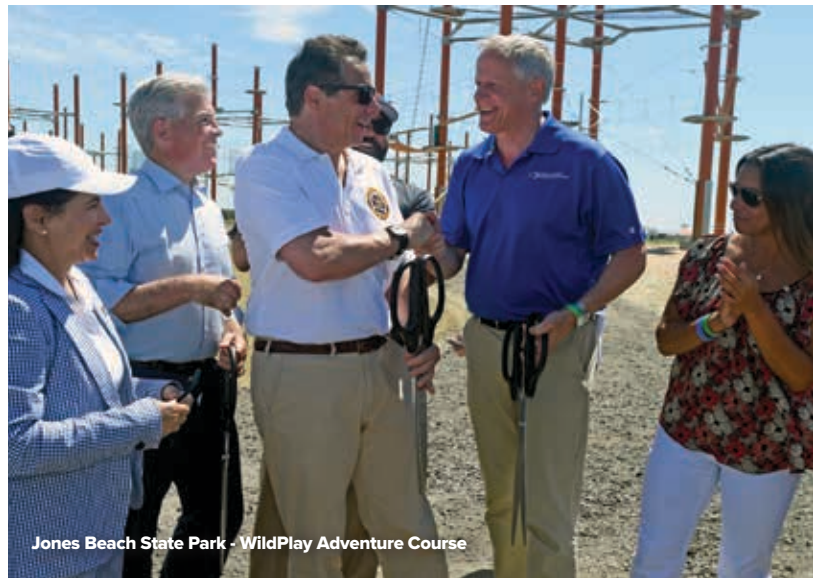
Jones Beach State Park - WildPlay Adventure Course