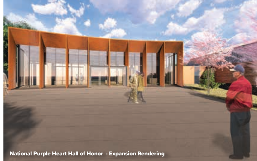
National Purple Heart Hall of Honor - Expansion Rendering