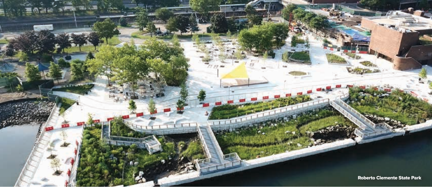
Roberto Clemente State Park

included the opening of the North Rim Staircase at Watkins Glen State Park and the opening of Trail at Allan Treman State Marine Park that links to Black Diamond Trail and the City of Ithaca's Cayuga Waterfront Trail.