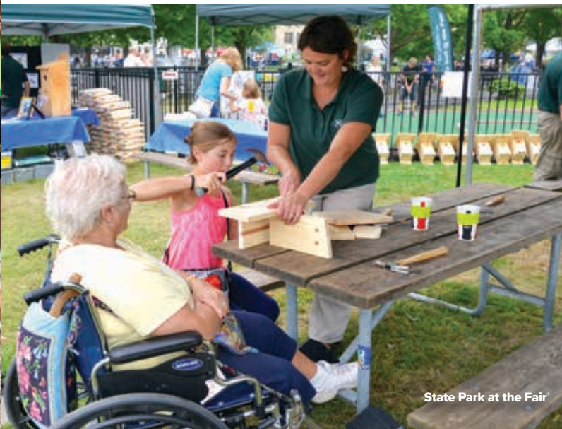
State Park at the Fair

In September, New York State Parks hosted the first-ever Get Together Day , an initiative with the New York State Office for People with Developmental Disabilities to celebrate community inclusion and showcase accessibility in outdoor recreation. Programs, events and activities were offered at seven parks across the state.