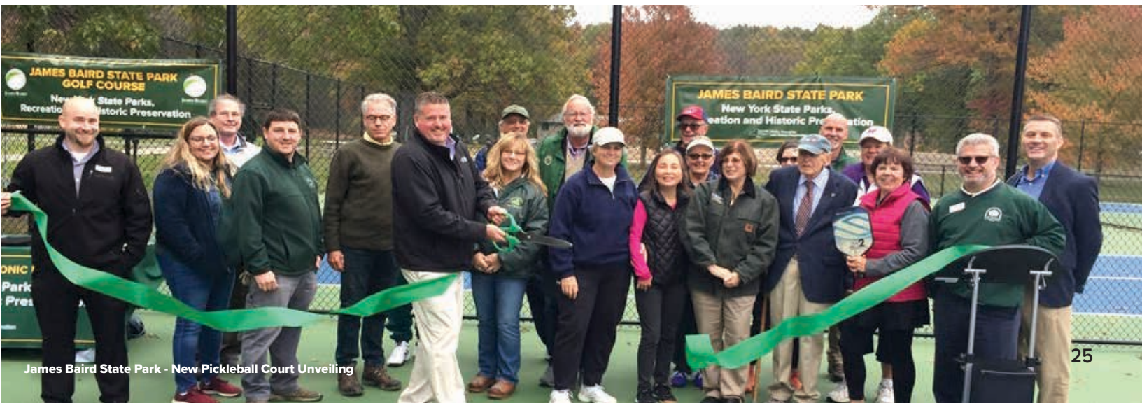
James Baird State Park - New Pickleball Court Unveiling

New floating docks were installed at Long Point State Park , designed to be more resilient in fluctuating water conditions. Seven new comfort stations are completed and opened at Higley Flow State Park . Two new playgrounds installed at Southwick Beach and Robert G. Wehle State Parks . A new comfort station at Long Point State Park was designed and built by talented in-house engineers and regional maintenance crews. Among many accomplishments by our Student Conservation Association members were two hitches at Cedar Island State Park as part of an initiative to revitalize this primitive island camping and day use park. A much-needed fish cleaning station was constructed at Wellesley Island State Park .