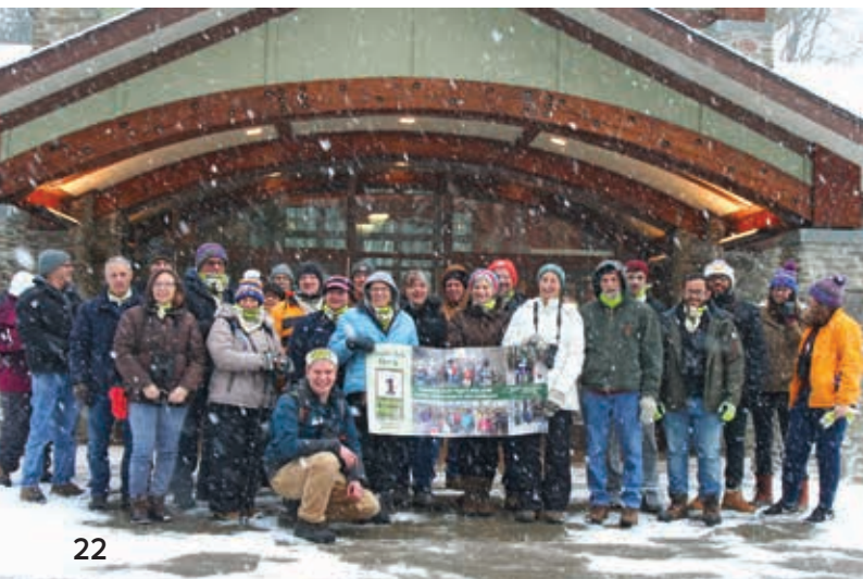
Letchworth State Park Preserve - First Day Hikes

Completed six months ahead of schedule, the Jones Beach Shared Use Path opened in April. The 4.5-mile leisure trail that offers walkers, skaters, runners, and cyclists stunning views of one of New York's most popular and beautiful state parks. Jones Beach State Park celebrated its 90th Birthday this summer. The party included the debut of the WildPlay Adventure Course and the completion of several capital projects part of the Jones Beach revitalization. Bethpage Black hosted the PGA Championship in May, welcoming more than 200,000 spectators to the park's storied Bethpage Black golf