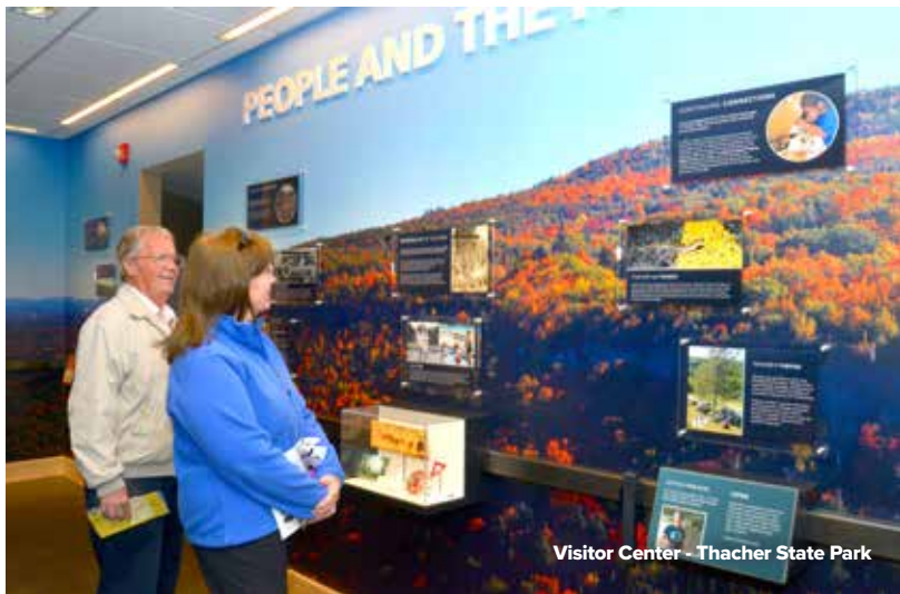
Visitor Center - Thacher State Park