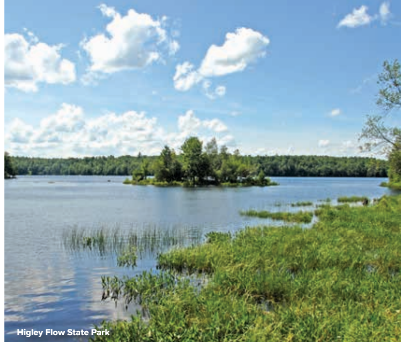
Higley Flow State Park

ment and the Friends of Schuyler Mansion to have an existing papier mache ceiling at Philipse Manor Hall 3D scanned by portable laser units. Once scanned, a 3D printer then used the scans to create a total of 55 unique molds to recreate the Philipse Manor ceiling for Schuyler Mansion State Historic Site . More than 300 pieces were cast to make the ceiling, using over 500 pounds of paper pulp. Once finished, the ornamental ceiling now looks like it has always been there.