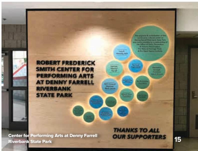
Center for Performing Arts at Denny Farrell Riverbank State Park

The Open Space Institute (OSI) , is leveraging public investments by raising private funds and completing projects at New York State Parks that make these popular outdoor destinations more welcoming and engaging. OSI 2019 projects included: partnering with State Parks in the design and construction of a new Minnewaska Visitor Center, carriage road restoration at Minnewaska State Park Preserve; the creation of new gateway signage at Fahnestock State Park; revitalizing the Cultural Performance Center at Denny Farrell Riverbank State Park; partnering with West Point cadets to construct new trail bridges at Fahnestock; and protecting land adjacent to Schunnemunk, Minnewaska, and Harriman and State Parks to protect the parks and improve public access.