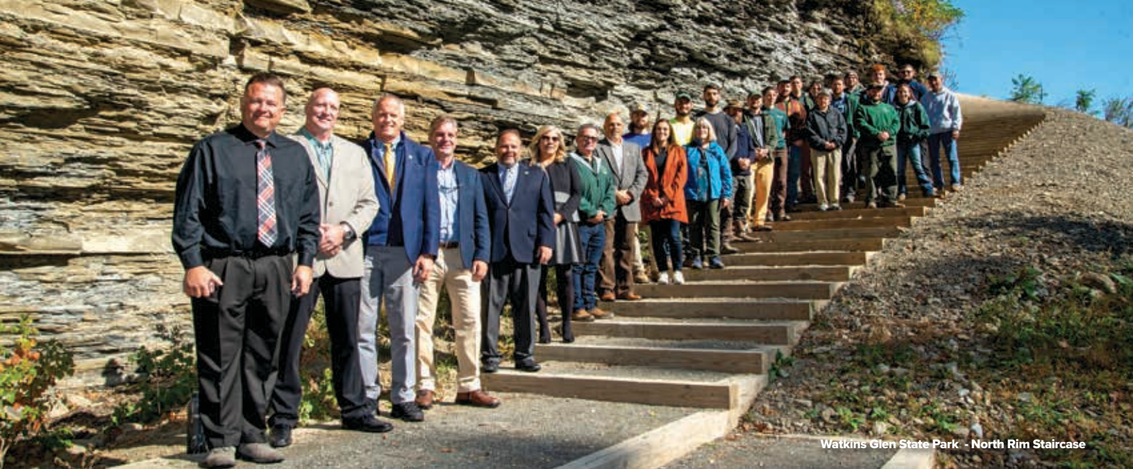
Watkins Glen State Park - North Rim Staircase