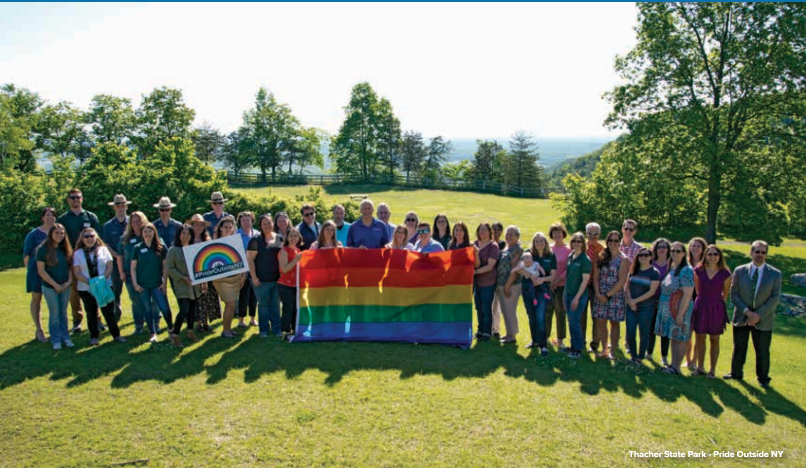
Thacher State Park - Pride Outside NY