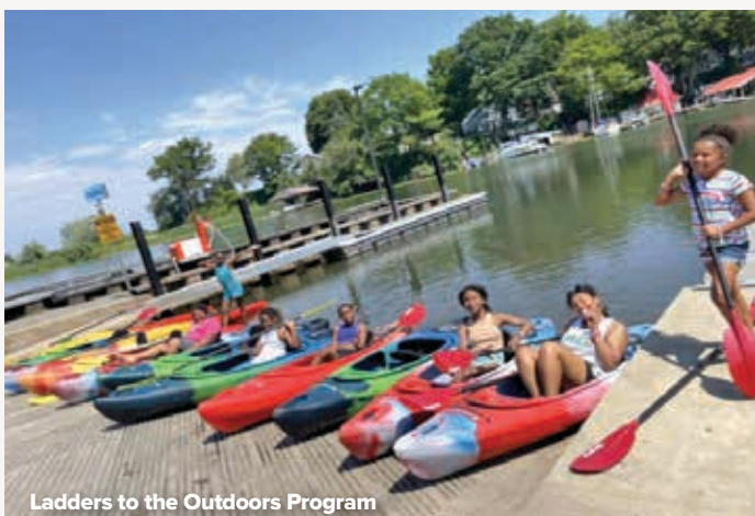
Ladders to the Outdoors Program

In 2022, a Ladders to the Outdoors program launched in Central New York with support from the Central New York Community Foundation, the Gifford Foundation and the Central Regional Commission.