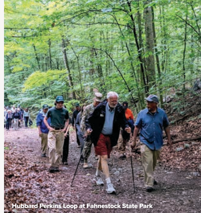
Hubbard Perkins Loop at Fahnestock State Park