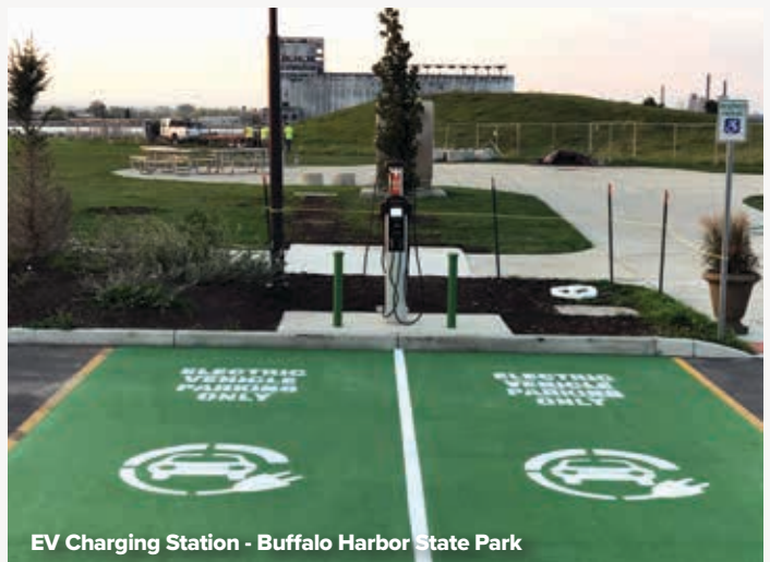
EV Charging Station - Buffalo Harbor State Park

As State Parks electrifies more of its systems, the agency wants to ensure that its electricity comes from renewable sources as well. As of fall 2022, State Parks has constructed over 5.5 MW of solar, covering 16% of its annual electric usage. Under Governor Kathy Hochel's leadership State Parks' goal is to cover all its electricity usage with on-site or purchased renewable energy by 2030.