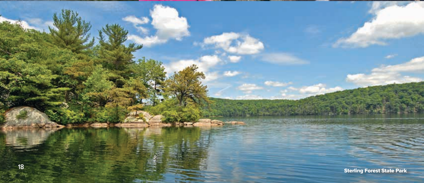
Sterling Forest State Park