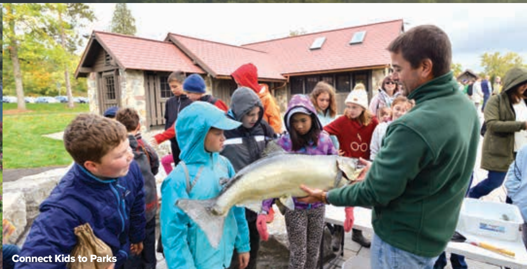
Connect Kids to Parks