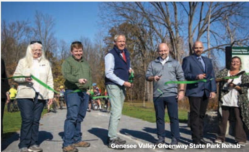
Genesee Valley Greenway State Park Rehab