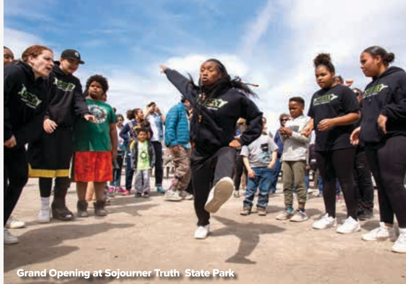
Grand Opening at Sojourner Truth State Park

In September, Niagara Regional Commission members attended the dedication of Cataract House Park , an important stop on the Underground Railroad. Planning of the Buffalo Harbor State Park revitalization is also underway. The Park will undergo $30 million upgrades, including the installation of a splash pad near the existing playground and shade structures. The upcoming project will also expand the existing playground to include four new accessible play pieces. Finally, Ladders to the Outdoors , a grass roots initiative that provides recreational experiences to underserved neighborhoods in the Niagara Region, has become an inspiration and model that will be duplicated across the state.