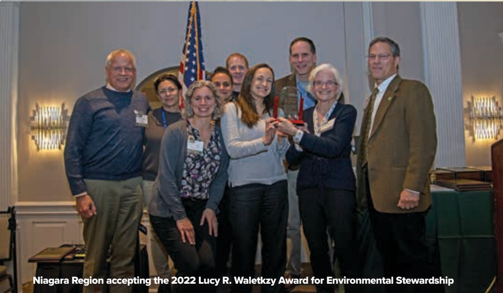
Niagara Region accepting the 2022 Lucy R. Waletzky Award for Environmental Stewardship