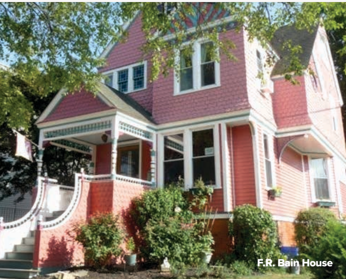
F.R. Bain House

The effort to nominate this community for its historic contributions to Spiritualism and the women's rights movement was spearheaded by community members whose advocacy and persistence successfully identified more than 200 historic resources for the district, which is now listed on the National and State Registers of Historic Places.