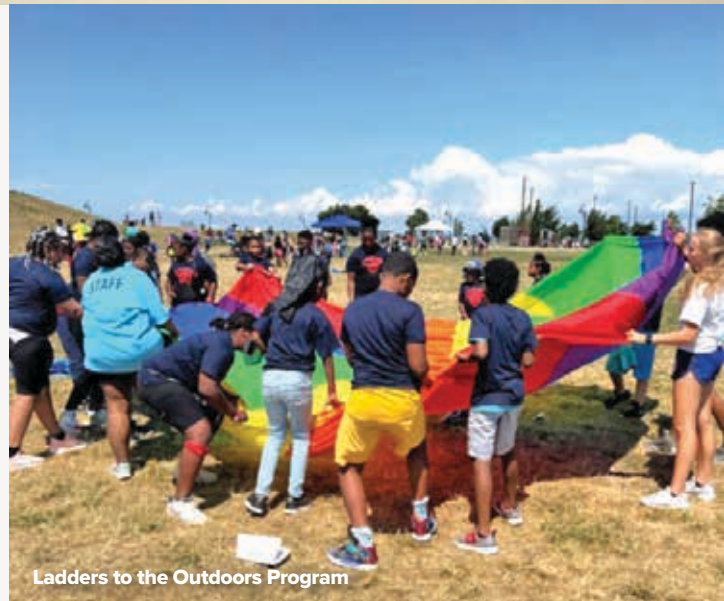
Ladders to the Outdoors Program