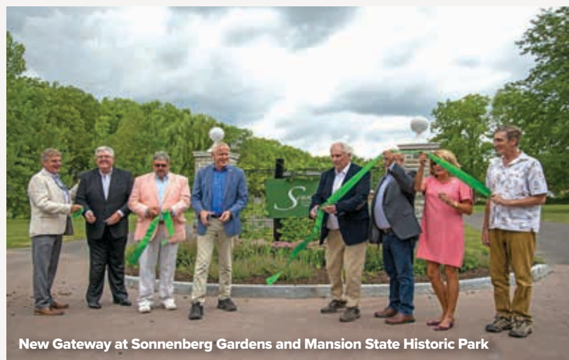
New Gateway at Sonnenberg Gardens and Mansion State Historic Park