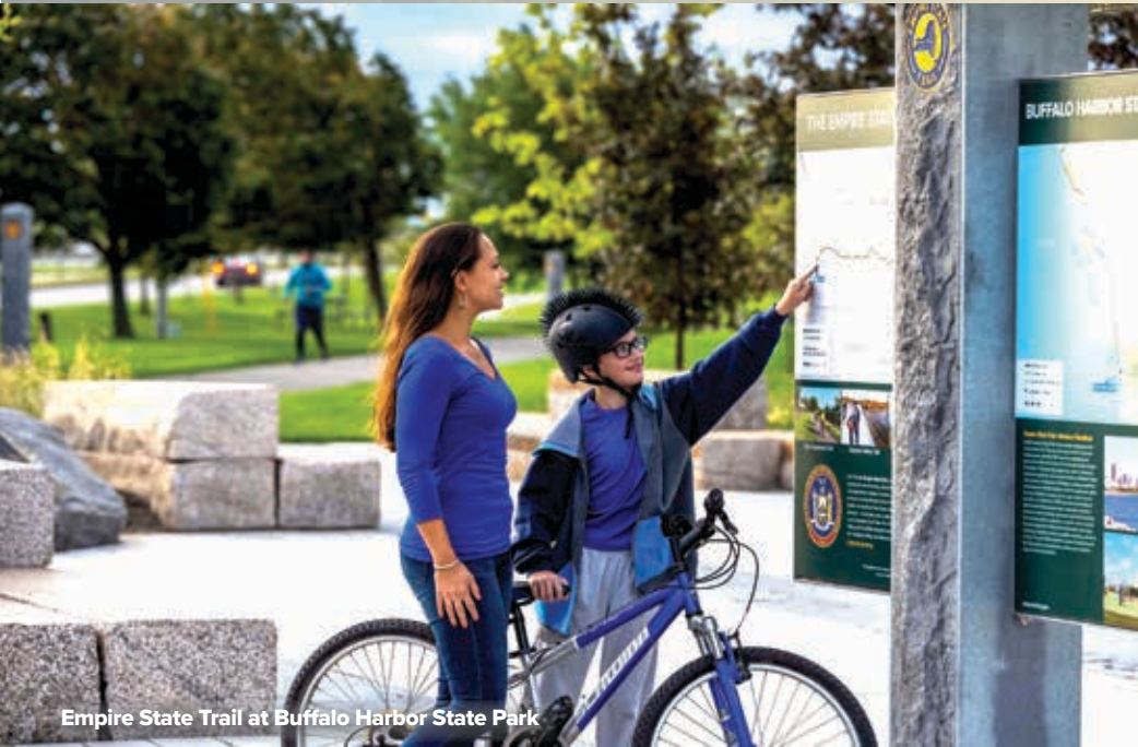
Empire State Trail at Buffalo Harbor State Park