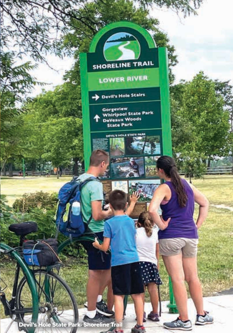
Devil's Hole State Park- Shoreline Trail