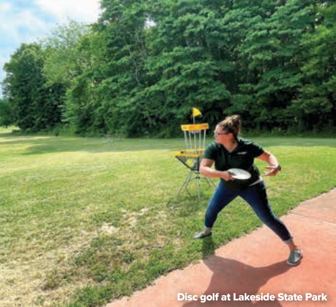
Disc golf at Lakeside State Park