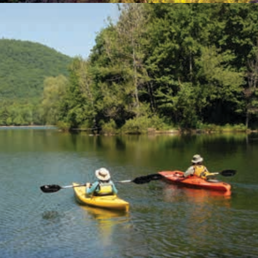
Soujourner Truth State Park