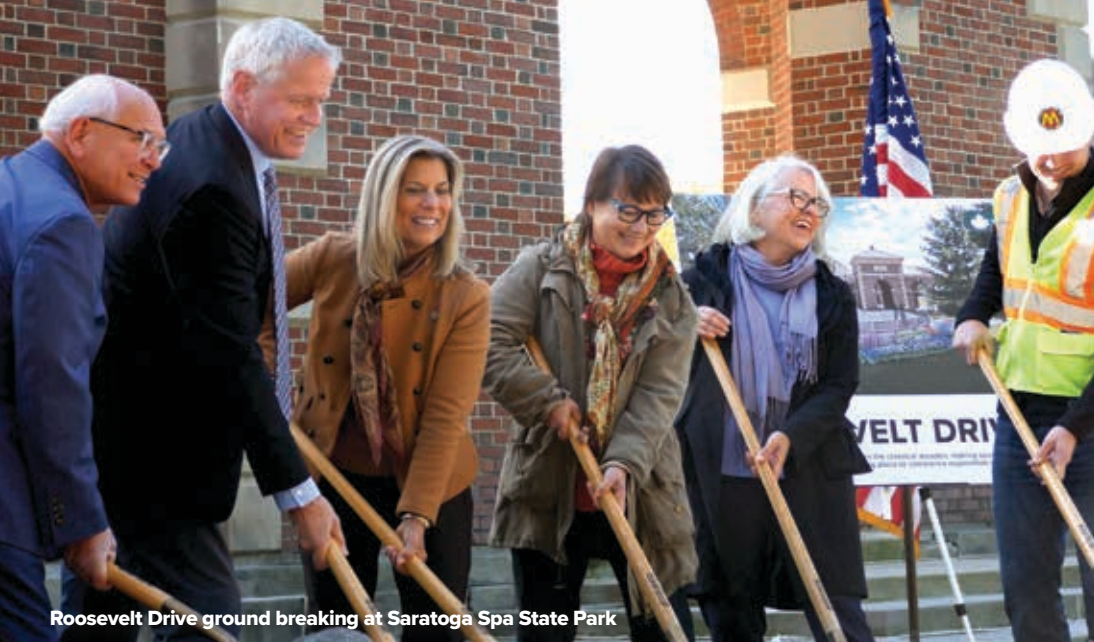
Roosevelt Drive ground breaking at Saratoga Spa State Park