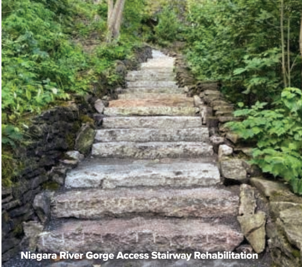
Niagara River Gorge Access Stairway Rehabilitation