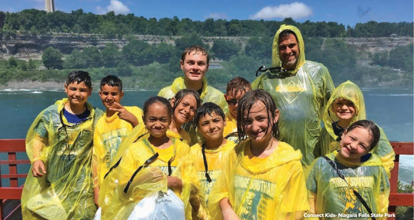
Connect Kids- Niagara Falls State Park