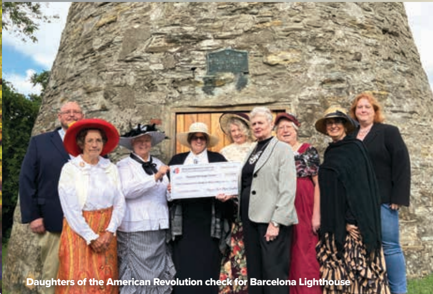
Daughters of the American Revolution check for Barcelona Lighthouse