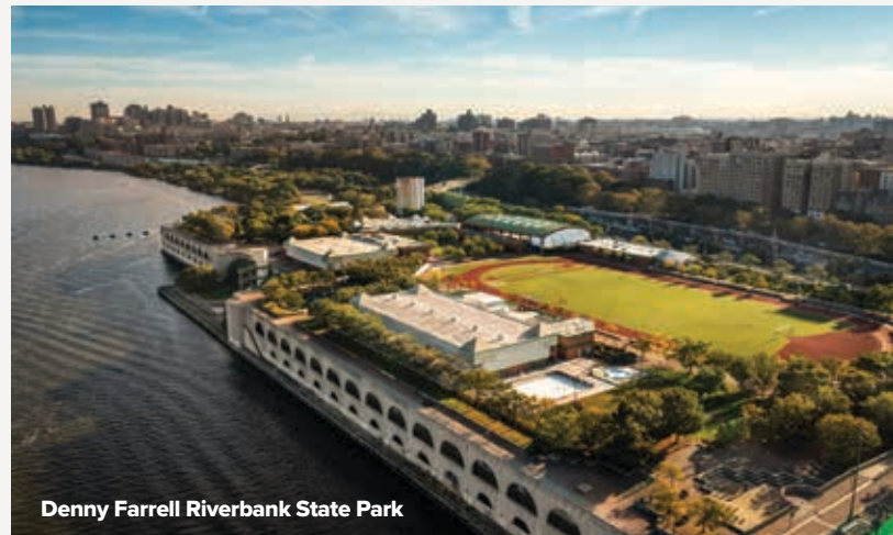
Denny Farrell Riverbank State Park

Their stories, along with Harriet Tubman and many others, are shared at the nearby Niagara Falls Underground Railroad Heritage Center.