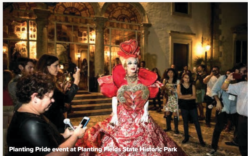
Planting Pride event at Planting Fields State Historic Park

In June of 2022, Planting Fields State Historic Park in the Long Island Region, hosted the first Planting Pride event; a