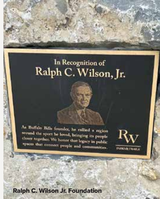
Ralph C. Wilson Jr. Foundation

ernization of this marina is one of several projects aiming to restore the ecological health of the Niagara River and surrounding habitats.