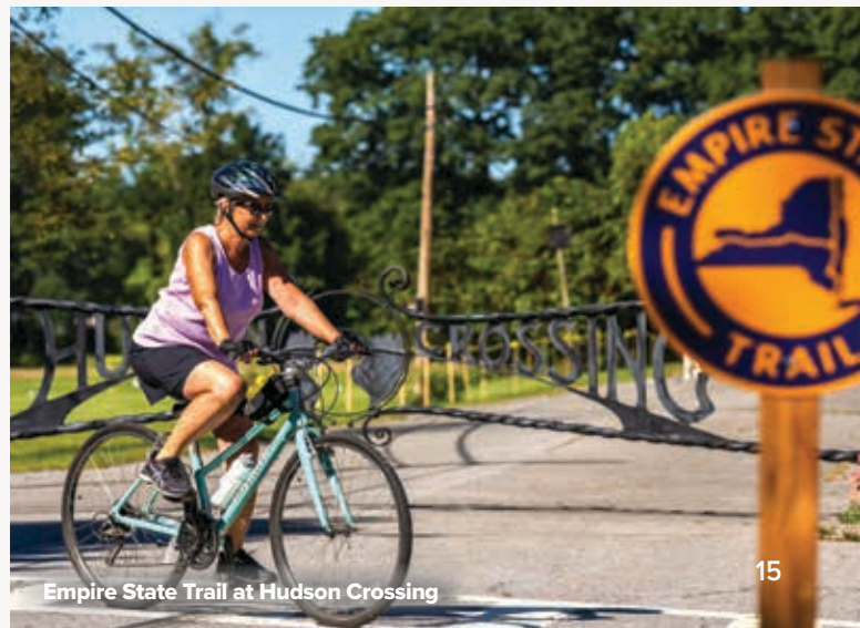
Empire State Trail at Hudson Crossing