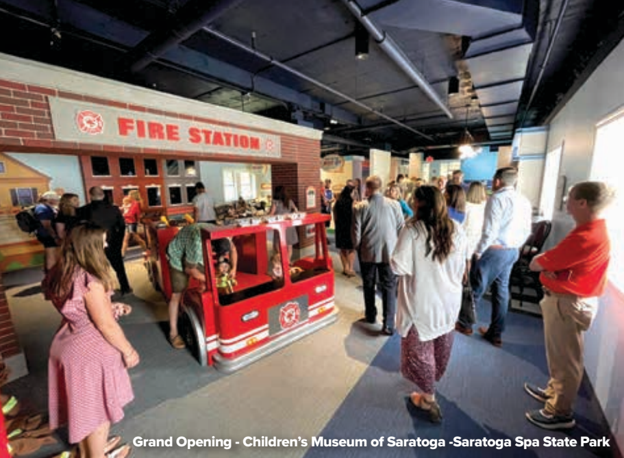
Grand Opening - Children's Museum of Saratoga -Saratoga Spa State Park