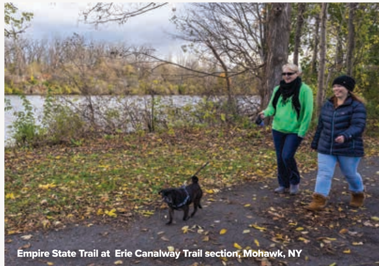
Empire State Trail at Erie Canalway Trail section, Mohawk, NY

State Parks completed several projects to rehabilitate key trail segments in the Mohawk Valley and Capital Region in 2022. The agency revitalized a 3-mile trail section from the City of Cohoes, running northwest towards the Town of Colonie. Additionally, a 2.5-mile section of the trail from the City of Little Falls east to Herkimer Home State Historic Site was revamped this year. Both trail segment projects included a new asphalt surface and many safety improvements. Lastly, a project to resurface the 5-mile section of the Erie Canalway Trail, from Herkimer Home State Historic Site east to the Montgomery County line was completed. State Parks will continue to prioritize Empire Trail projects in order to maintain one of New York’s finest outdoor public attractions.