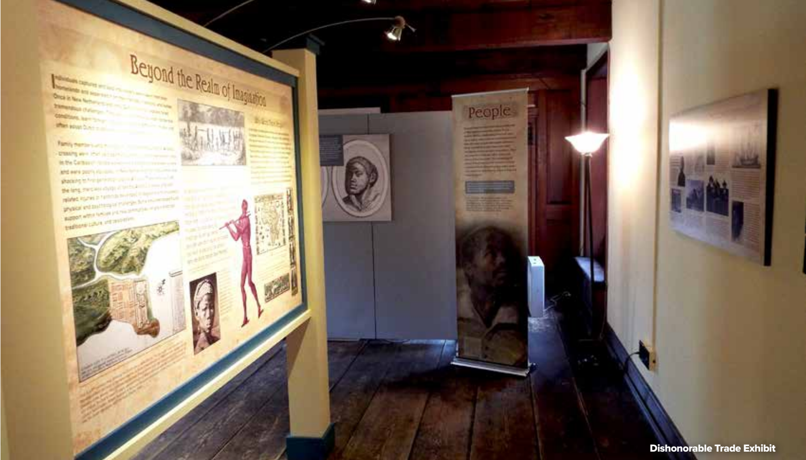
Dishonorable Trade Exhibit

to host a webinar on “Building an Inclusive Work Culture for Transgender Identities and Remembering Transgender Lives Lost”. Marsha P Johnson State Park also hosted several Drag Story Hours throughout the year. In support of the annual New York State Parks Pride Outside campaign, a special progressive flag maple leaf logo t-shirt was made available for staff to personally purchase as part of the official uniform.