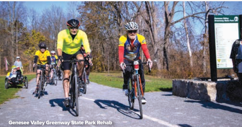
Genesee Valley Greenway State Park Rehab