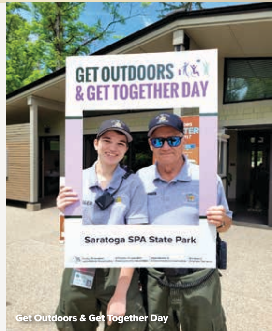
Get Outdoors & Get Together Day