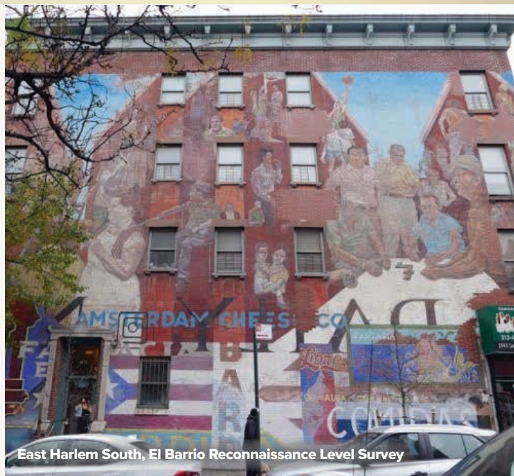
East Harlem South, El Barrio Reconnaissance Level Survey

The Division for Historic Preservation is the designated State Historic Preservation Office for New York and administers a variety of programs and services in collaboration with government agencies, organizations, and residents of New York State. In 2022, the Division received over 800 applications for homeowner tax credits, reviewed 49 projects totaling over $1.2 billion in private investment incentivized by the federal and state historic tax credit programs, approved 95 nominations to the state and national registers for historic places, and awarded over $9 million in historic preservation grants. In 2022, the Division secured federal grants to help support historic preservation work in the state, including a grant for exterior restoration work at Old Fort Niagara and funds to support an amendment and a nomination to the National Register of Historic Places that highlight Black and LGBTQ history in New York City.