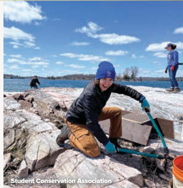
Student Conservation Association