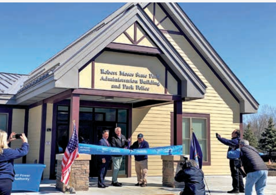
New Administration Building at Robert Moses State Park

agency began developing a Master Plan and Environmental Impact Statement for Clermont State Historic Site , located in Columbia County, NY. And thanks to collaboration with The Olana Partnership, Olana State Historic Site will undergo major capital and site improvement projects, including the creation of the Frederic Church Center for Art and Landscape. The Taconic Regional Commission helped Friends of Taconic State Park secure funding to finish the development of a 1,000-foot loop railroad at the Copake Iron Works Historic Site at Taconic State Park .