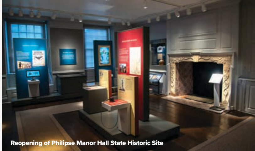
Reopening of Philipse Manor Hall State Historic Site