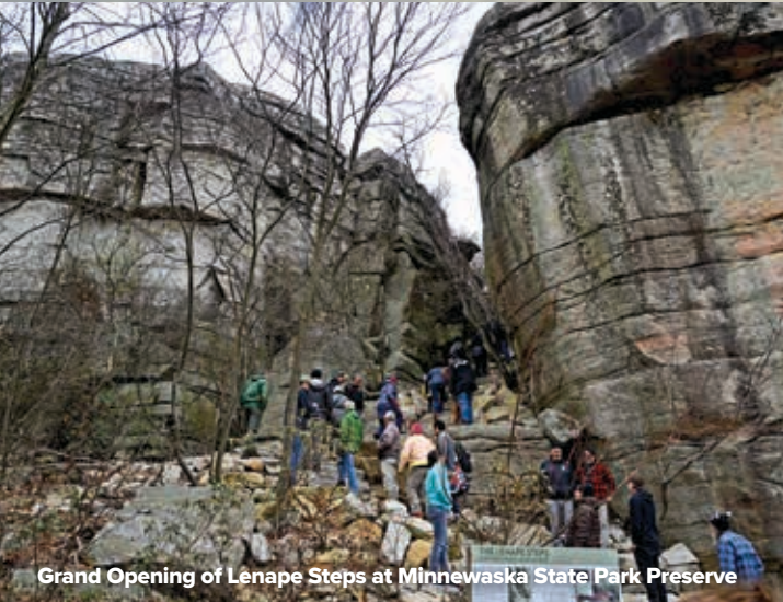
Grand Opening of Lenape Steps at Minnewaska State Park Preserve