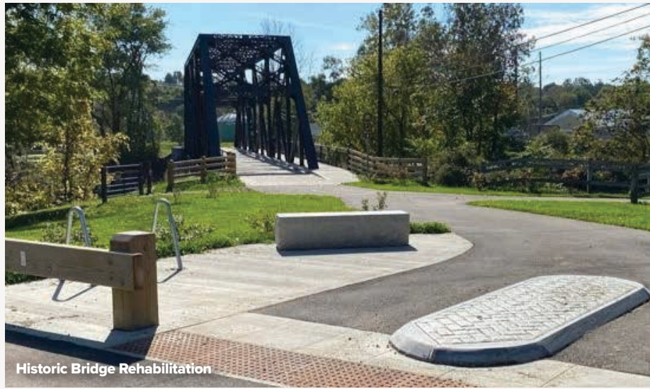
Historic Bridge Rehabilitation