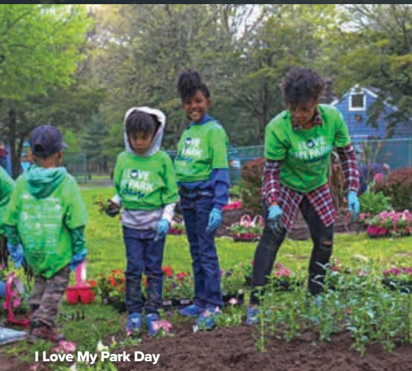
I Love My Park Day