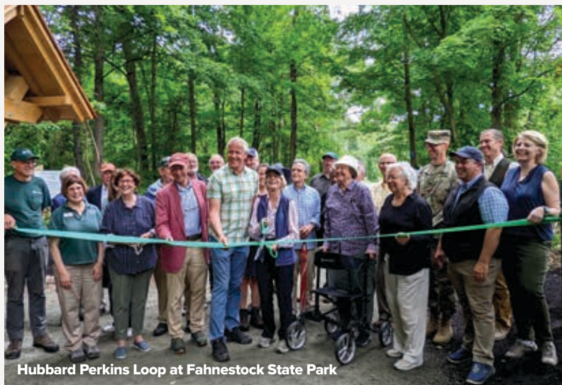
Hubbard Perkins Loop at Fahnestock State Park

State Parks, the Open Space Institute (OSI), and the Taconic Regional Commission opened the newly renovated Hubbard Perkins Loop Trail in late June. This trail is part of a series of OSI-led park enhancement projects aimed at making Fahnestock State Park more welcoming to visitors by improving access. The project overhauled 9.5 miles of multi-use trails to better accommodate park visitors. Improvements include the construction of fourteen new pedestrian bridges and trail crossings, four of which were completed through an ongoing partnership with the U.S. Military Academy at West Point.