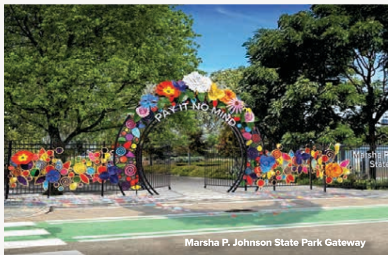
Marsha P. Johnson State Park Gateway

A major highlight of the summer season, Long Island’s Bethpage State Park hosted the 43rd Polo Golf Junior Classic on the Black Course, one of the most difficult golf courses in the nation, in late June and early July. The Long Island Regional Commission raised nearly $100,000 for their Parks over the summer at several planned fundraising events, including the Bethpage Golf Tournament and the Rod Stewart Concert Fundraiser.