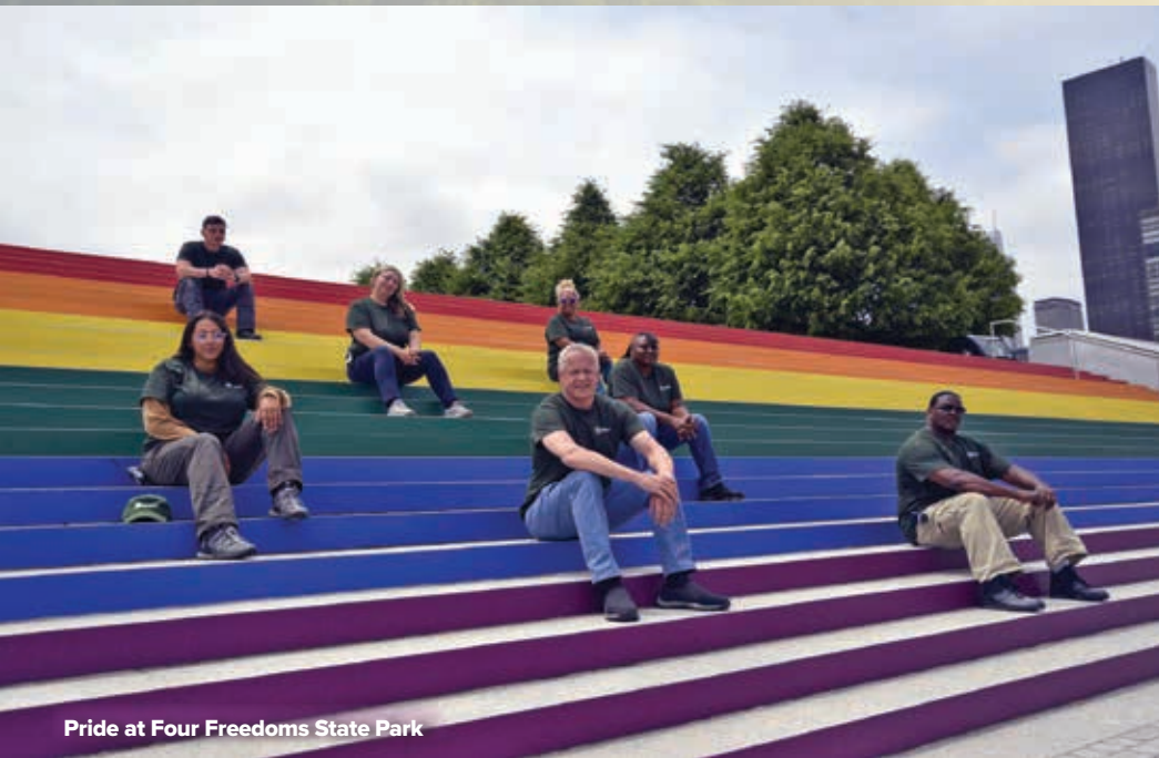
Pride at Four Freedoms State Park