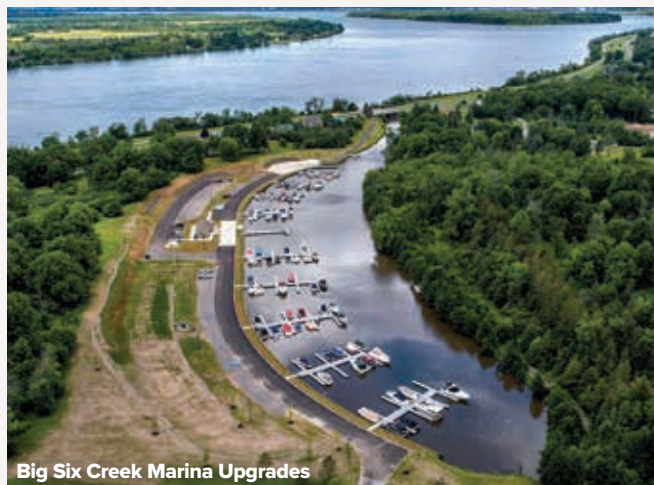
Big Six Creek Marina Upgrades