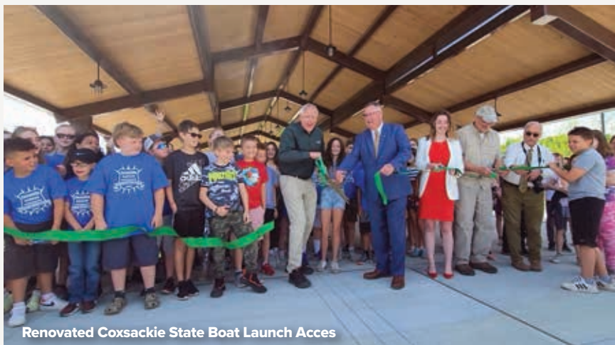
Renovated Cocksackie State Boat Launch Access

In late June, the agency celebrated the reopening of the Big Six Mile Creek Marina on Grand Island following a $2.4 million renovation project. Funding for the project was provided through Niagara River Greenway and the New York Works program. This project involved upgrades to expand the parking lot, modernize drainage and electrical systems, improve landscaping with native species and rehabilitate the existing building/restrooms, including making them fully accessible. Environmental site improvements included removing a buried fuel tank, installing an above ground fuel tank, and modernizing the sanitary sand filter. The mod-