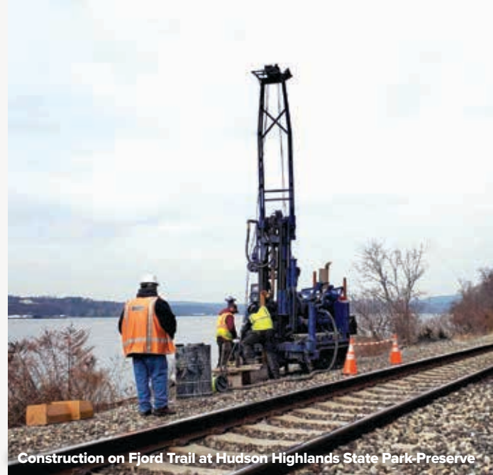
Construction on Fjord Trail at Hudson Highlands State Park- Preserve