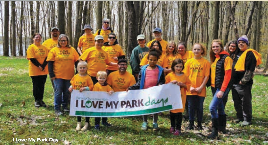
I Love My Park Day