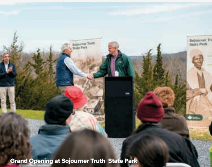
Grand Opening at Sojourner Truth State Park

The nearly completely digital exhibit, George Washington: Perspectives on His Life and Legacy , is the state park system's first exhibit that is completely available in Spanish and English, and the first installed as part of the Our Whole History initiative to bring forward the under-told stories of all the people who lived at State Historic Sites. The exhibit explores six aspects of Washington's career and personal life: General; Politician; Celebrity; Roman Virtue; Slaveholder; and Private Citizen. This exhibit includes quotes from men, women, native peoples, enslaved peoples, people of African descent, Americans, French and British to highlight different aspects of Washington's life, career, and behavior.