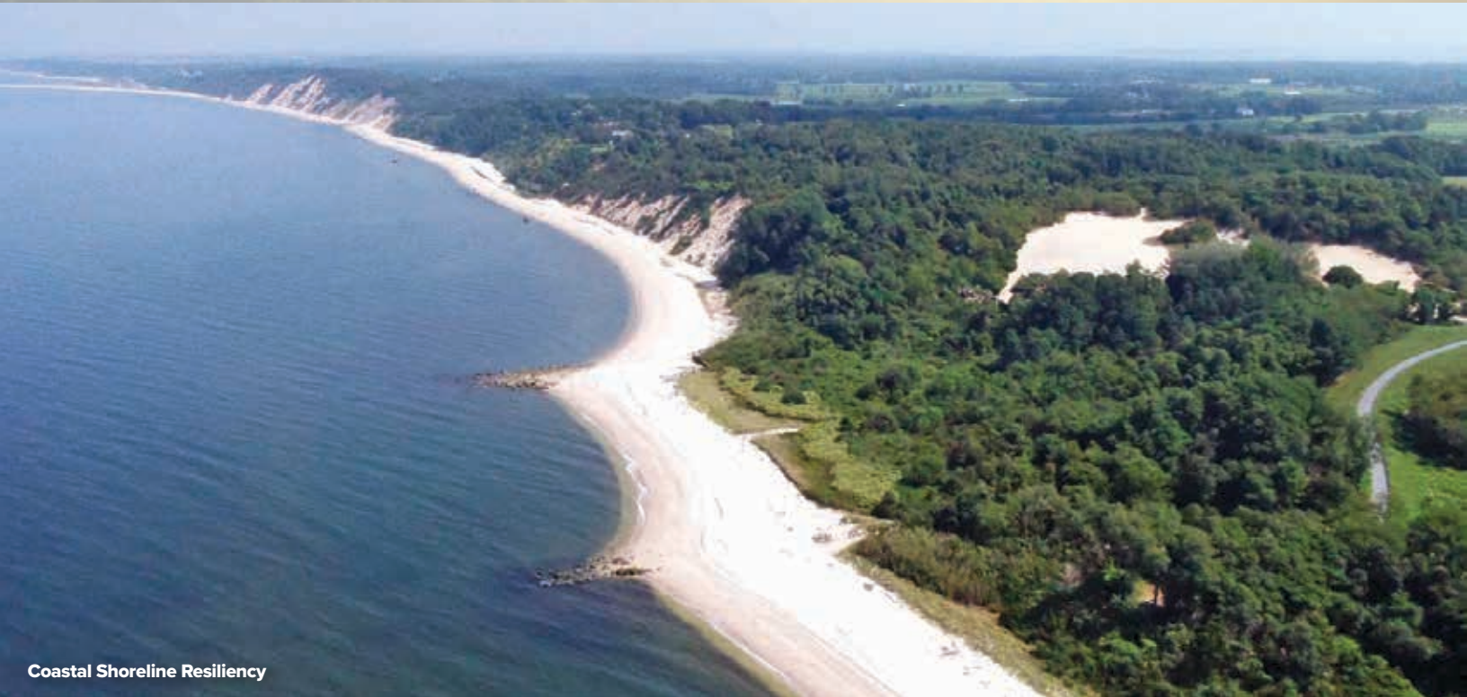
Coastal Shoreline Resiliency

In 2022, OPRHP introduced the agency's first Climate Change Action Plan, a roadmap to guide the agency in adapting to climate change, protecting the incredible natural, recreational, and cultural resources on behalf of the public, and reducing carbon emissions. The OPRHP Climate Change Action Committee (CCAC), established in April of 2022, has drafted phase one of the Action Plan, which identifies goals, objectives, success indicators, and actions for the Agency's highest priority strategies—coastal resiliency and energy. The plan aims to stabilize shorelines, retreat coastal infrastructure, and create storm resiliency within Parks. It will also implement strategies to make Parks more energy efficient, including the adaption of renewable energies and alternative fuels. The Agency looks forward to implementing the first phase of the Action Plan throughout 2023, and additional phases in the years to come.