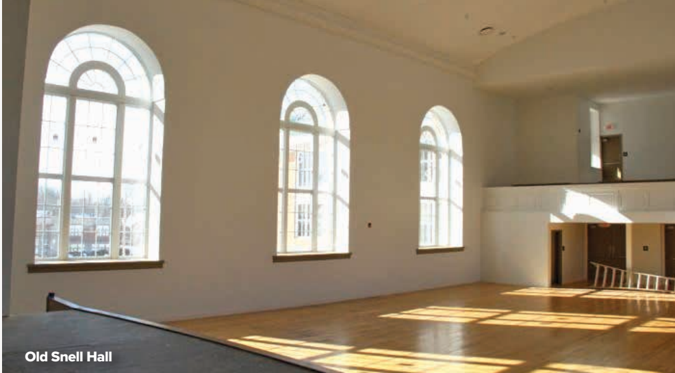
Old Snell Hall