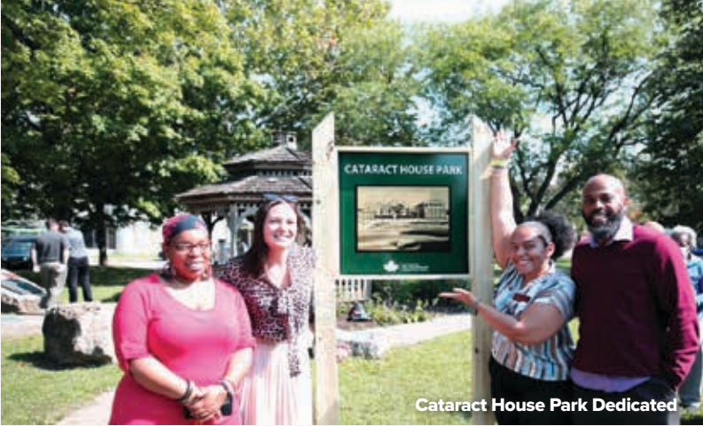
Cataract House Park Dedicated