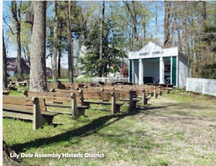
Lily Dale Assembly Historic District