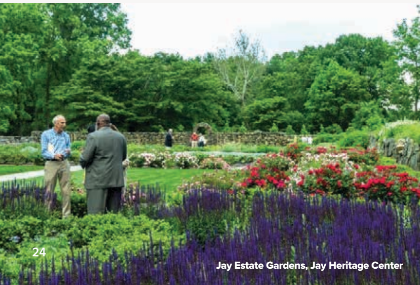
Jay Estate Gardens, Jay Heritage Center