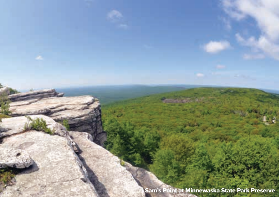
Sam's Point at Minnewaska State Park Preserve