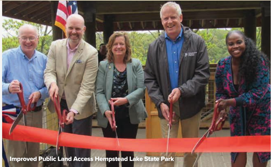
Improved Public Land Access Hempstead Lake State Park