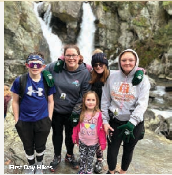
First Day Hikes