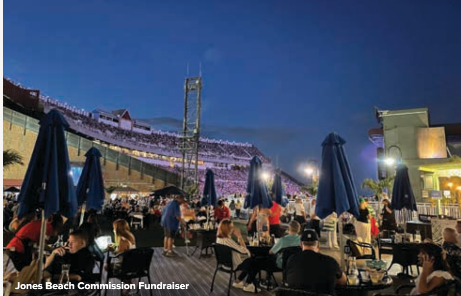
Jones Beach Commission Fundraiser