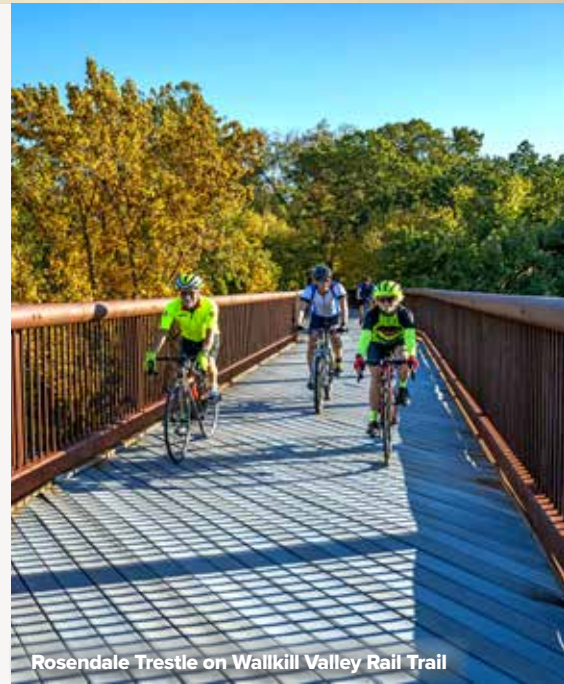
Rosendale Trestle on Walkkill Valley Rail Trail

The Empire State Trail is the longest statewide multi-use trail in the country spanning 750 miles from Buffalo to Albany, and from New York City through the Hudson and Champlain Valleys to Canada. Officially opened in December 2020, the Empire State Trail welcomes bicyclists and walkers of all ages and abilities to experience the Empire State’s urban centers, village main streets, rural communities, diverse history, and remarkable natural resources.