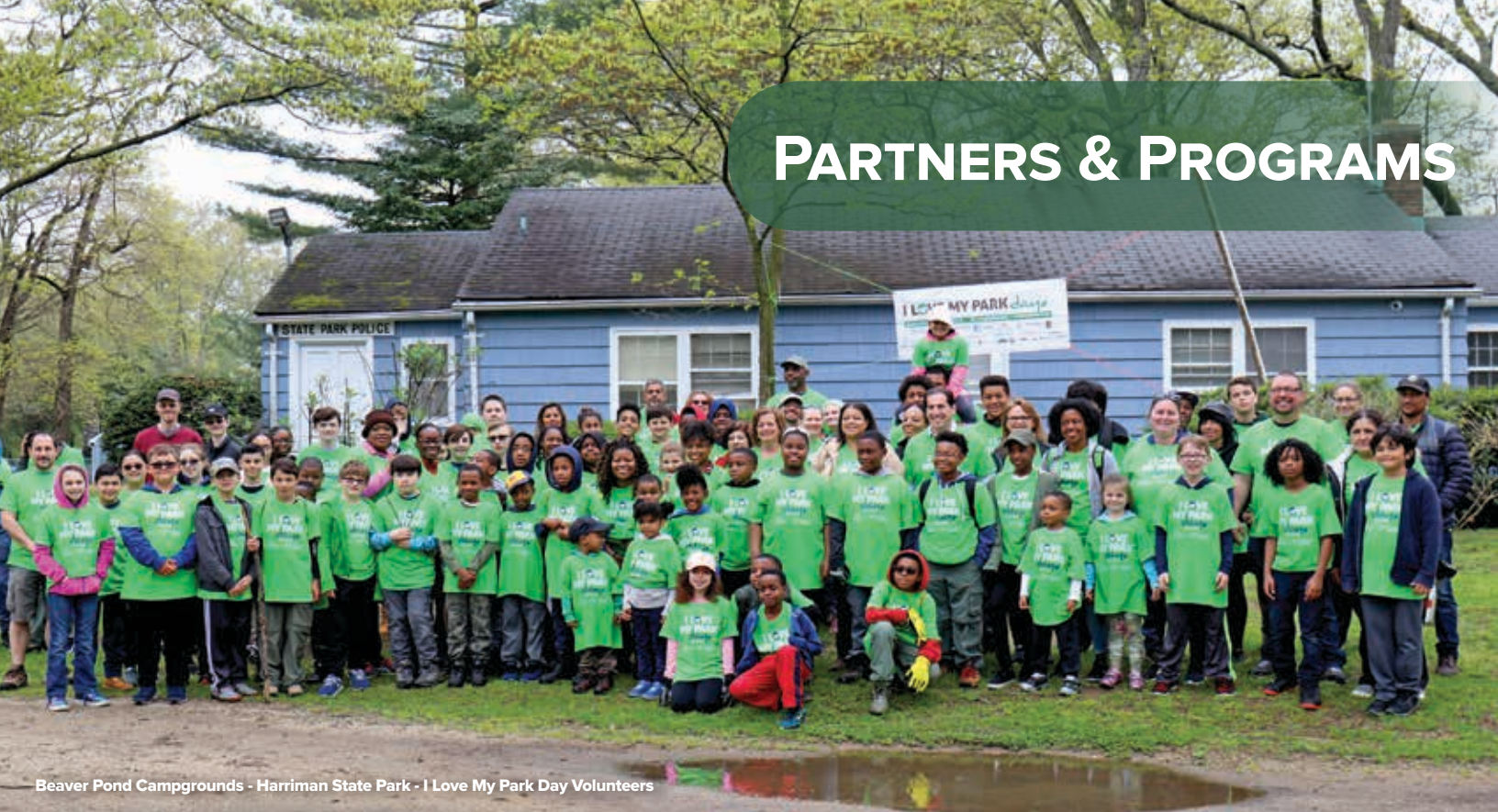
Beaver Pond Campgrounds - Harriman State Park - I Love My Park Day Volunteers