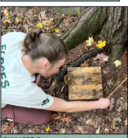
SUNY ESF Club member monitoring a salamander cover board.