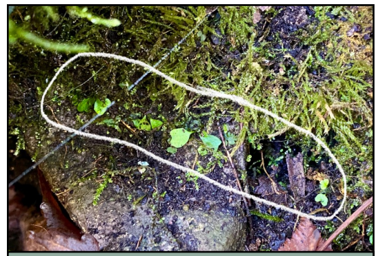
Young AHTF, the offspring of transplanted ferns, were discovered at Clark Reservation in October 2023.

Our efforts to conserve and protect the threatened American hart's-tongue fern (AHTF) continued this fall season. In October, we collected data on over 700 AHTF transplants at five sites in Onondaga and Madison counties. Survival and growth of the transplanted ferns remains promising at most sites, where some established transplants have been growing for eight years now. In an exciting development this fall, offspring from transplanted AHTF were observed for the first time since transplanting began in 2015! Dozens of naturally growing young ferns were noted at a site in Clark Reservation State Park very close to where several mature AHTF transplants have been producing spores for about 7-8 years. This discovery represents a significant step toward the ultimate goal of the AHTF propagation and reintroduction project- creating and augmenting self-sustaining AHTF populations (Cont'd p. 5).