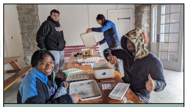
SUNY Cortland Conservation Biology Students identifying benthic macroinvertebrates as part of a lab visit at Fillmore Glen State Park.