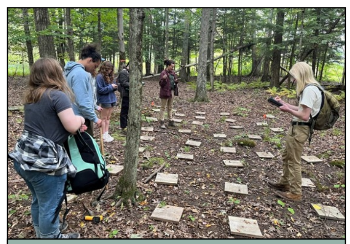
Salamander cover board surveys at Selkirk Shores State Park.

the property. We capped off the semester with a fun night of jeopardy with some cool prizes. This was by far the best semester since COVID with tons of participation and lots of interest in the club and FORCES.