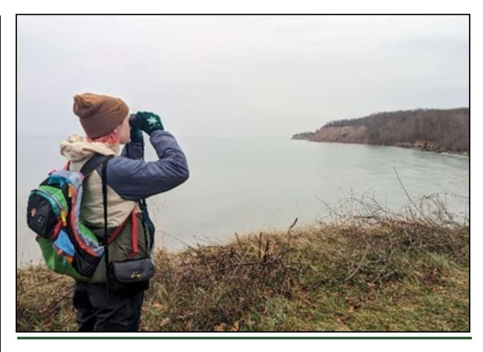
The FORCES mission is to engage New York State college students to simultaneously improve OPRHP resources and enrich student academic, recreational, and career opportunities.