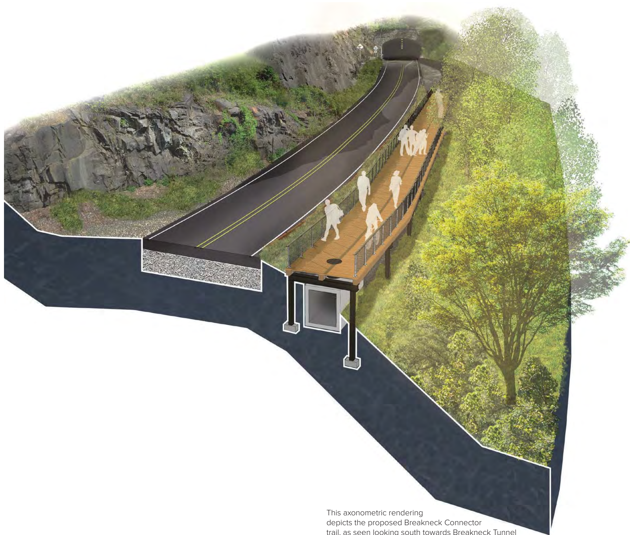
This axonometric rendering depicts the proposed Breakneck Connector trail, as seen looking south towards Breakneck Tunnel and trailhead. The long-term vision includes burying utilities underground. Occasional vaults with manhole access would be required for maintenance, as shown in the foreground.