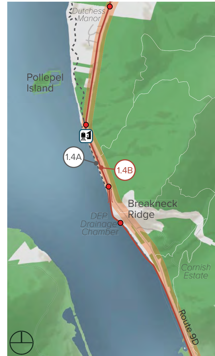
Map 1.4 - Breakneck Connector: Breakneck Tunnel/Headlands to Breakneck Ridge Station Pedestrian Bridge