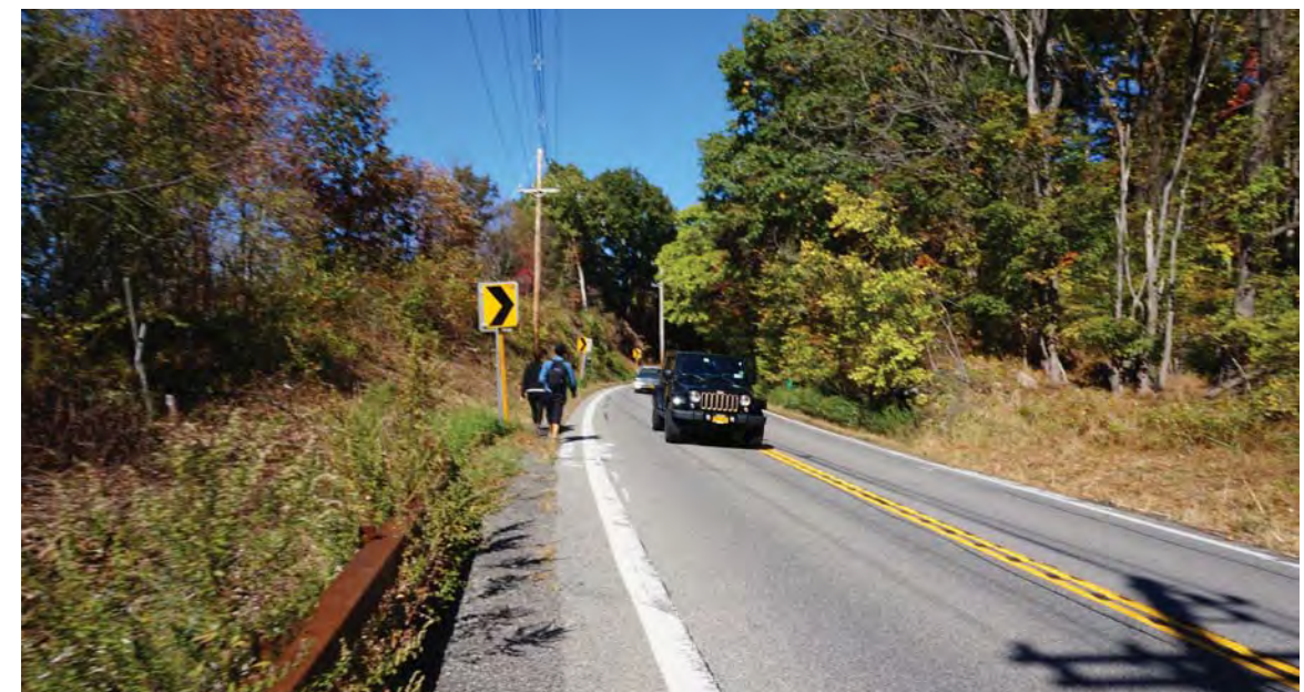
With no walking path, pedestrians walk along Route 9D where cars travel in excess of 55mph