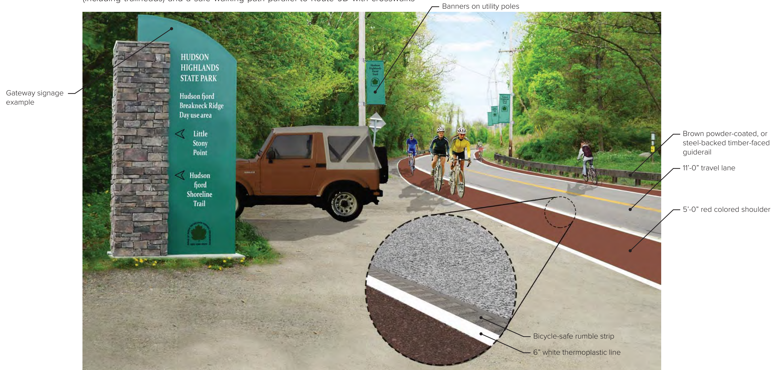
Rendering showing proposed Route 9D improvements near Little Stony Point. View looking north

at key points for hikers to get safely from their cars to trailheads. Shoulder parking improvements will support improved pedestrian safety. Parallel parking on cleared and widened shoulders should be implemented where space permits in the short term, although the long term strategy is to remove parallel parking to reduce conflicts. The Washburn and Breakneck Ridge Station parking lots will both be expanded, and it is proposed that Dutchess Junction Park will become a new parking area. Parking in non-designated areas should result in parking fines.