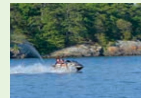
Wellesley Island State Park

Burnham Point + Canoe-Picnic Point + Cedar Island* + Cedar Point Coles Creek Cumberland Bay Dewolf Point Eel Weir Grass Point Higley Flow Jacques Cartier Keewaydin Kring Point Long Point Macomb Reservation Mary Island + Point Au Roche Robert Moses Southwick Beach Waterson Point* + Wellesley Island Westcott Beach Whetstone Gulf