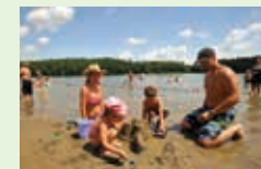
Moreau Lake State Park

Cherry Plain Grafton Lakes Max V. Shaul Mine Kill* Moreau Lake Peebles Island* + Saratoga Lake State Boat Launch + Saratoga Spa Schodack Island Thacher Thompson's Lake-Thacher +