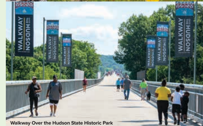
Walkway Over the Hudson State Historic Park