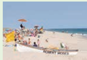
Robert Moses State Park

Bayard Cutting Arboretum Belmont Lake Bethpage Caleb Smith Preserve Camp Hero Captree Caumsett State Historic Park Preserve Connetquot River State Park Preserve Hallock Heckscher Hempstead Lake Hither Hills Jones Beach Montauk Downs Montauk Point* Nissequogue River Orient Beach Planting Fields Arboretum State Historic Park Robert Moses Sunken Meadow Valley Stream Wildwood