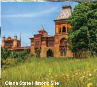
Olana State Historic Site