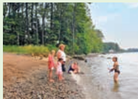
Mexico Point Boat Launch

Canadarago Boat Launch Chenango Valley Chittenango Falls + Clark Reservation Delta Lake Gilbert Lake Glimmerglass Green Lakes Mexico Point Boat Launch + Pine Grove Boat Launch + Sandy Island Beach Selkirk Shores Verona Beach