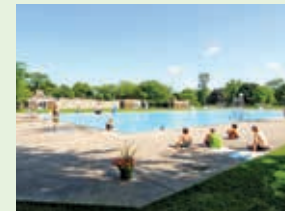
Fort Niagara State Park

Artpark Beaver Island Big Six Mile Creek Marina + Buffalo Harbor Evangola Fort Niagara Four Mile Creek Golden Hill Niagara Falls Wilson-Tuscarora Woodlawn