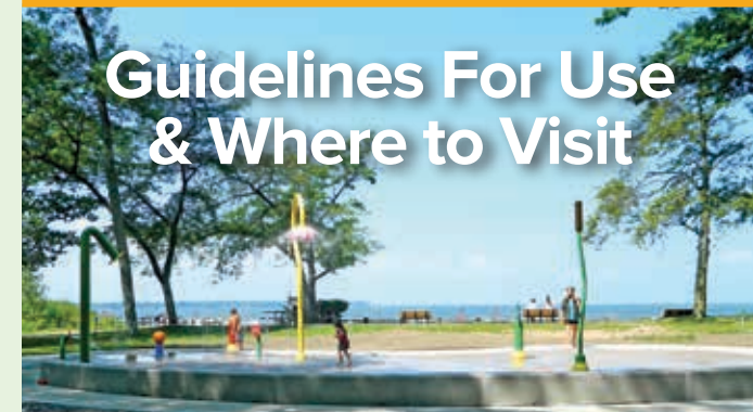
Verona Beach State Park