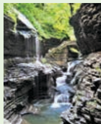
Watkins Glen State Park

Allan H. Treman Marine Park Buttermilk Falls (excludes Jennings Pond) Canandaigua Lake Marine Park Cayuga Lake Chimney Bluffs + Dean's Cove Boat Launch + Fair Haven Beach Fillmore Glen Honeoye Lake Boat Launch + Keuka Lake Lodi Point* Long Point Robert H. Treman Sampson Seneca Lake Stony Brook