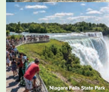
Niagara Falls State Park