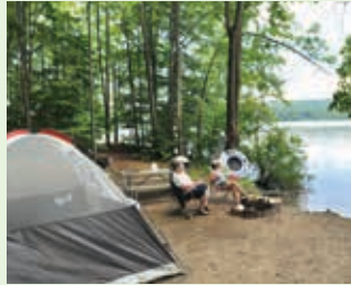
Delta Lake State Park

Betty & Wilbur Davis Bowman Lake Chenango Valley Delta Lake Gilbert Lake Glimmerglass Green Lakes Oquaga Creek Selkirk Shores Verona Beach