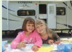
Wildwood State Park