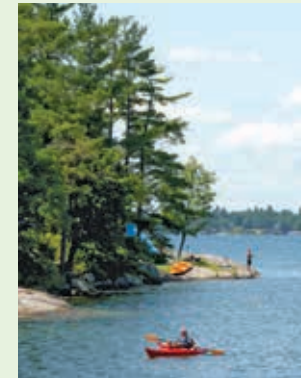
Kring Point State Park

Burnham Point Canoe Point Cedar Island Cedar Point Coles Creek Cumberland Bay Dewolf Point Eel Weir Grass Point Higley Flow Jacques Cartier Keewaydin Kring Point Long Point Macomb Reservation Mary Island Robert G. Wehle Robert Moses Southwick Wellesley Island Westcott Beach Whetstone Gulf