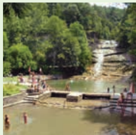
Buttermilk Falls State Park

Buttermilk Falls Cayuga Lake Fair Haven Beach Fillmore Glen Keuka Lake Long Point Newtown Battlefield Robert H. Treman Sampson Stony Brook Taughannock Falls Watkins Glen