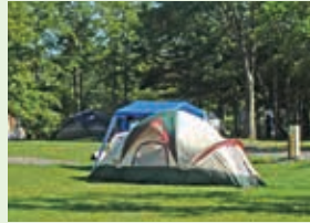
Darien Lakes State Park

Darien Lakes Hamlin Beach Lakeside Beach Letchworth