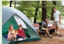
Moreau Lake State Park

Cherry Plain Max V. Shaul Moreau Lake Schodack Island Thompson's Lake - Thacher