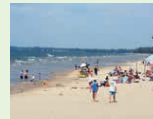
Southwick Beach State Park

For golf information, contact the facility directly or visit parks.ny.gov