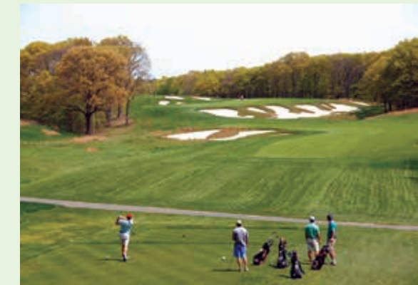
Bethpage State Park