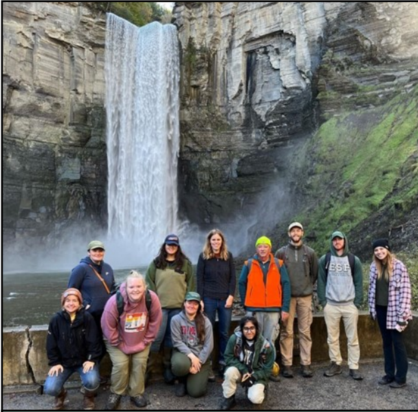
Finger Lakes and Central Stewards, and Staff on a tour of the Taughannock Falls State Park Gorge Trail after an eastern red-backed salamander survey.