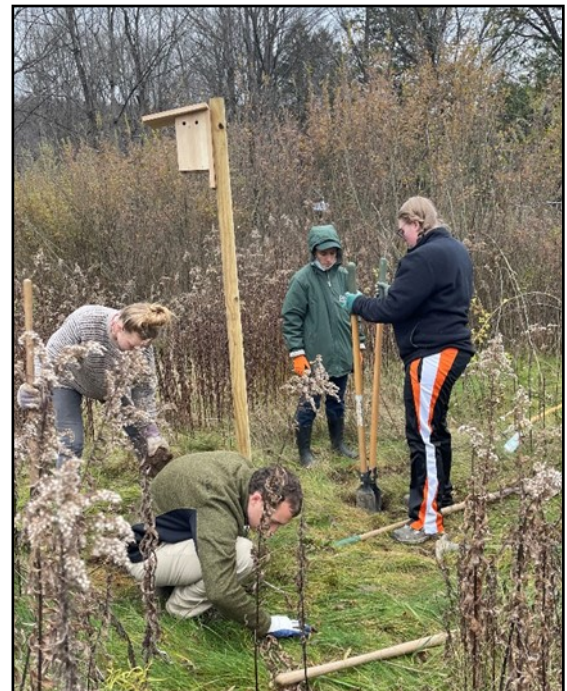
SUNY ESF FORCES Club members and COAS Stewards posting a blue bird box in the old campground at Chittenango Falls State Park.