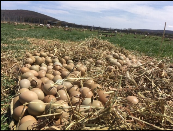
Just a "few" eggs to be picked, washed and sorted.