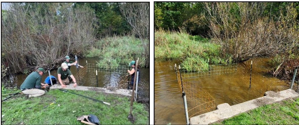
Installation of culvert protection fencing at Glimmerglass State Park.

In September, members of the Central EFT staff installed a culvert protection fence at Glimmerglass State Park. The beavers in "Beaver Pond" had been busy damming up a culvert located downstream of the pond, causing it to flood the surrounding area. With a Beaver Permit obtained from the NYSDEC, Park Staff were able to remove debris that were causing the culvert to back up. Unfortunately, clearing the debris was only a temporary solution. Beaver instinctually dam near the sound of running water, so although the culvert was being cleared, the beavers continued to dam it back up daily. Removing the debris that dammed the culvert became a timely everyday task for Park Staff. Culvert protection fencing provides a long-term solution in preventing culvert damming. Increasing the surface area, creates more work for the beaver and ultimately making it less desirable to dam. The trapezoidal shape of the fencing also presents an obstacle for the beaver. The fence will angle the beaver farther away from the inlet as they build the dam, discouraging the beaver to continue to build.