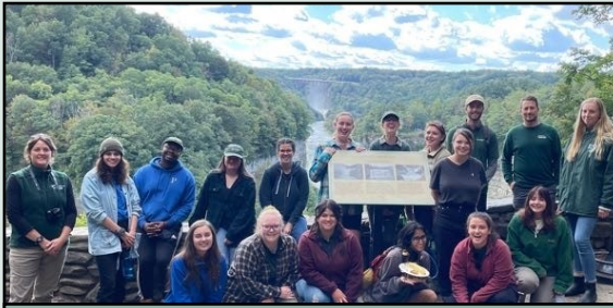
FORCES Membership gathering participants at Inspiration Point.