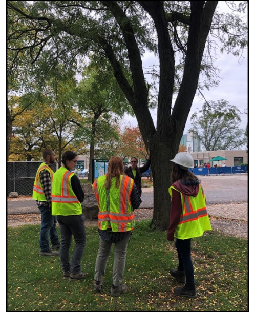
Niagara Region Stewards learning the tree tagging system at the Niagara Falls Visitor Center project site.