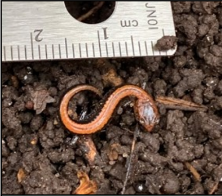
Red-backed salamander.

One of the more exciting projects that Finger Lakes Stewards participate in each year is monitoring eastern red-backed salamanders ( Plethodon cinereus ) at Taughannock Falls and Buttermilk Falls State Parks. Plethodon species are lungless salamanders which rely on cutaneous respiration. This means rather than breathing through lungs, or with gills, gas exchange occurs across their skin and the tissues lining their mouths. Eastern red-backs are NYS's most abundant salamander, and may be our most numerous forest vertebrate. They are sensitive to environmental changes within their small home ranges, so tracking population abundance over time can provide insight to forest health (Welsh & Droege, 2001).