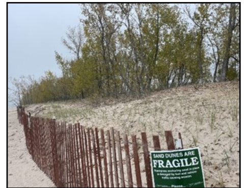
A section of the beach after dune grass transplanting.