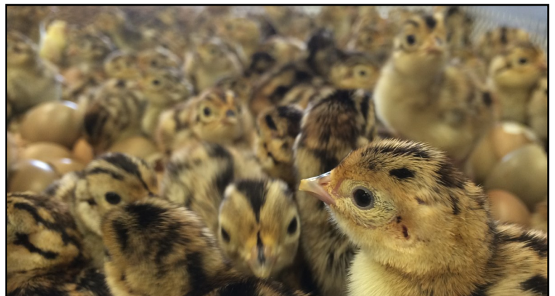
Freshly hatched chicks await sorting.

Once they hit the magical 6 week mark, the young birds are moved from the nurseries to the flight pens. This is the time when we can sort out the hens from the roosters to make fall shipping needs easier and also place those funny little sunglasses upon the pheasants (peepers or specs to those in the business). "What's on the birds faces?" is usually the number one question from visitors to the facility. These "specs" as we call them, help prevent picking and excessive stress to the birds. Although the pheasants have been raised in captivity, they still retain much of their wild and flighty characteristics and these specs are removed prior to release each fall.