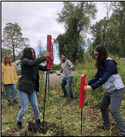
Niagara Region Stewards installing deer exclosures to protect maple and sycamore saplings planted at Beaver Island SP.