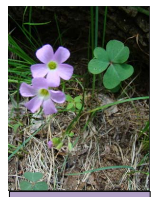
Violet Wood-sorrel in flower ( Oxalis violacea)

A rare plant, Violet Wood-sorrel (Oxalis violacea), S2, G5, was detected on Cedar Mountain near the Massachusetts border, although the plant was not in flower at the time. A NYNHP biologist returned to the site later in the season to confirm identification. This rocky summit species was previously known from the park as one of 14 statewide locations, but this new sighting extends the known range at Taconic.