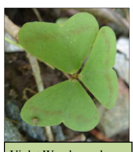
Violet Wood-sorrel ( Oxalis violacea ) by Richard Ring

The bird diversity was impressive and it should be noted that not all of the 66 species found during the BioBlitz are considered breeding