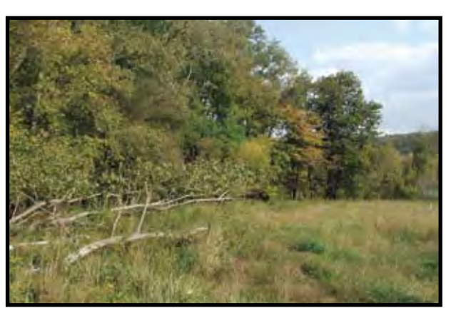
SWNA Alternate Trail or Spur: The trail will be located on the edge of the woodland and meadow to minimize impact on the remnant floodplain forest and take advantage of views of Buttermilk Falls.