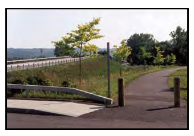
SP 22+500: View south of asphalt trail on west side of Taughannock Blvd./N. Y. S. Route 89. BDT