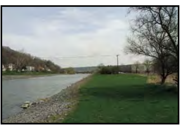
SP 18+000: Trail passes the Cherry Street Industrial area to the east. Trail will cross on a new bridge over the channel in the vicinity of Cecil A. Malone Drive.