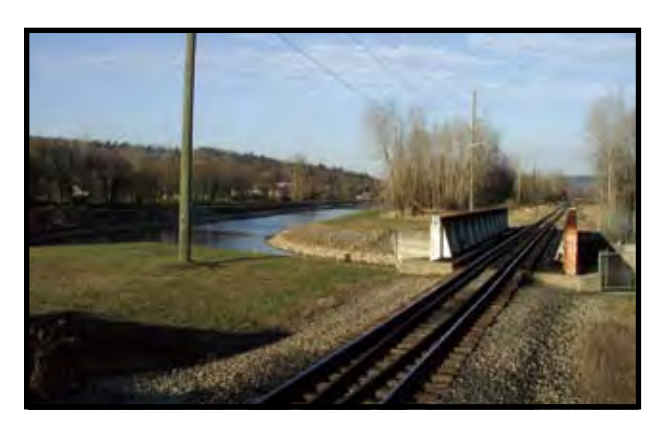
SP 15+125: Southern crossing of the Cayuga Inlet Flood Control Channel. Trail bridge will be located parallel to the active railroad bridge.

Property ownership in this area is unclear and will require further research. If not owned by New York State or the City of Ithaca, the OPRHP will need to acquire title to the property. Fencing between the trail and the railroad may be required in this area.