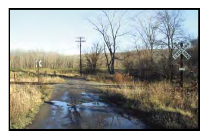
SP 14+875: Existing at-grade crossing of active Norfolk Southern rail line. Crossing will be upgraded for vehicle and pedestrian traffic.

At SP 14+875 the trail will cross to the west side of the active railroad at an existing gravel access road crossing, as shown in the photo below. The access road links Floral Avenue/N. Y. S. Rte 13A to the City of Ithaca's Southwest Natural Area. At present, the City of Ithaca has not developed any patron facilities in the SWA. The BDT crossing of Inlet Road and the railroad line will require upgrading the crossing to protect trail users. OPRHP and the City of Ithaca will need to work with Norfolk Southern Railroad to design and construct the new crossing.