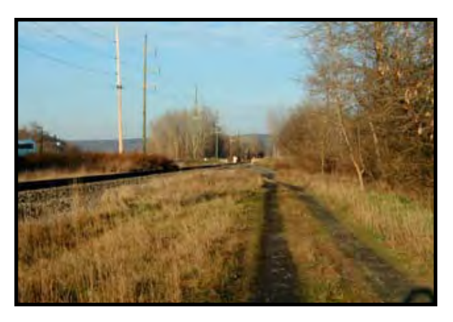
SP 14+625: Trail to be located on former railroad line that is parallel to the active Norfolk Southern Railroad. Safety fence is recommended to be installed between the two corridors.

two corridors, following the design on Figure V-18, page V-114, is recommended to be placed along this section of trail.