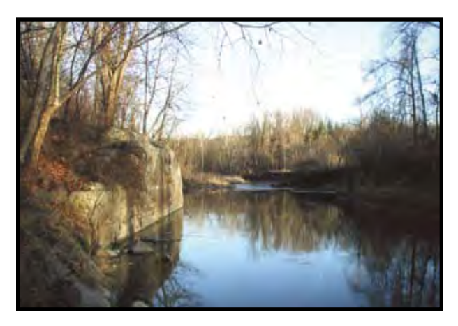
SP 13+200: Trail bridge to be constructed over the Cayuga Inlet along the abandoned railroad line. North abutment is intact.

At SP 13+200 the trail will cross the Cayuga Inlet. A new 150-foot long bridge will be required for the crossing. Old concrete railroad bridge abutments, seen in the photo below, remain at this crossing but are not in useable condition for the new bridge. The old abutments will be left in place to serve as erosion-control retaining walls and new abutments will be constructed behind the old walls.