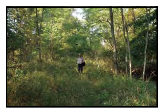
SP 12+500: Abandoned railroad corridor owned by OPRHP.

This segment of trail passes adjacent to remnant floodplain forest. Construction disturbance should be constrained to the top of the prism of the old rail corridor to minimize impact to the forest.