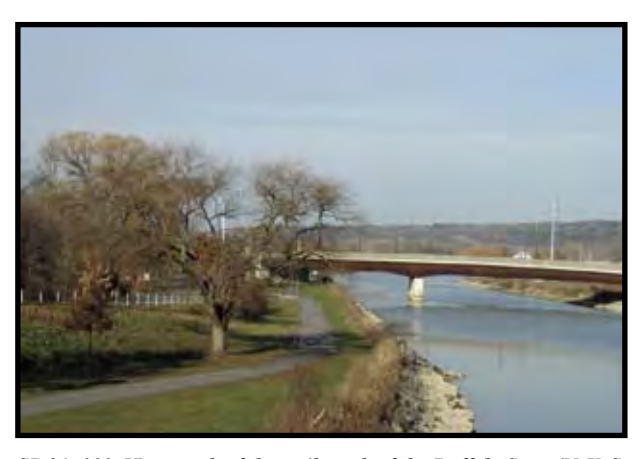
SP 21+000: View north of the trail north of the Buffalo Street/N. Y. S. Route 96 bridge on the west side of the flood control channel where trail will continue to use the Cayuga Waterfront Trail into Cass Park.