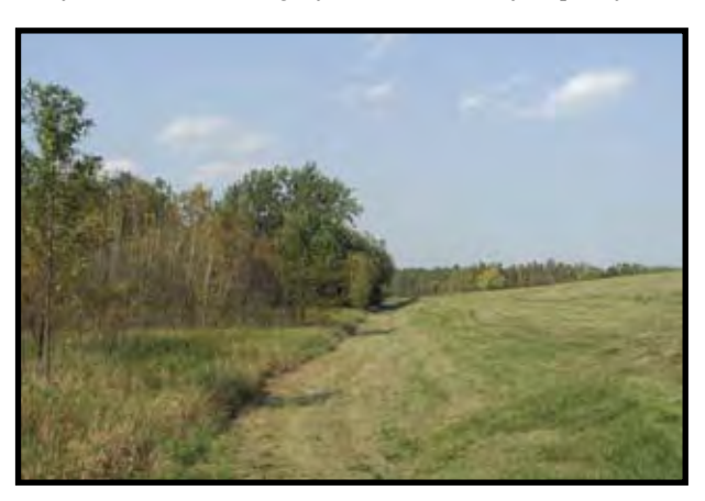
SWNA Alternate Trail or Spur: The trail will meet the flood control levee and ramp up the west side and down the east side as the traip continues to the north.