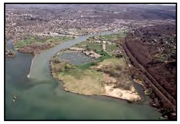
Spur Trail: The complex of recreational lands along the west side of the Cayuga Inlet Flood Control Channel and the southwestern end of Cayuga Lake include Allan H.Treman State Marine Park, closest in view, the City of Ithaca's Cass Park and Cayuga Waterfront Trail immediately south and the Black Diamond Trail along the west side of the complex, west of N. Y. S. Route 89 (second corridor in view along the right side of the photo.)

The following photo illustrates the relationship between Allan H. Treman State Marine Park, Cass Park and the Black Diamond Trail.