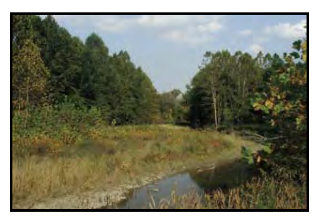
SWNA Alternate Trail or Spur: View of the Cayuga Inlet meandering through the Southwest Natural Area. Proposed alternate/spur trail will follow the southern edge of the Inlet and Inlet floodplain forest.