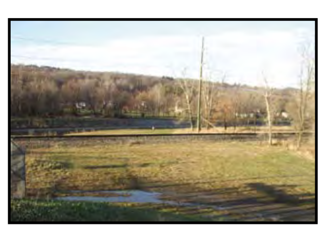
SWNA Alternate Trail or Spur: The alternate trail requires a new atgrade crossing of the active Norfolk Southern Railroad line.