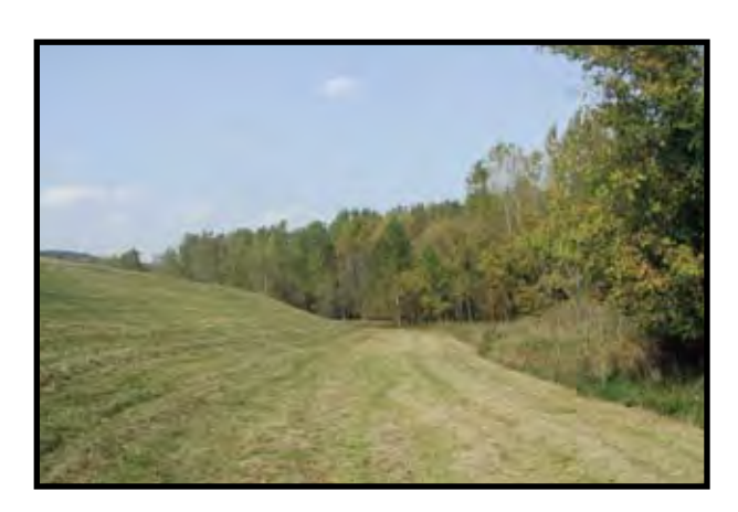
SWNA Alternate Trail or Spur: After crossing over the levee, the trail would be located along the toe of the levee as it heads northwest toward the main Cayuga Inlet Flood Control Channel.