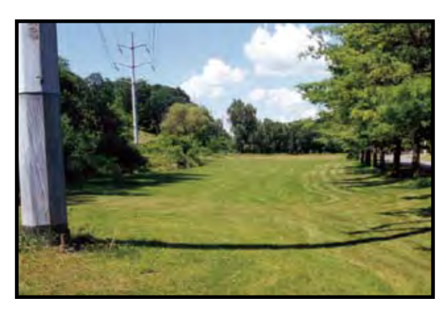
SP 23+000: View north of proposed trail corridor between the NYSEG utility corridor and Cass Park road. The BDT trailhead in Cass Park will be located in the lawn to right of second utility pole.