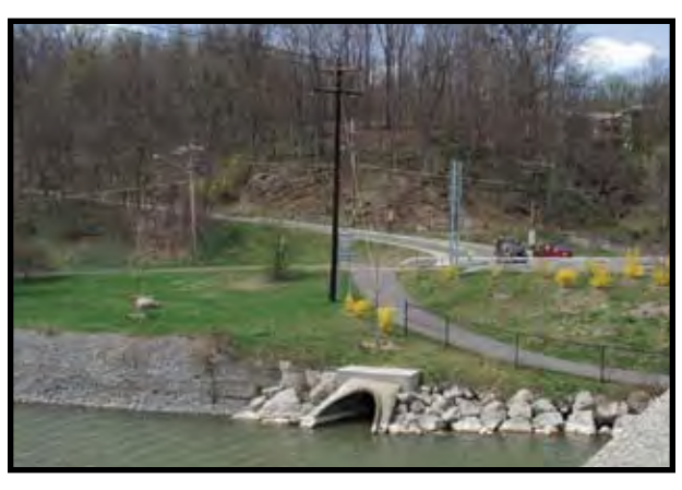
SP 20+900: View from State Street/N. Y. S. Route 79 bridge to where BDT will intersect with the Cayuga Waterfront Trail.