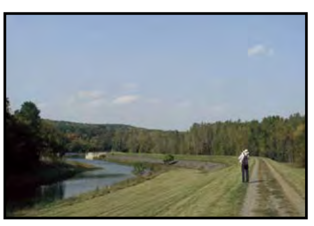
SWNA Alternate Trail or Spur: The existing gravel road on top of the levee is now informally used for walking and jogging. NYSDEC does not allow trail development on top of levees in New York State.