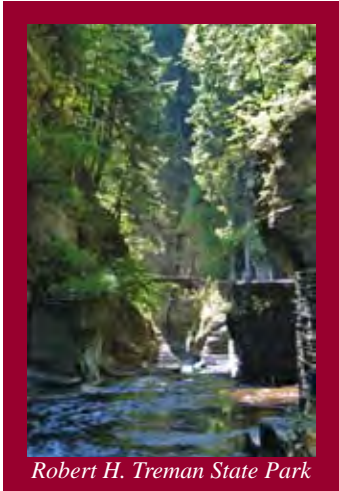
Robert H. Treman State Park