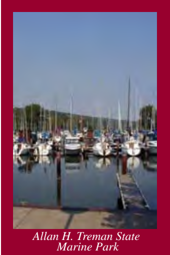
Allan H. Treman State Marine Park