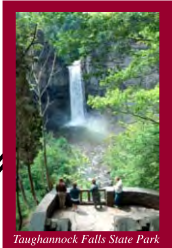
Taughannock Falls State Park