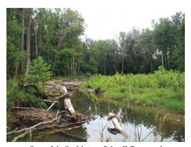
Cayuga Inlet Creek between Robert H. Treman and Buttermilk Falls State Parks

The distinctive landscape of the glacially-carved Cayuga Lake valley provides a variety of natural and cultural settings for the Black Diamond Trail. The trail connecting Robert H. Treman to Buttermilk Falls will meander down the Cayuga Inlet valley, paralleling the stream as it winds its way north to Cayuga Lake. The bottomlands are lush with regenerating floodplain forest vegetation and wildlife, dotted with small pockets of wetlands. Much of the area had been farmed in the early nineteenth and twentieth centuries and likely provided sustenance for Native American peoples who settled the area prior to European immigration settlement.