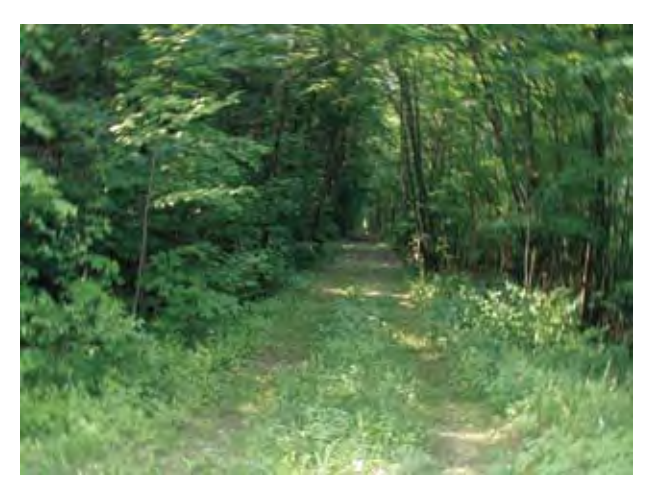
Abandoned railroad corridor berween Allan H. Treman and Taughannock Falls State Parks

Water resources within the trail's landscape range in size and scale, including the 40-mile-long Cayuga Lake, the meandering Cayuga Inlet, pocket wetlands and vernal pools less than an acre in size, hillside streams and the 300-foot-high Taughannock Creek gorge.