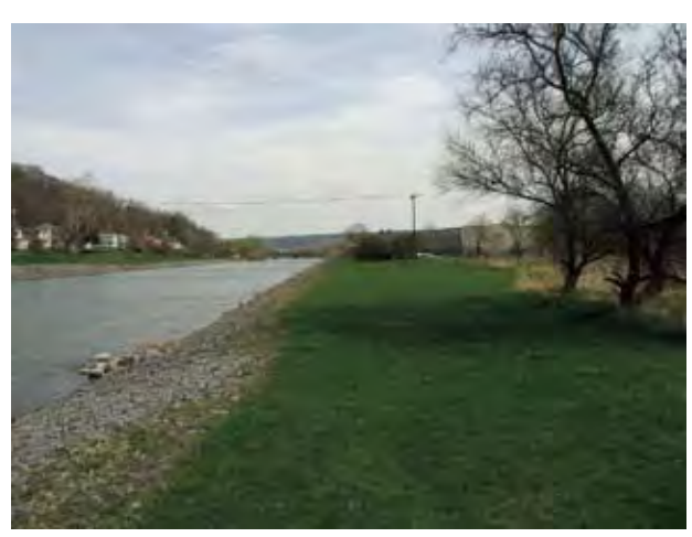
Cayuga Inlet Flood Control Channel through the west side of the City of Ithaca

From Buttermilk Falls to Allan H. Treman the trail starts out paralleling the Cayuga Inlet stream in a floodplain forest setting before crossing the stream on abandoned railroad corridor and entering into the urbanized area of Ithaca. Within the city, the trail will parallel the Cayuga Inlet Flood Control Channel, passing west of the developing Southwest Area with its new retail complex and future residential neighborhood and the Cherry Street Industrial Park. After crossing the flood control channel, the trail will enter the City of Ithaca's Cass Park, which includes ball fields, swimming pool and enclosed court sports and ice rink facility. The City of Ithaca's Cayuga Waterfront Trail will provide the link to Allan H. Treman State Marine Park.