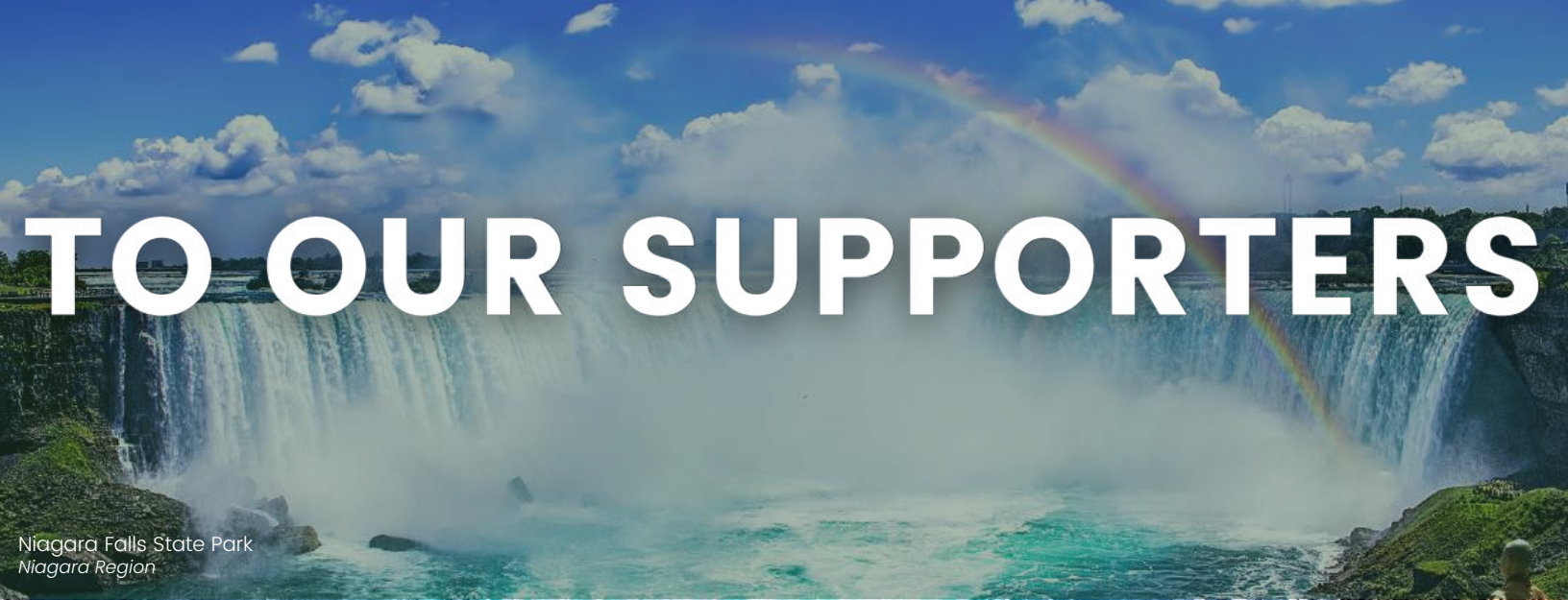
Niagara Falls State Park Niagara Region