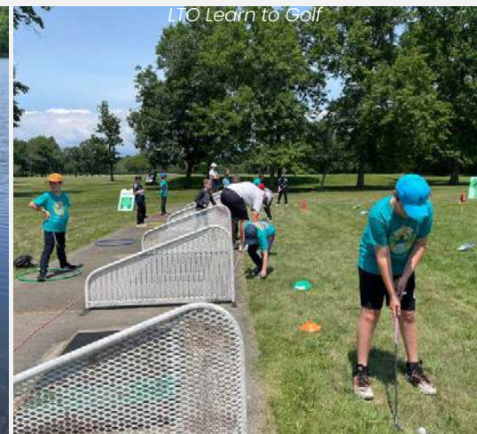
LTO Learn to Golf