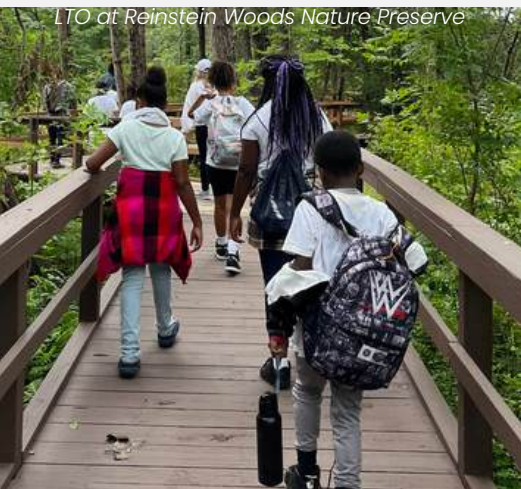
LTO at Reinstein Woods Nature Preserve

The NHT supports a wide variety of programs in public lands that encourage park visitors to enjoy the outdoors through recreation including trail development and maintenance, youth sports and activities, athletic leagues, road races and sporting events, and outreach programs that provide instruction and equipment to break down barriers to access in communities throughout the state.