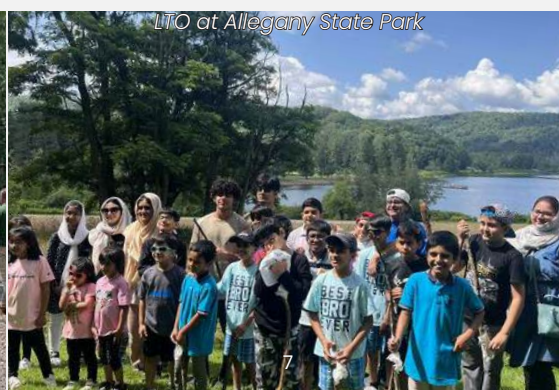
LTO at Allegany State Park