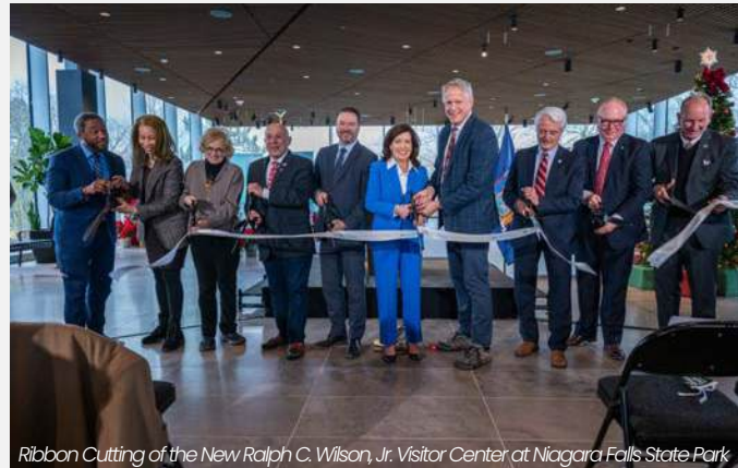
Ribbon Cutting of the New Ralph C. Wilson, Jr. Visitor Center at Niagara Falls State Park