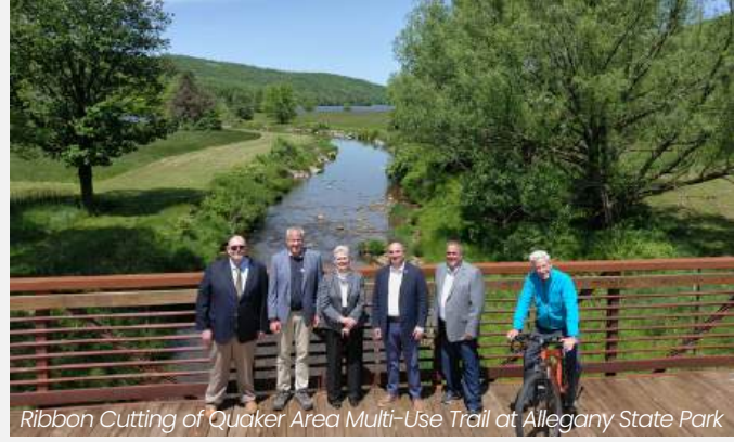
Ribbon Cutting of Quaker Area Multi-Use Trail at Allegany State Park

Now in its second year, a unique partnership with NY's state campground reservation system, Reserve America, campers have donated more than $210,000 to support State Park and DEC campgrounds through "rounding-up" when making online reservations. More than 75,000 have participated, demonstrating just how dedicated campers are to the stewardship of public lands and outdoor recreation.