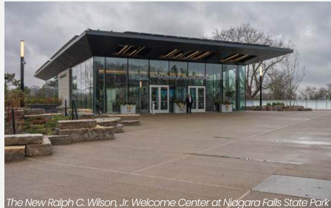
The New Ralph C. Wilson, Jr. Welcome Center at Niagara Falls State Park