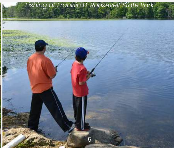
Fishing at Franklin D. Roosevelt State Park