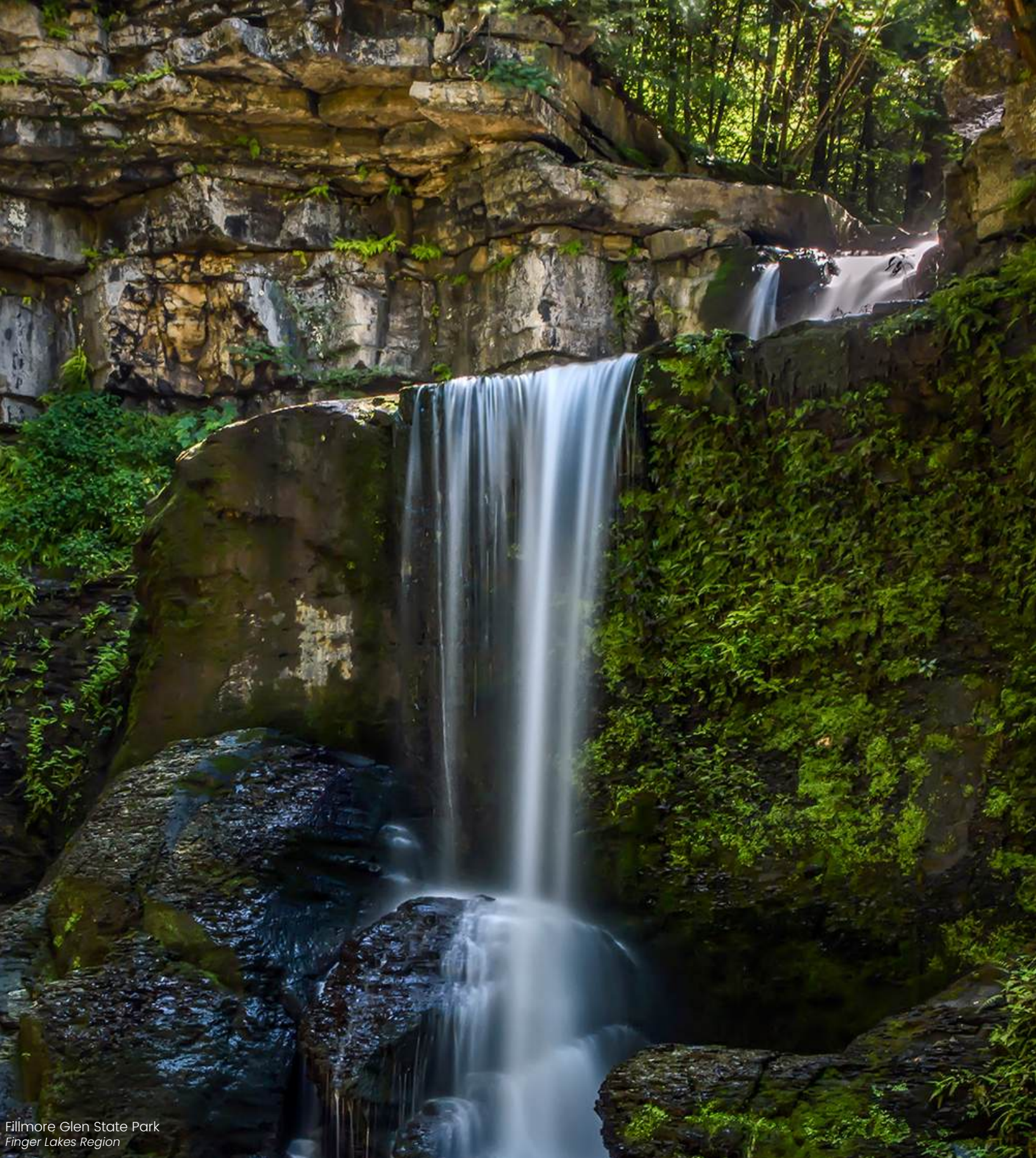
Fillmore Glen State Park Finger Lakes Region