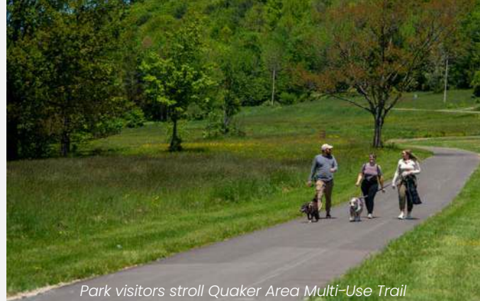
Park visitors stroll Quaker Area Multi-Use Trail