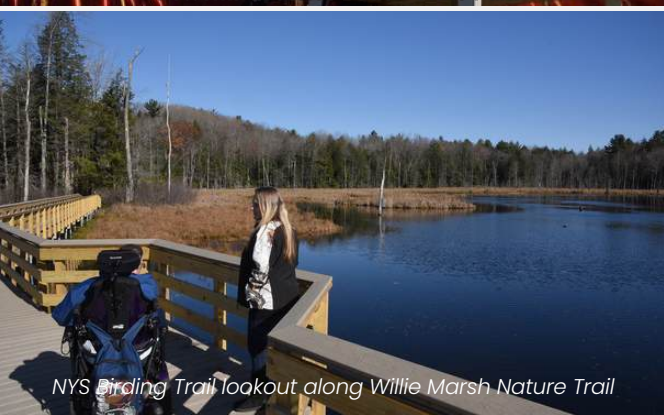
NYS Birding Trail Lookout along Willie Marsh Nature Trail

The Bike Library at Shirley Chisholm State Park in Brooklyn, entering its sixth year, plays an important role in the community by providing free educational and cycling opportunities for kids of all ages and contributing to the physical and mental well-being of the park's neighbors. Since it began, the Bike Library has made over 36000 loans. The bike library also offers education programs, and taught 86 kids to ride a bike in 40 sessions in 2023. From bike swaps to community events, the Bike Library is a positive and active part of the park and the entire community. The Bike Library is supported with funding to the NHT from the Secunda Family Foundation; the Bloomberg Foundation and Con-Edison. The library is also supported by individuals who donate bikes for use at the park.