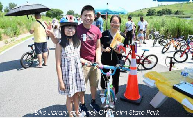
Bike Library at Shirley Chisholm State Park