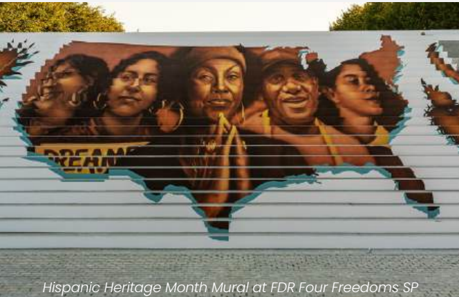
Hispanic Heritage Month Mural at FDR Four Freedoms SP