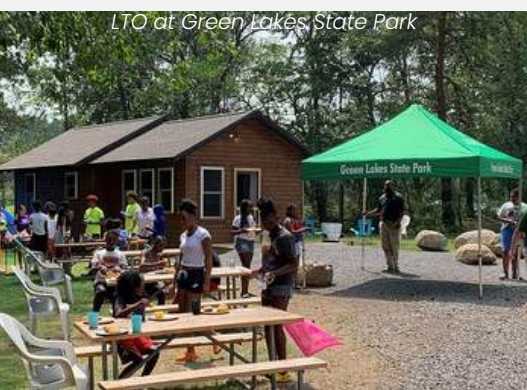
LTO at Green Lakes State Park

In the summer of 2023, Green Lakes State Park , outside of Syracuse, the state's first Ladders to the Outdoors Learn to Camp area supported with grants to the NHT from the CNY Community Foundation , the Gifford Foundation and the United Way of CNY . This innovative space in the park serves as a meeting point for youth from the Syracuse community to learn outdoor recreation skills like kayaking, fishing and hiking, as well as learn the basics of camping. The project is a centerpiece of the region's Ladders to the Outdoors program which creates community partnerships and expands access to outdoor recreation in public lands to underserved youth by providing educational programs and transportation to parks and historic sites. In the Buffalo area, the WNY Ladders to the Outdoors program continues to thrive with support from the Ralph C. Wilson, Jr. Foundation . Highlights in 2023 included group camping trips to Allegany State Park and the Taconic Outdoor Education Center .