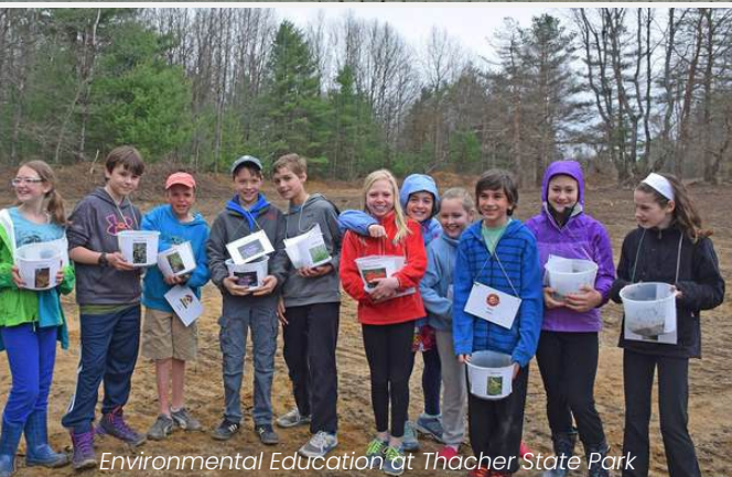
Environmental Education at Thacher State Park