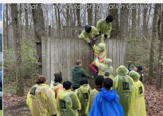
LTO at Taconic Outdoor Education Center