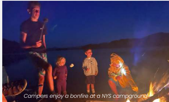
Campers enjoy a bonfire at a NYS campground