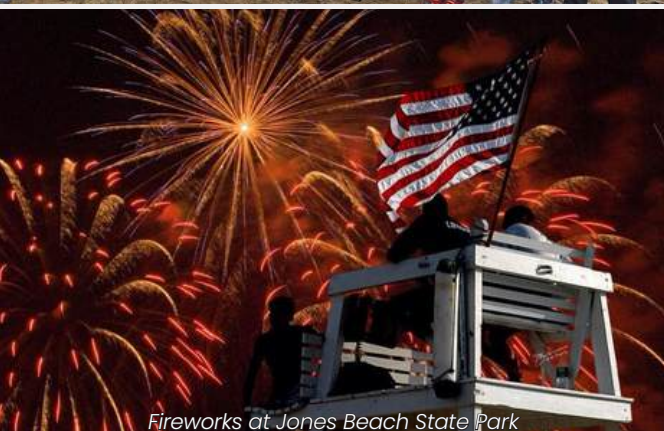
Fireworks at Jones Beach State Park