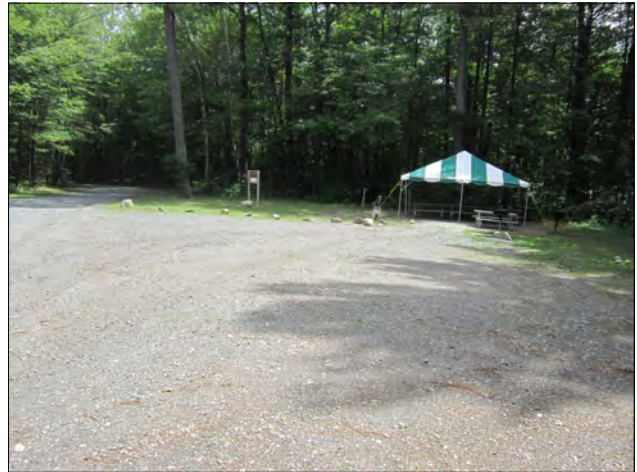
View and distance from parking lot

The Boathouse Tent is located at the far right end of the beach behind the boat rental area. It provides excellent access to the beach while avoiding the majority of the traffic. It is about a 20 second walk to both the beach and the bathrooms.