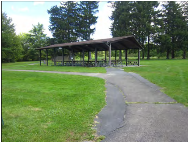
View and distance from parking lot