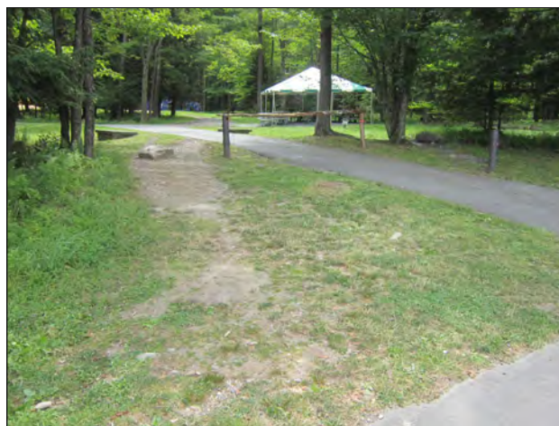
View and distance from parking lot

The South Tent is located just off the south corner of the main parking lot. It is situated close to bathroom facilities, a playground and the beach. It has a small grassy area for kids to play.