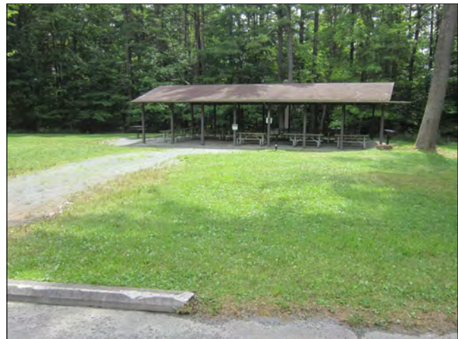
View and distance from parking lot

Rabbit Run is accompanied by a horseshoe pit and volleyball court. The bathrooms are about a 30 second walk from the pavilion and the beach is another 30 second walk beyond that. Rabbit Run is a perfect area for a larger party that is just far enough from the beach for some privacy but close enough to allow easy access. There is also a potable water spigot.