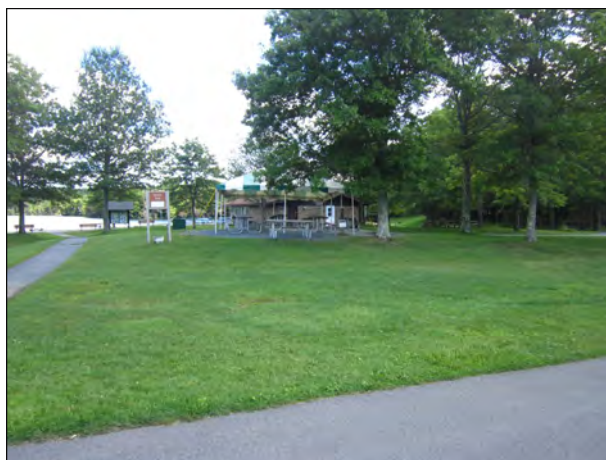
View and distance from parking lot

The Beach Tent is located between the beach and main parking lot. It is in close proximity to the Concession stand and bathroom facilities. It is surrounded by a grassy area large enough to toss a ball or frisbee around and is just a short walk to the playground. The bathrooms are about a 20 second walk.