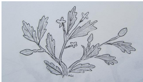
Sea rocket grows on the beach

You can return to the parking lot by heading up the gravel road to the top, or backtracking.