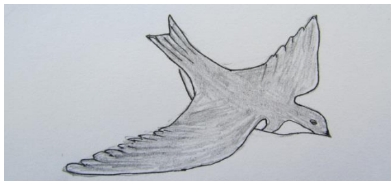
Bank swallows can be seen on the beach and over the pond