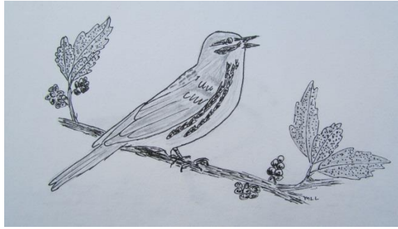
Prairie warbler singing from bayberry

In these natural thickets are shrubs and trees such as bayberry, black cherry and red cedar. They provide nesting spots for birds such as prairie and yellow warblers, cedar waxwings and rufous-sided towhees, among others. Can you see or hear any?