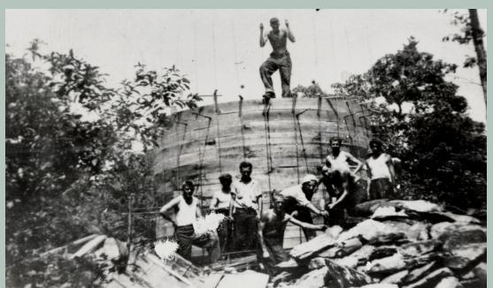
CCC Workers at Lake Taghkanic -1935

Previously known as Lake Charlotte, Lake Taghkanic was donated to the State of New York in 1929 by Dr. McRa Livingston. In 1933 a Civilian Conservation Corp (CCC) camp was established at the park. Their projects included construction of the East Bathhouse, the East Beach, the camping and cabin areas and the water tower.