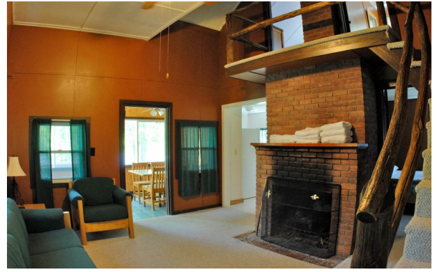
Full-Service Cottage Exterior & Interior Living Room

Laundry: The park has a coin operated laundry available for our camping, cabin and cottage guests. Quarters can be obtained at the Park Office. The laundry is located near the west end cottages. Small packets of laundry detergent and dryer sheets can be purchased in the laundry building.