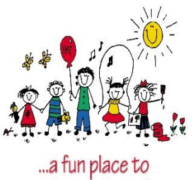
...a fun place to play and learn!