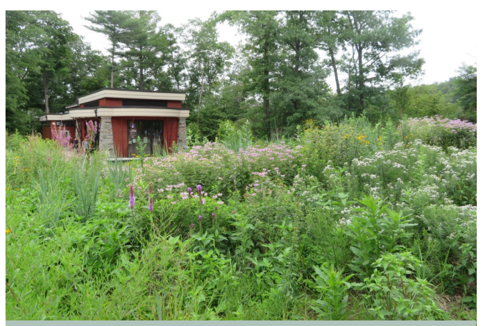
The pollinator garden at the Taughannock Falls Overlook is meant to mimic the conditions of a native meadow.

Most of the dead plant material is left in place during the winter to recycle nutrients back into the soil. The plant material also provides shelter and food for native pollinators and animals during the winter months.