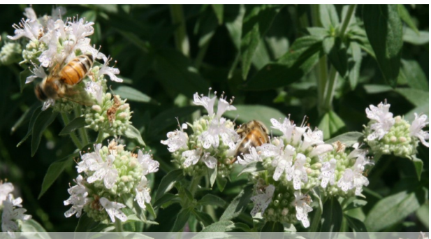
Native species in the mint family are pollinator magnets

Plant native plants! There are a growing number of nurseries specializing in native plants. If you cannot find one, contact your local native plant society to help. The Finger Lakes Native Plant Society can be found at www.flnps.org.