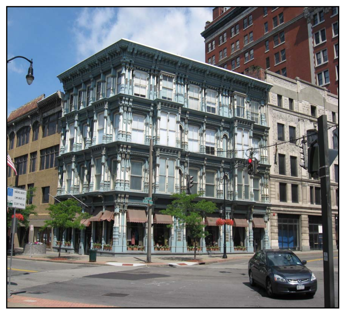
The Perry Building, on the corner of Court and Chenango Streets in Downtown Binghamton.

Built in 1876 and designed by noted 19<sup>th</sup> Century architect Isaac Perry, the Perry Building is Binghamton's only "cast iron" building. Its two façades are made of individual cast parts bolted together. This industrial revolution-era technology created highly decorative building elements at a cost far lower than the traditional carved wood or stone. Since the decorative iron façade elements were also structural, they allowed the use of large windows such as those seen in the Perry Building. The material itself offered a measure of fireproofing. Finally, this was the modular construction technology of its time. Components of an entire building facade could be cast in foundries, shipped across the United States by rail, and then installed quickly and easily on site. Binghamton has been a CLG since 1988.